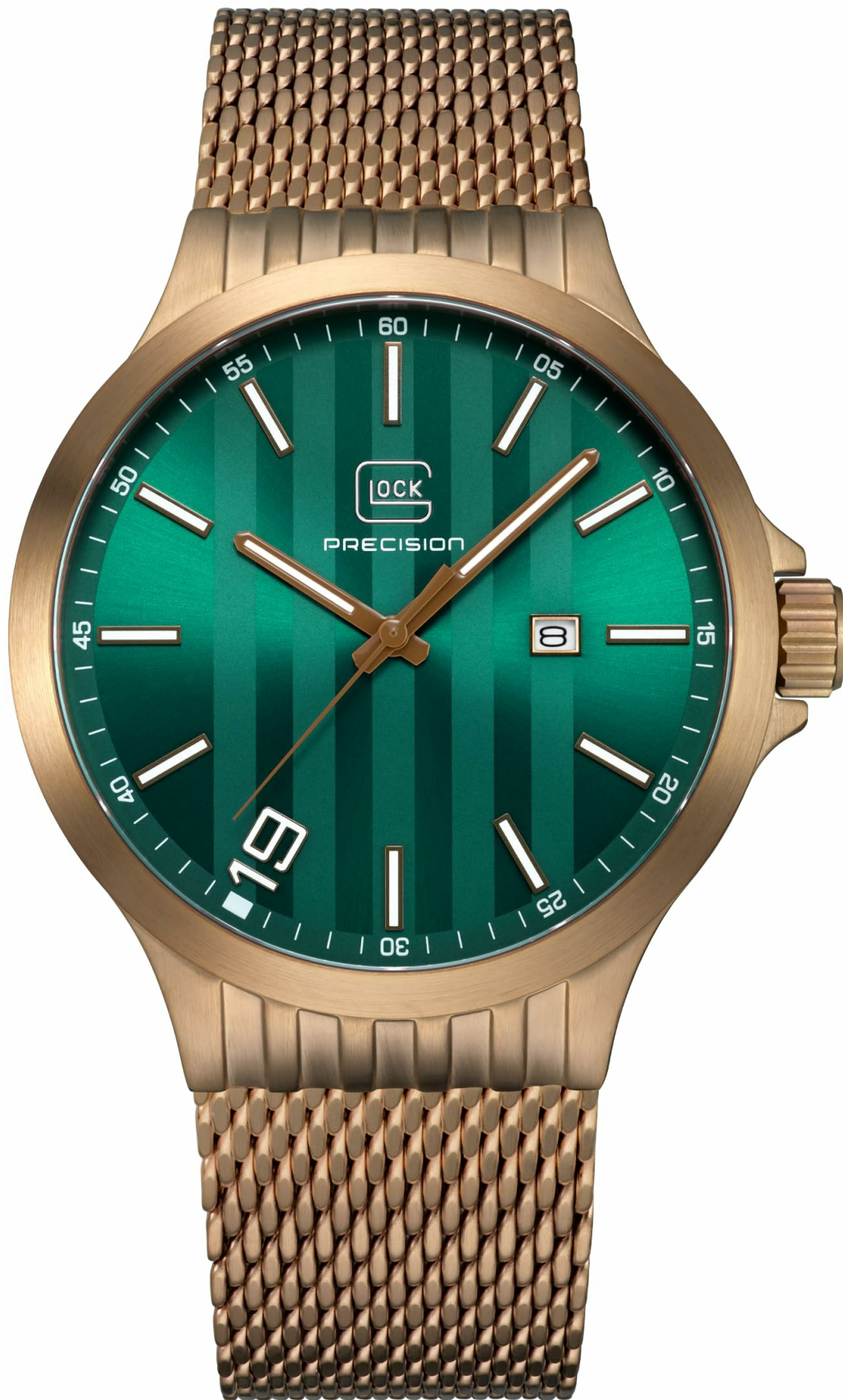
Figure 1: Front view of the GLOCK GW-12 Men's Quartz Watch.