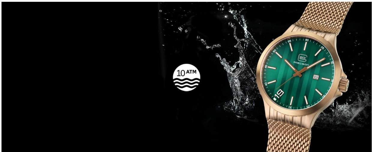
Figure 4: Diagram illustrating the 10 ATM water resistance rating of the watch.

Your GLOCK GW-12 watch is water-resistant up to 10 ATM (100 meters). This means it is suitable for swimming, snorkeling, and showering. However, it is not recommended for scuba diving or high-impact water sports. Always ensure the crown is fully pushed in before any contact with water.