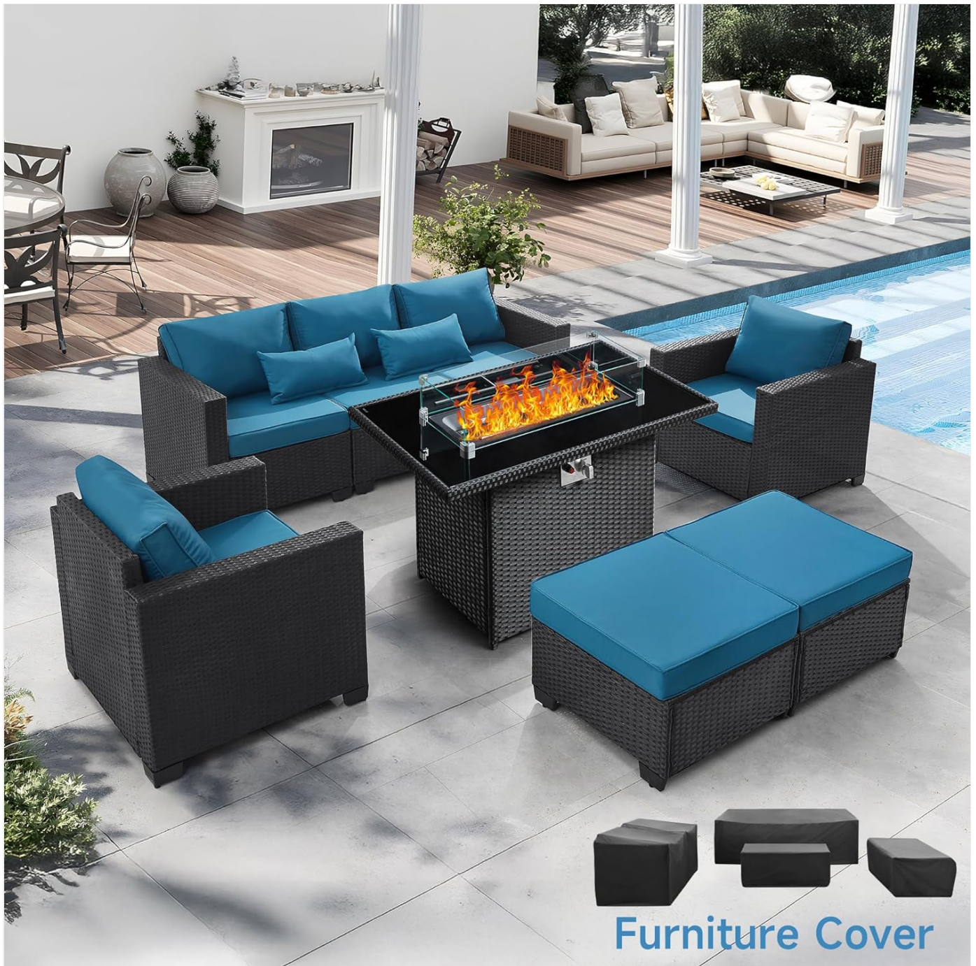
Image 5.2: The wudipatio 6-Piece Outdoor Patio Furniture Set covered with the included protective covers.