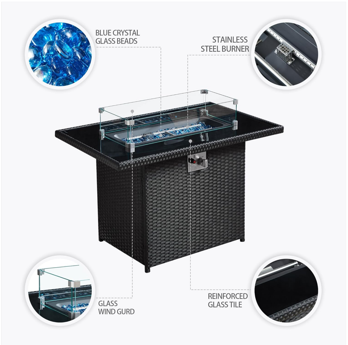
Image 4.1: Close-up of the fire pit table, highlighting the stainless steel burner, blue crystal glass beads, glass wind guard, and reinforced glass tile top.