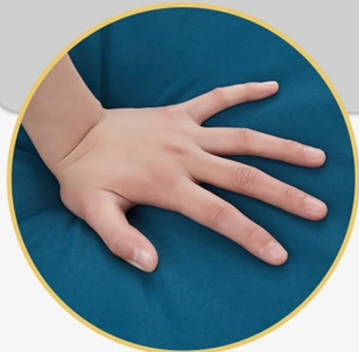
Image 5.1: Details of the water-resistant cushion material and the hand-woven PE wicker construction.