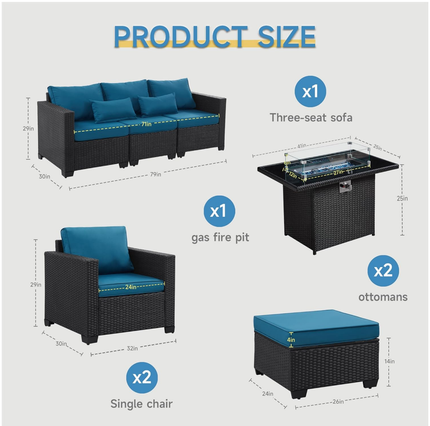
Image 3.1: Dimensions of the three-seat sofa, single chair, ottoman, and gas fire pit table.