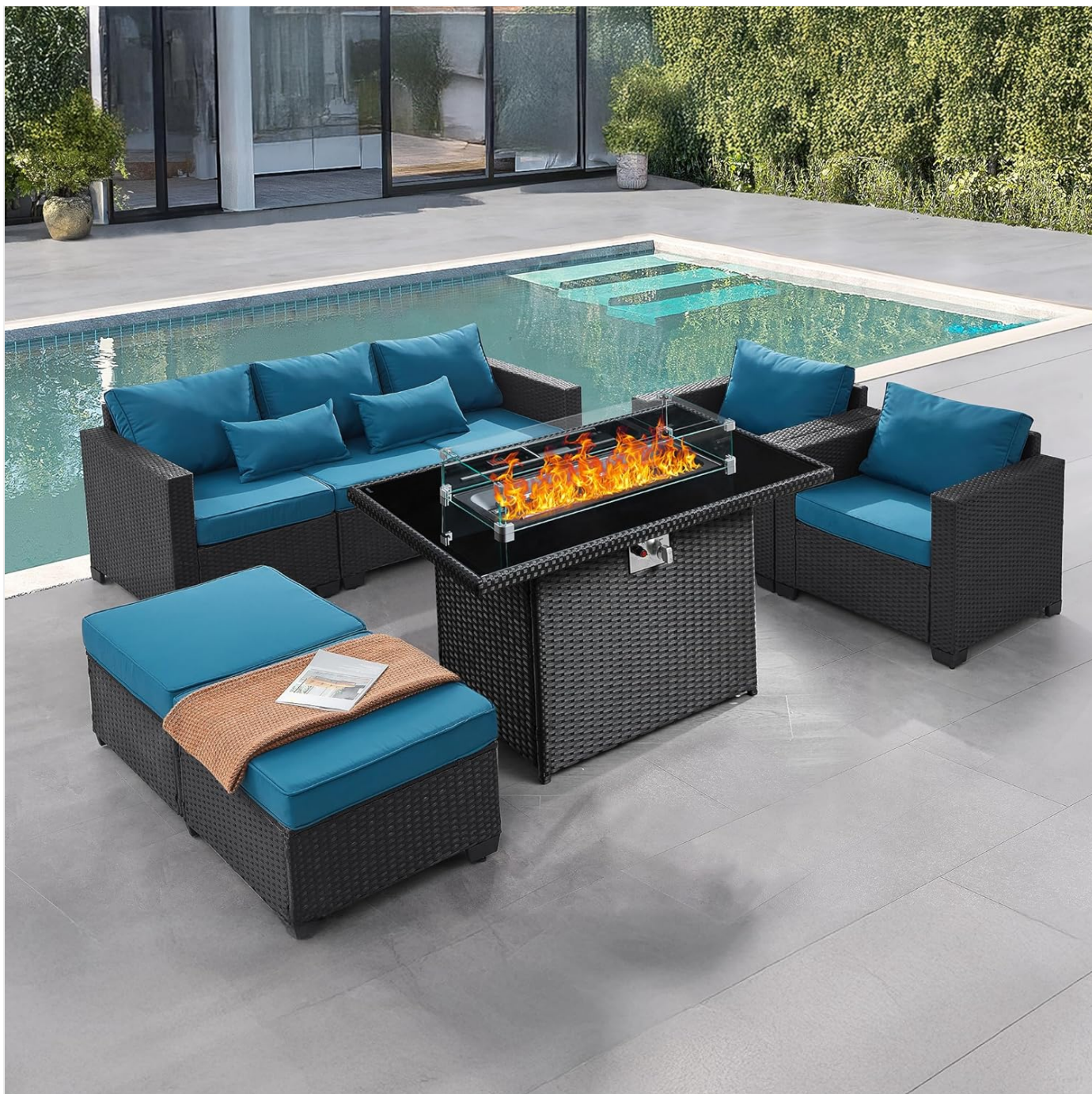
Image 1.1: Complete wudipatio 6-Piece Outdoor Patio Furniture Set with fire pit table, showcasing the Peacock Blue cushions.