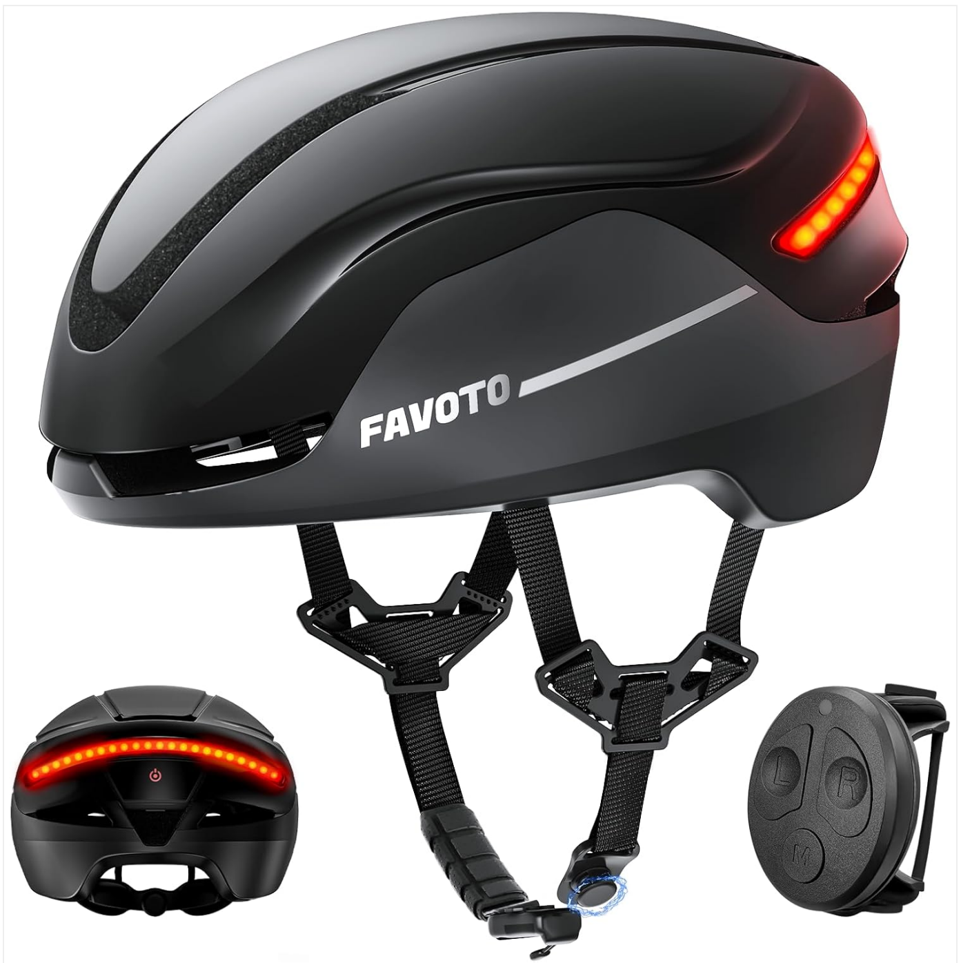
Figure 1: Favoto Smart Bike Helmet with remote control and rear view.