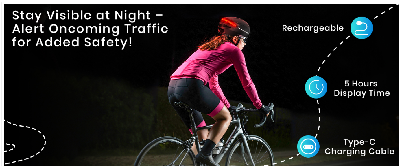
Figure 6: Charging features of the helmet.

The helmet's integrated lights are powered by a rechargeable battery. Use the provided USB Type-C cable to charge the helmet. The charging port is located at the bottom rear of the helmet, beneath a weather-proof cover.