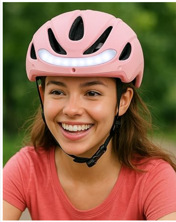
Figure 7: Five dynamic lighting modes for visibility.