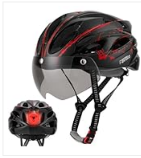
Figure 5: Magnetic buckle for secure and effortless fastening.