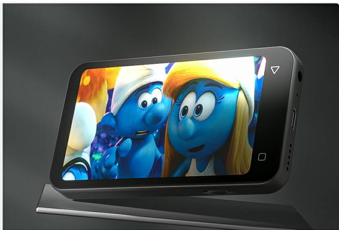
Image: The TIMMKOO Q8 MP3 Player displaying a video, highlighting its video playback capability.

It supports high resolution video (including 720p,1080p) playback and does not require conversion of video formats.