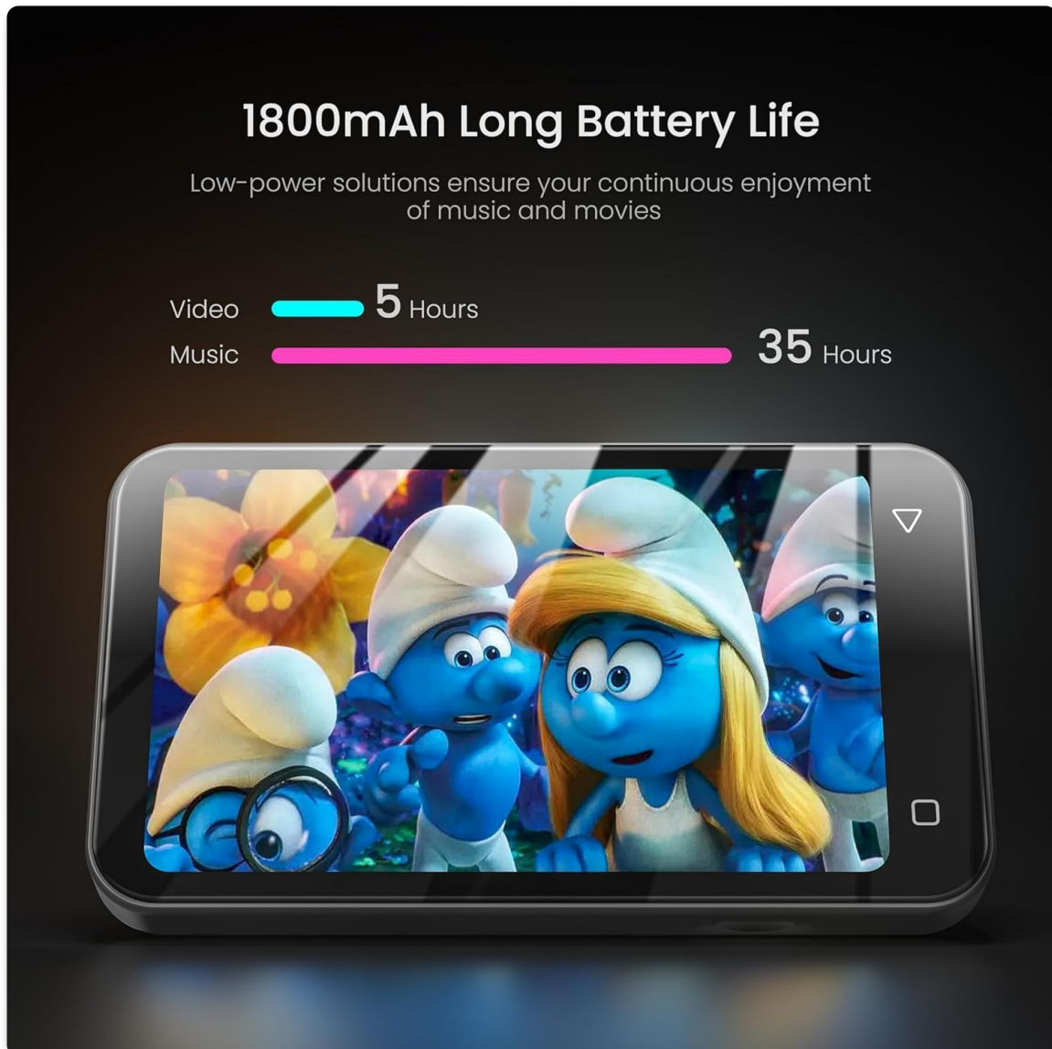
Image: The TIMMKOO Q8 MP3 Player screen illustrating its battery life for video (5 hours) and music (35 hours).