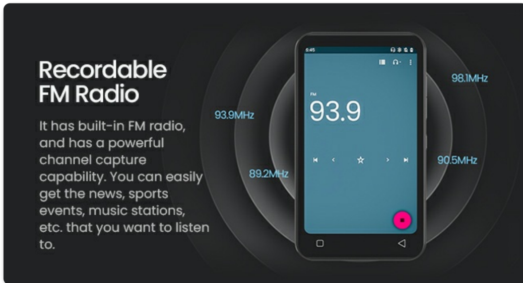
Image: The TIMMKOO Q8 MP3 Player screen showing the FM radio interface with frequency display.

The device features a built-in FM radio with channel capture capability. Access the FM Radio app to listen to news, sports, and music stations.