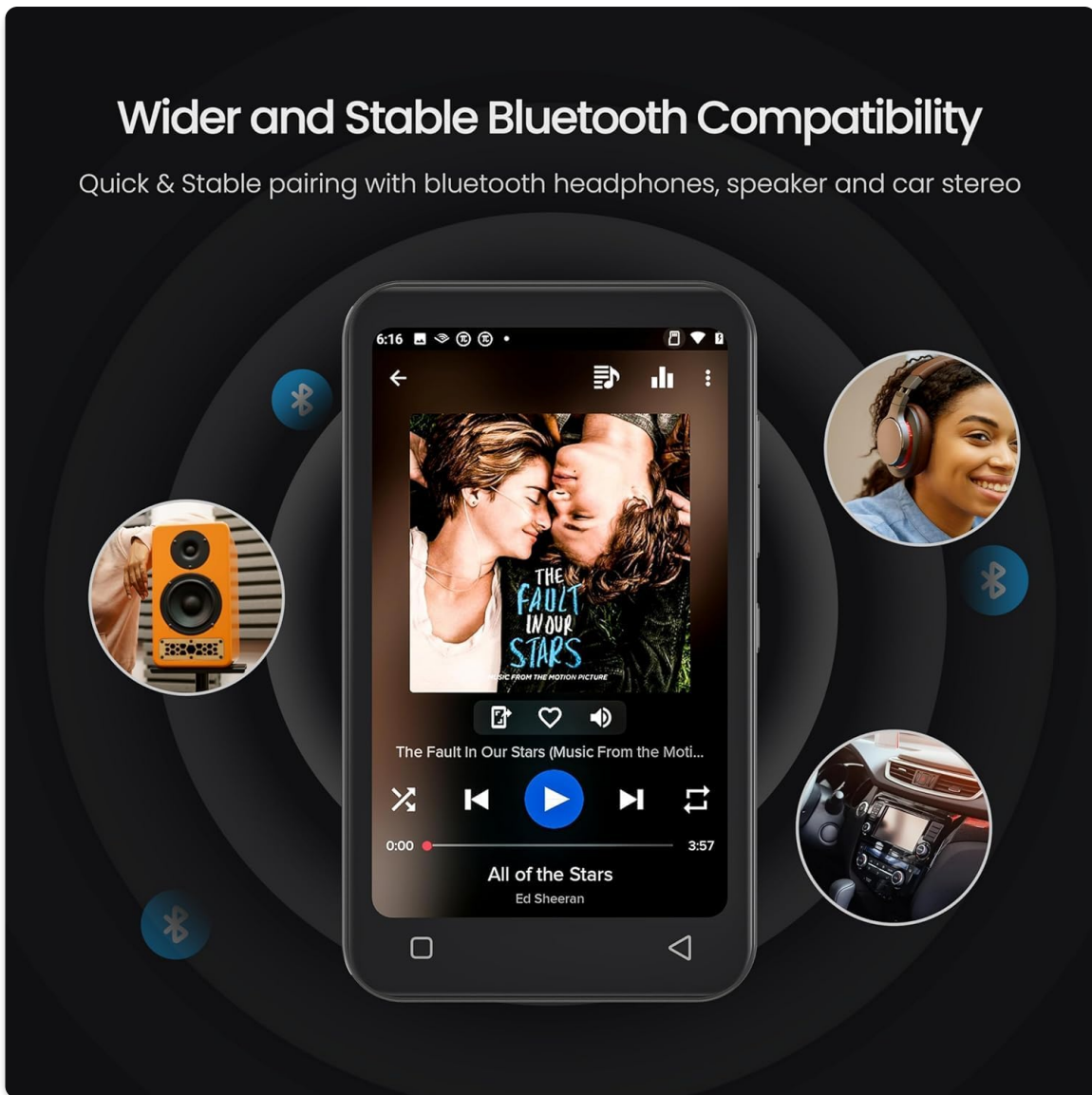
Image: The TIMMKOO Q8 MP3 Player demonstrating its Bluetooth connectivity with various audio devices.

Quick & Stable pairing with bluetooth headphones, speaker and car stereo