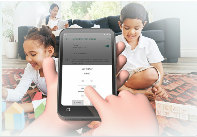
Image: The TIMMKOO Q8 MP3 Player screen showing the parental control interface, including options for setting timers.

Having parental controls software installed on all internet-connected devices is a great way to help regulate children's online habits.