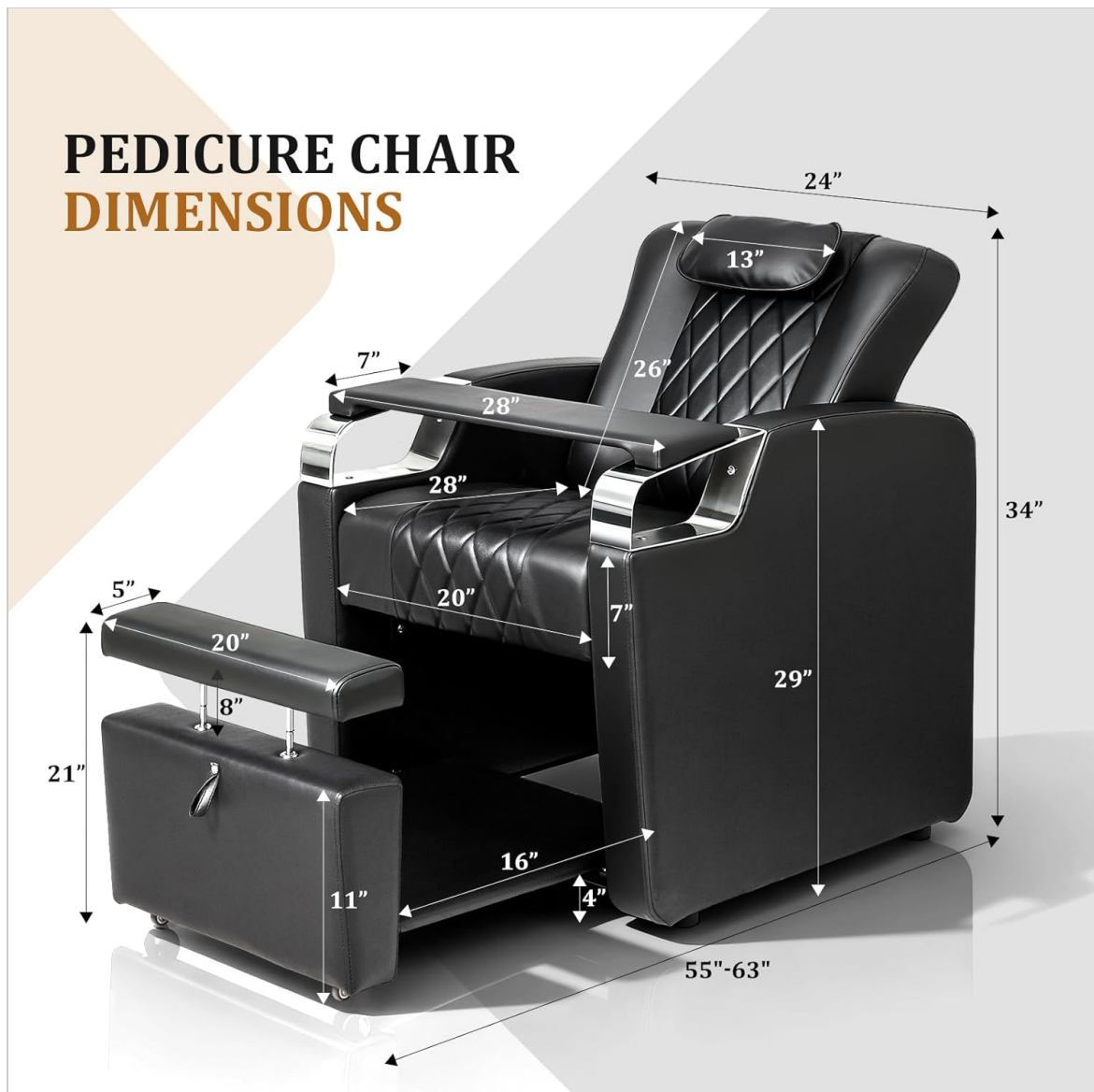
Image 8.1: Detailed dimensions of the OmySalon Electric Pedicure Chair.