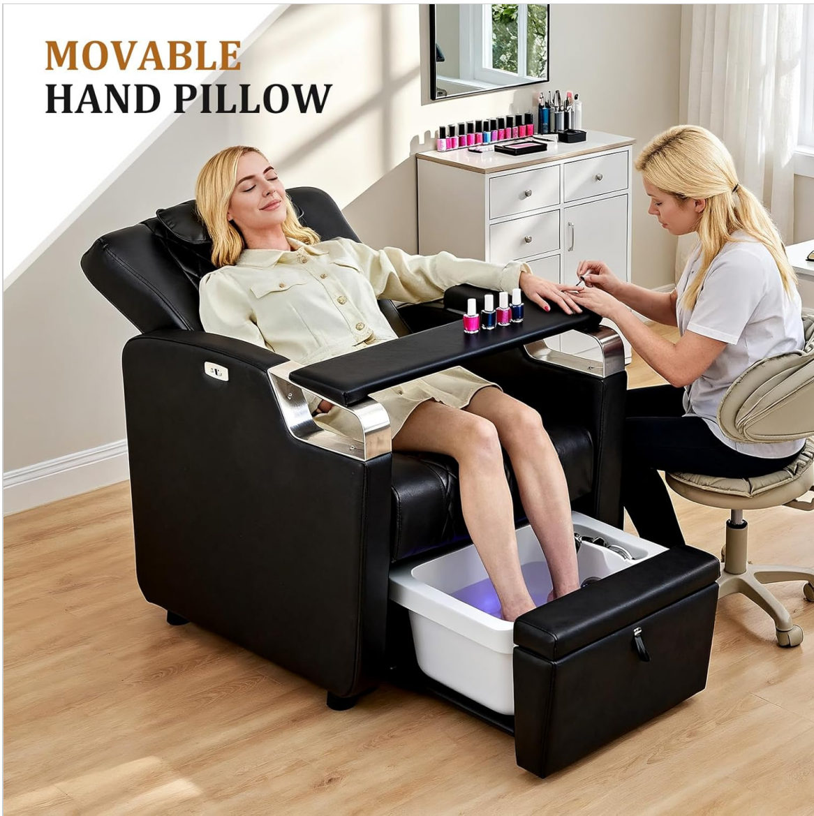
Image 5.2: Client utilizing the movable hand pillow during a pedicure session.