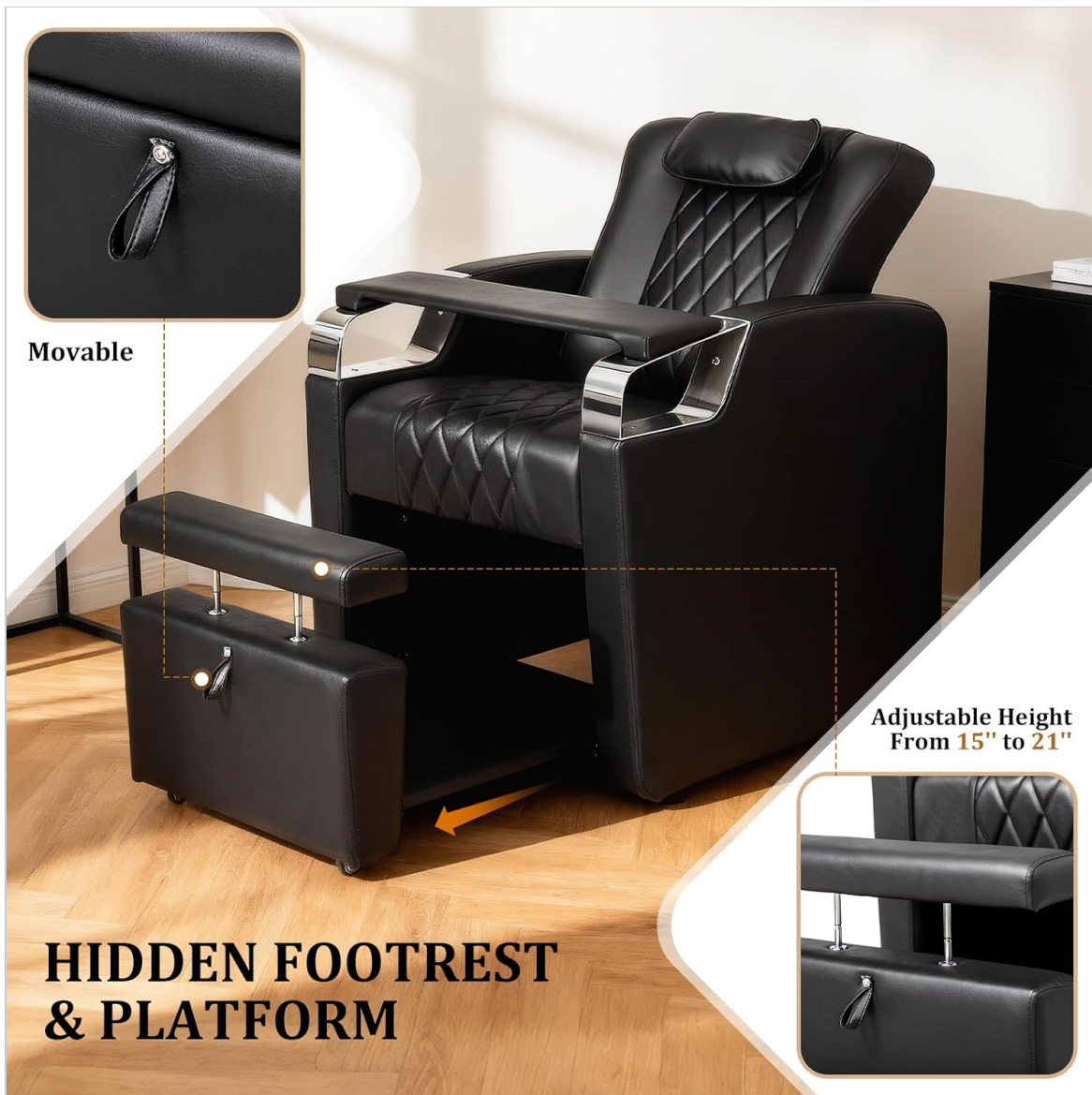
Image 5.3: Detailed view of the hidden footrest and its adjustable features.