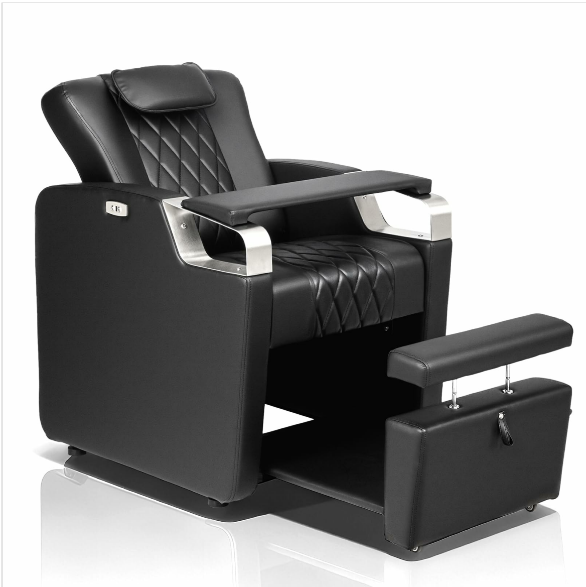
Image 1.1: OmySalon Electric Pedicure Chairs in a professional salon environment.