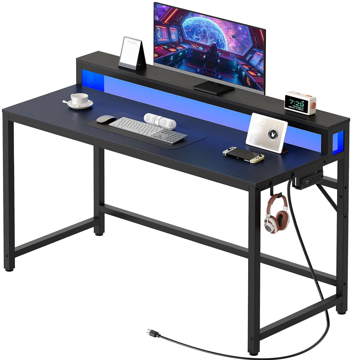
Image: The computer desk fully assembled, showing the monitor stand and integrated LED lighting.