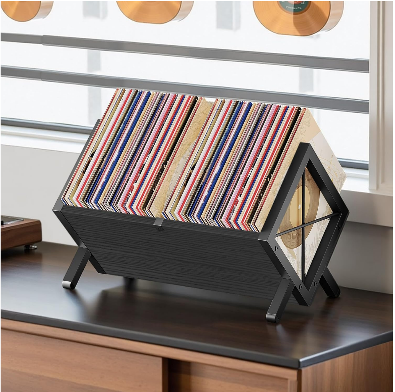
Image: The vinyl record holder shown in use, filled with a collection of LP records.