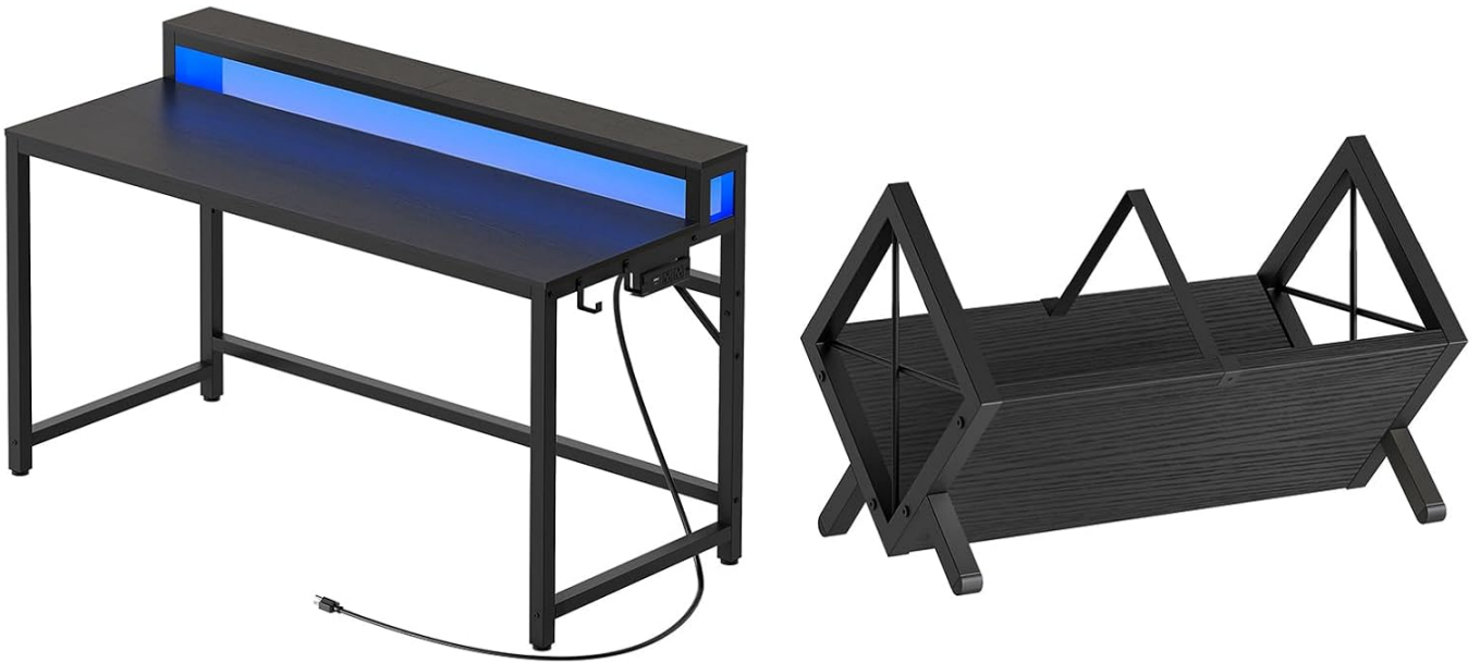
Image: Main components of the YATINEY Computer Desk and the separate Vinyl Record Holder.