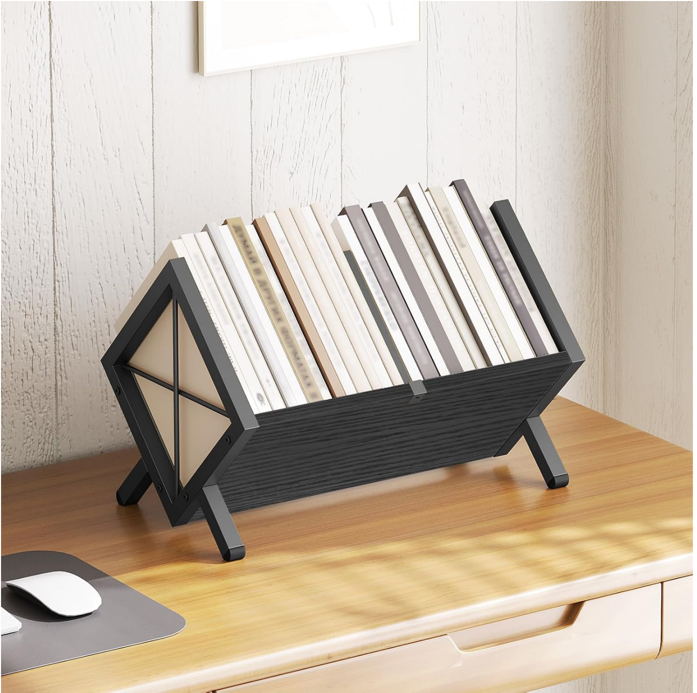
Image: The vinyl record holder fully assembled, ready for use.