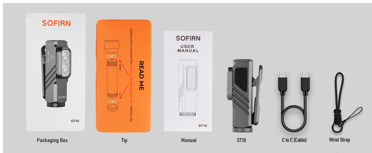
Image: All items included in the Sofirn ST10 package, neatly arranged.