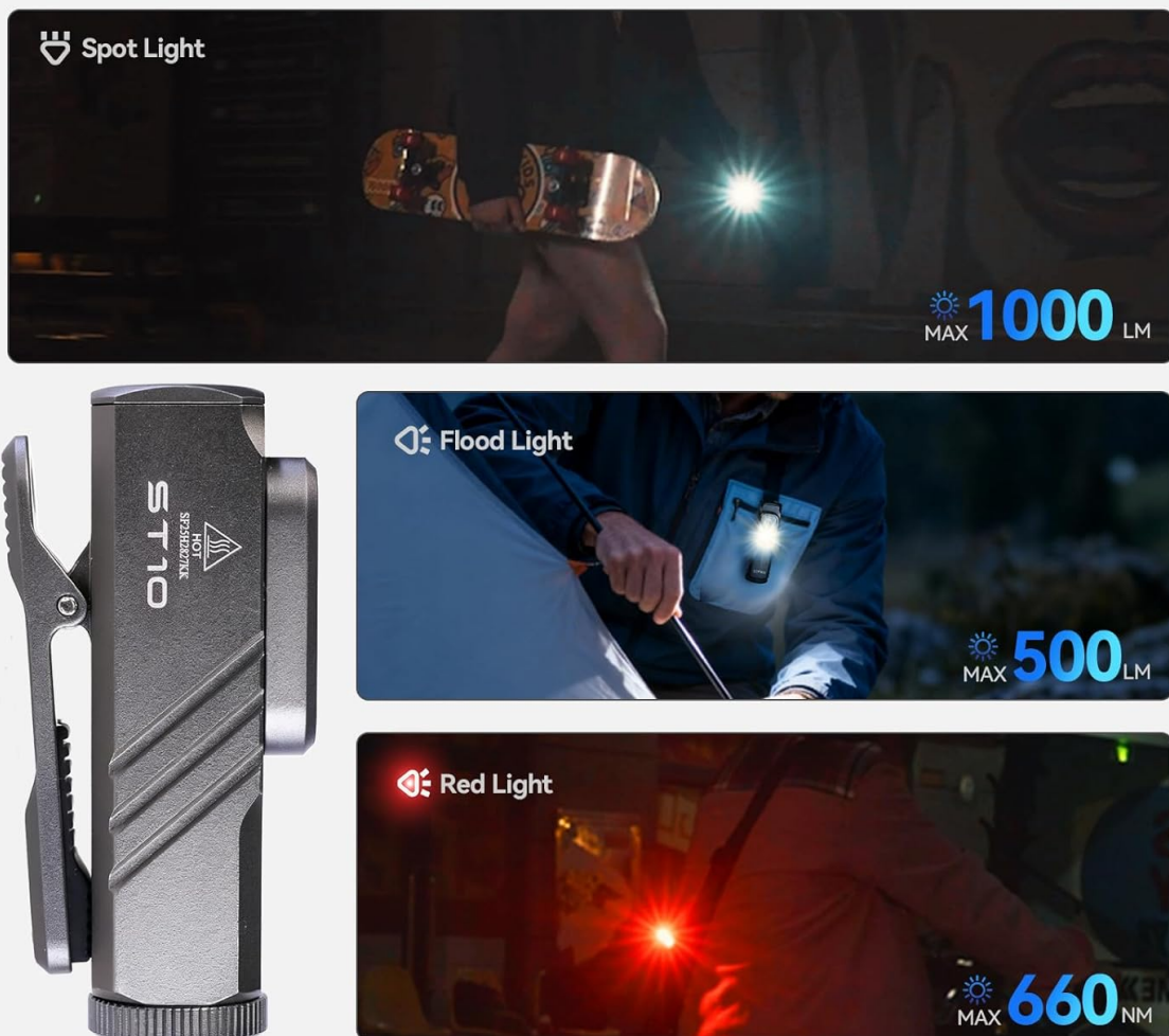
Image: The ST10 showcasing its three distinct lighting modes.