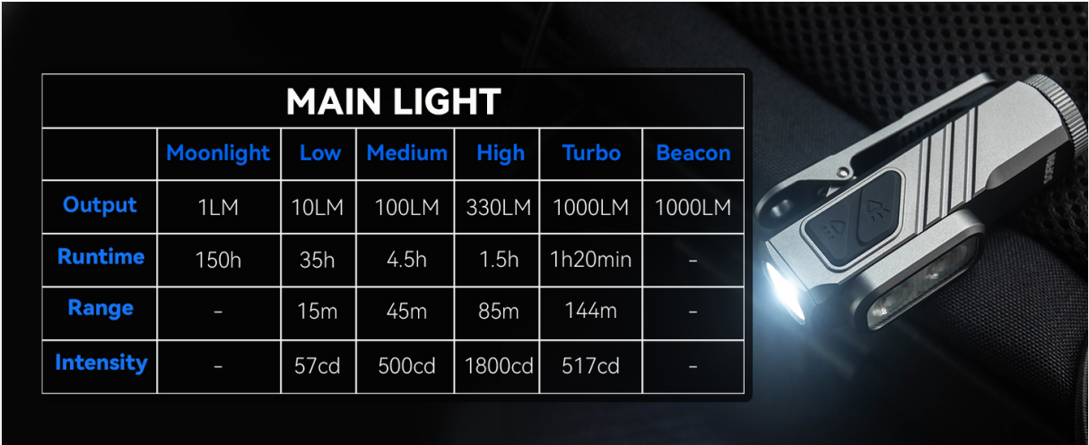
Image: Detailed performance specifications for the main light modes.