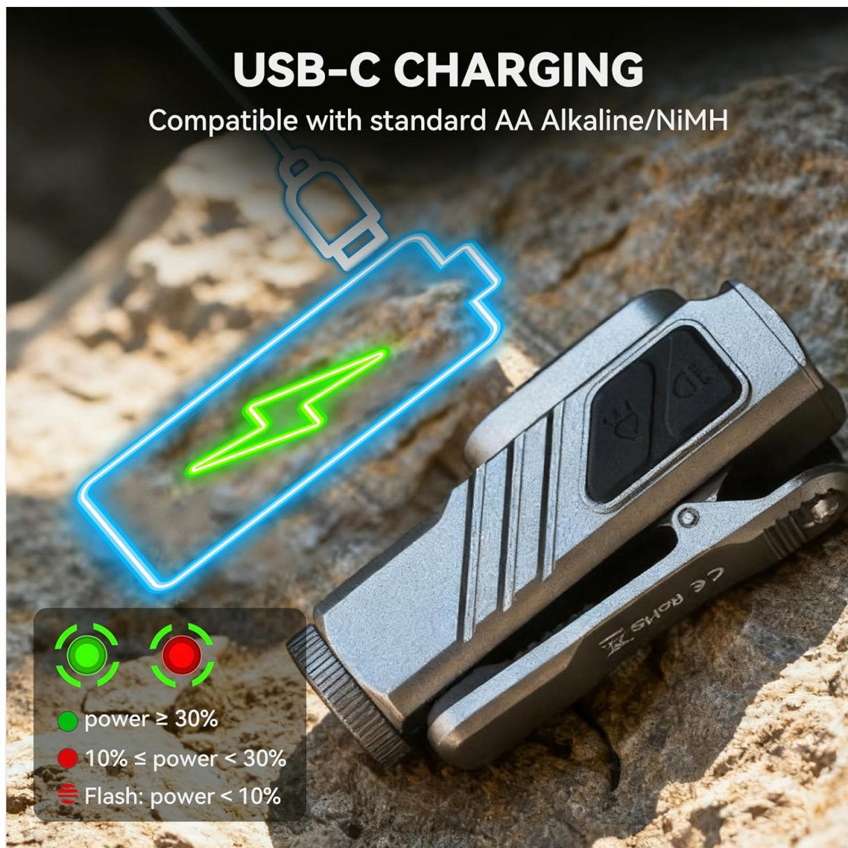
Image: The 14500 battery with its integrated USB-C charging port and indicator lights.