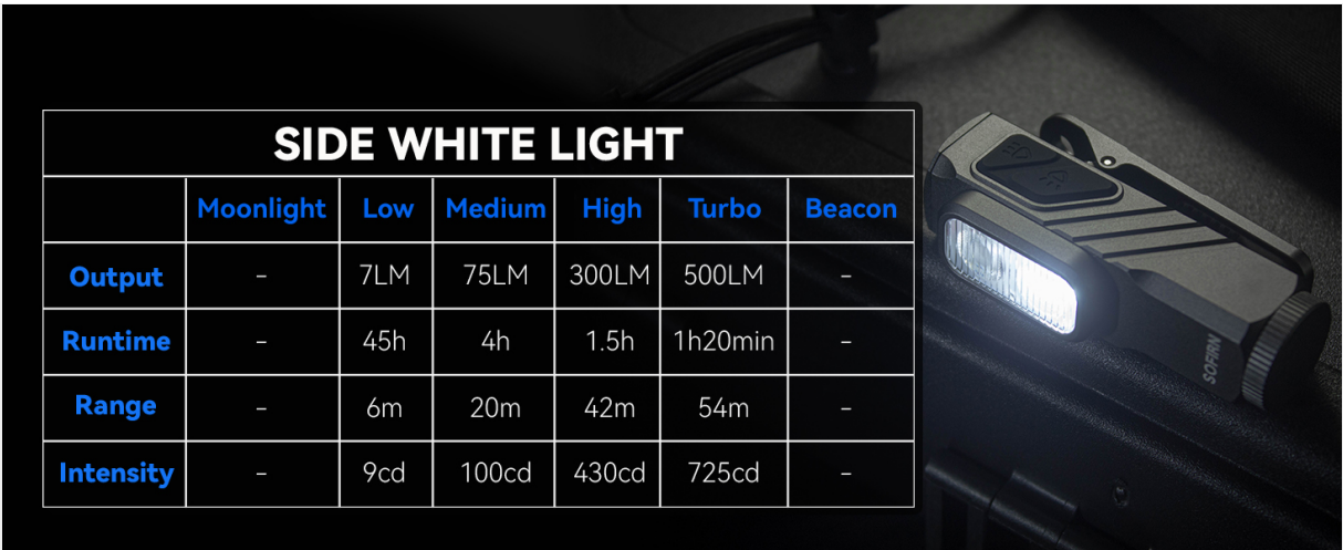
Image: Detailed performance specifications for the side white light modes.