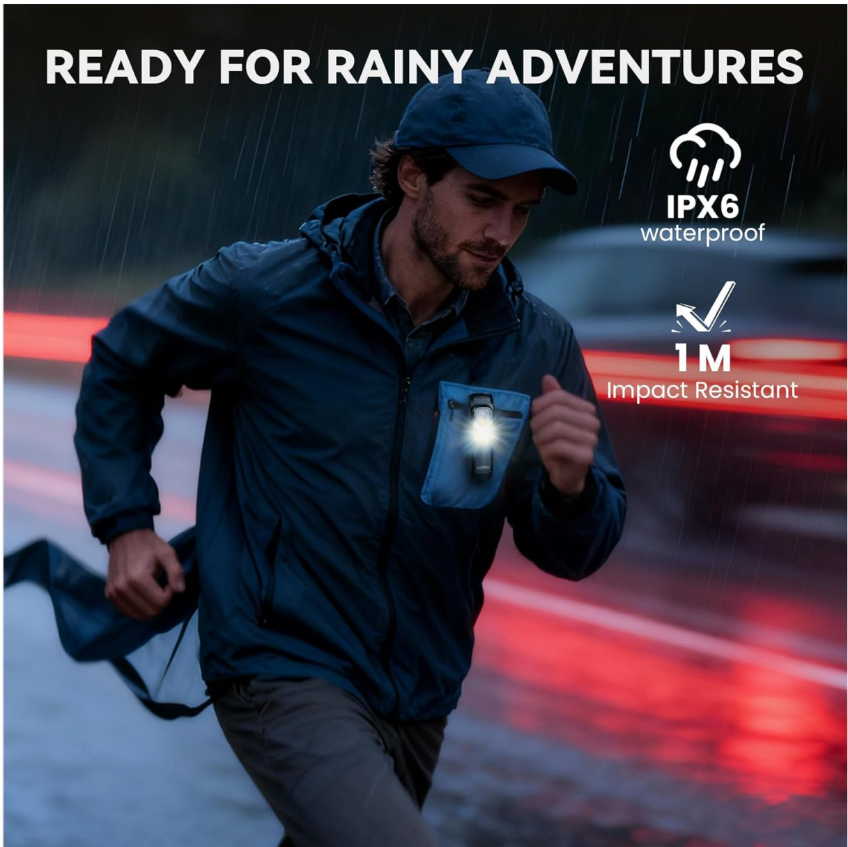
Image: The ST10 in use during rain, demonstrating its durability and water resistance.