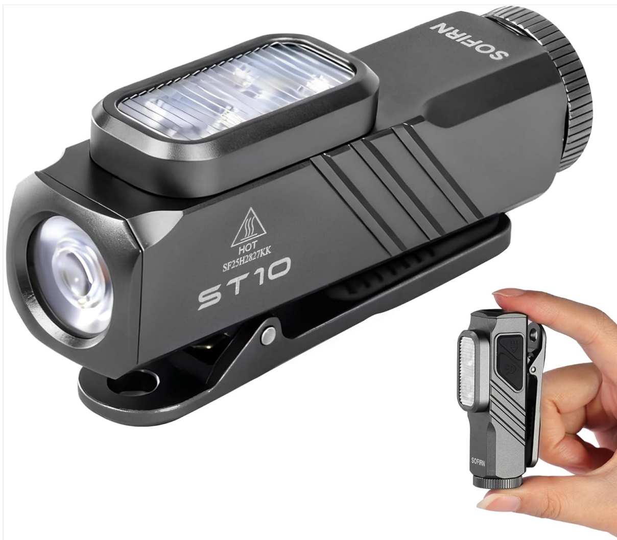
Image: The Sofirn ST10 flashlight, highlighting its compact form factor and dual light sources.