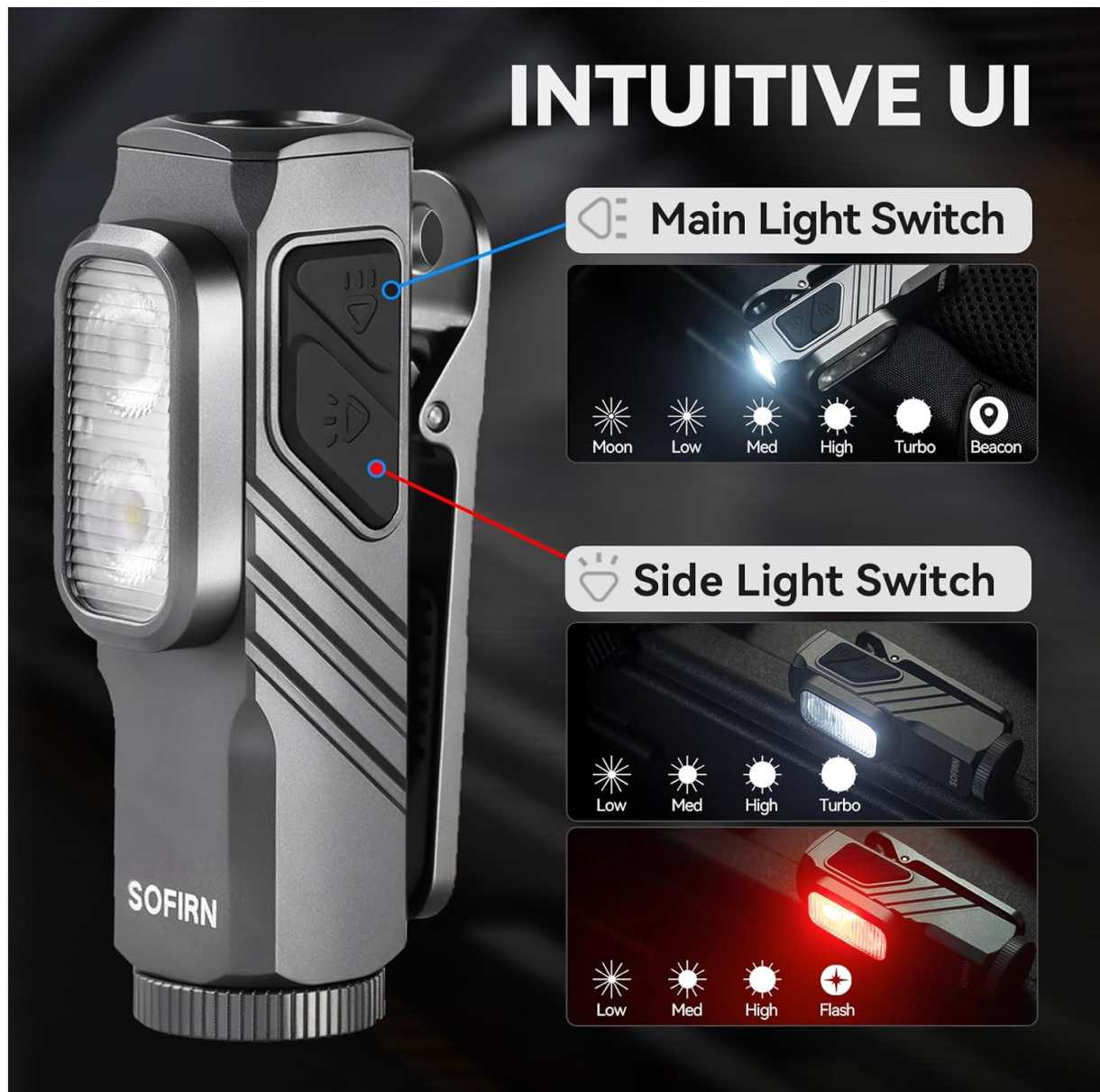
Image: Detailed diagram of the ST10's intuitive dual-button user interface.