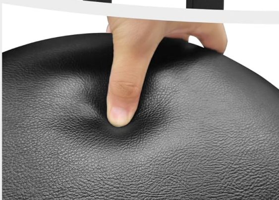
PU Upholstered Foam Padded