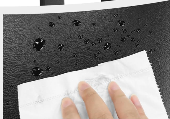
Waterproof & Easy to Clean