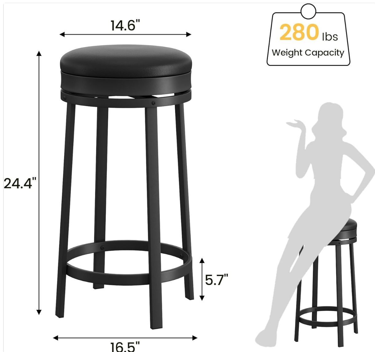
Image 8.1: Garvee 24-inch Swivel Bar Stool dimensions and weight capacity.