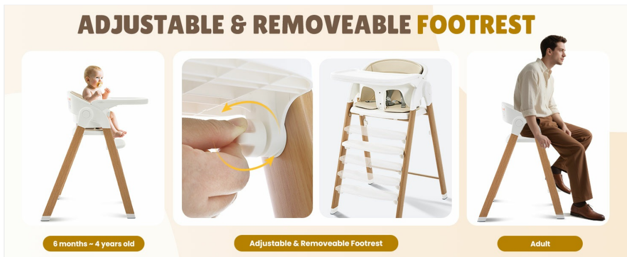
Image: The high chair adapts for use from 6 months to 2 years old (high chair), over 2 years old (toddler chair), over 4 years old (youth chair), and as an adult stool, supporting up to 240 lbs.

The Soobaby High Chair is designed for versatility. To convert between modes (e.g., from high chair to youth chair or adult stool), you may need to remove the tray, cushion, and/or adjust the leg height by detaching and reattaching leg segments. Refer to the visual guides for specific configurations.