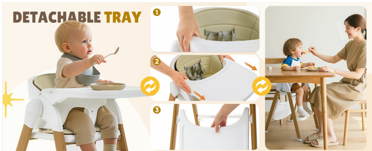
Image: The high chair seamlessly integrates into family dining, converting to a youth chair for older children.