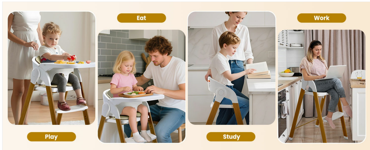
Image: The footrest can be adjusted to five different levels to ensure proper support as your child grows.