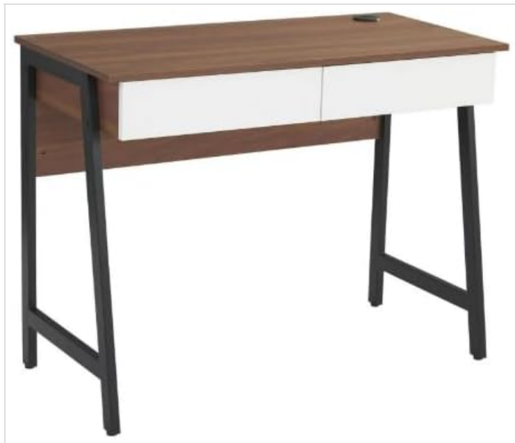
Image: An assembled view of the computer desk, highlighting the integration of the desk top, drawers, and metal leg structure. This image can serve as a visual reference during assembly.