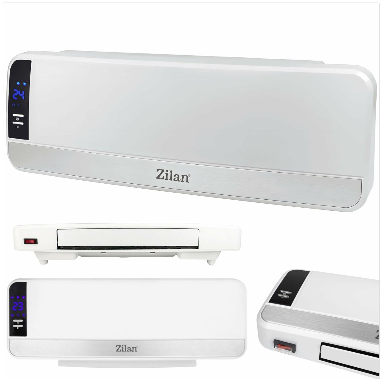
Image 2: The Zilan Ceramic Wall Heater, highlighting its compact dimensions and sleek design when mounted.