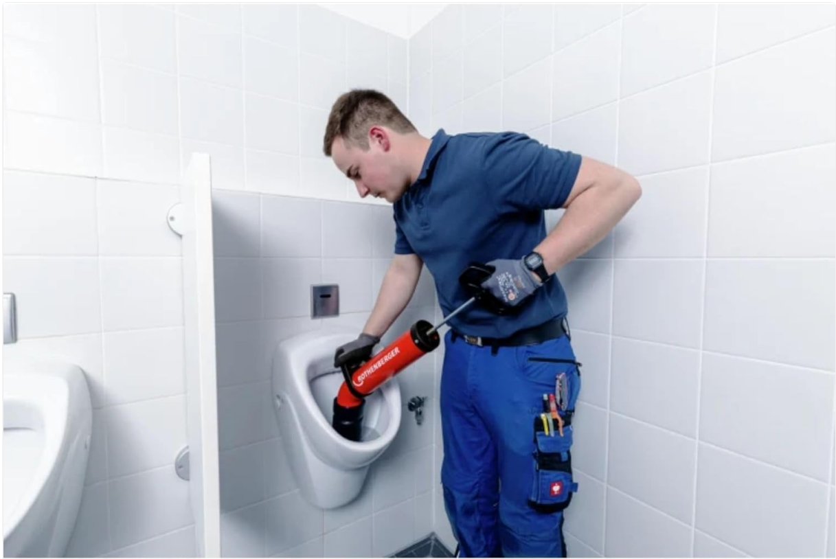
This image depicts a person using the Rothenberger Ropump Super Plus with the long adapter to clear a urinal. The device is positioned to create an optimal seal, and the user is engaging the pump to apply pressure, demonstrating its application for deeper fixtures.