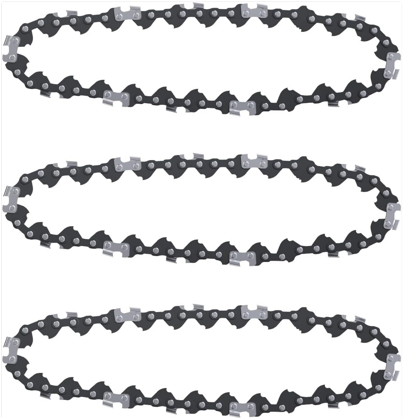
Figure 1.1: Fanttik W101 4-inch Chainsaw Chains (3-pack).