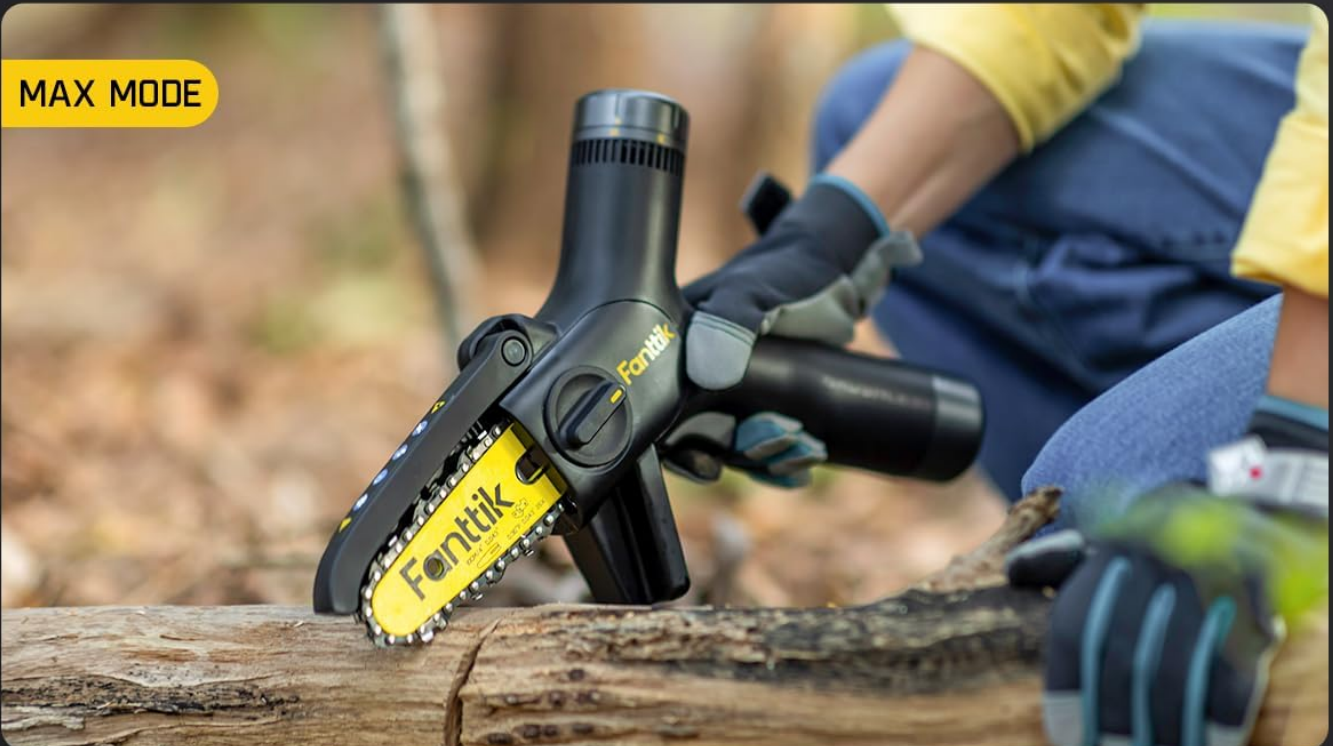
Figure 4.1: Fanttik W10 APEX Mini Chainsaw speed modes in action.