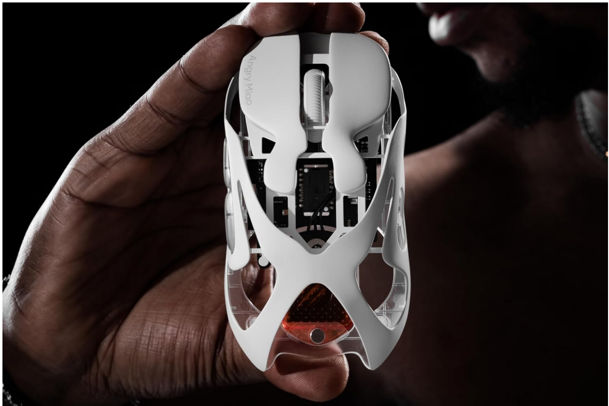
Image: The underside of the white AM Infinity Mouse, showing the sensor and the transparent base, which can be cleaned with a soft cloth.