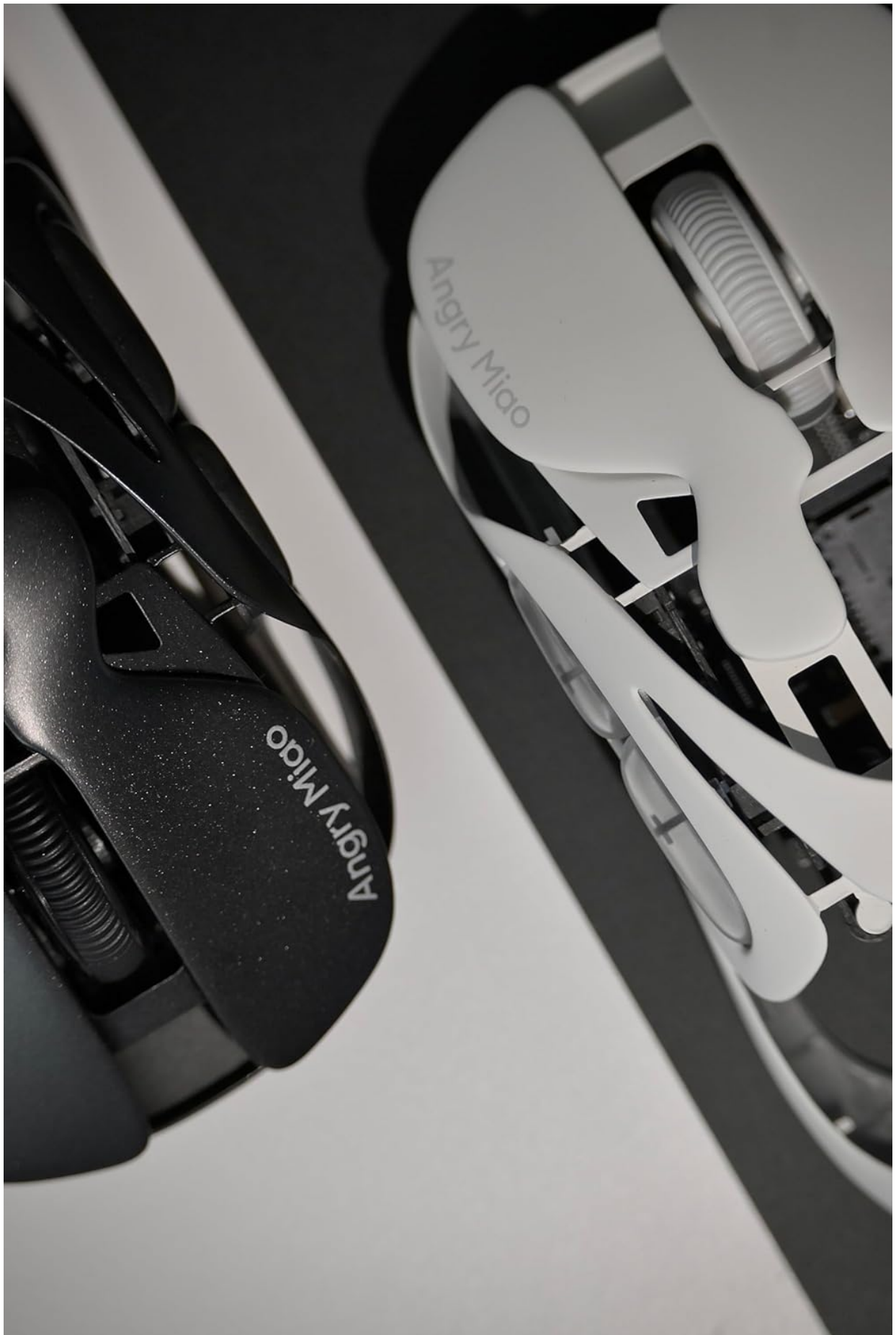
Image: A close-up view of the white AM Infinity mouse's underside, showing the magnetic hot-swappable battery compartment.

Video: A demonstration of the hot-swappable magnetic battery and the 8K receiver hub of the AM Infinity Mouse.