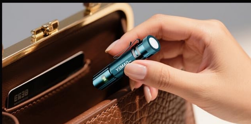
Image: The Yemao M52 flashlight being charged via USB-C. The image highlights the charging port and the battery indicator, which glows red during charging and green when fully charged.