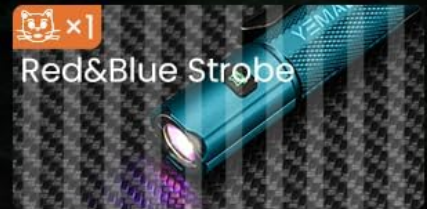
Image: Visual representation of the Yemao M52 flashlight's six modes: Low, Medium, High, Ultra Bright (double click), Strobe (long press), and Red & Blue Strobe. Each mode shows the corresponding light intensity.