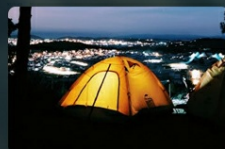
Single Click: Normal Brightness