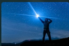
Double-Click: Ultra Bright

Adjust Brightness: Single click cycles high, medium, and low; double click for turbo; long press for white strobe; single click again to switch red/blue flashing.