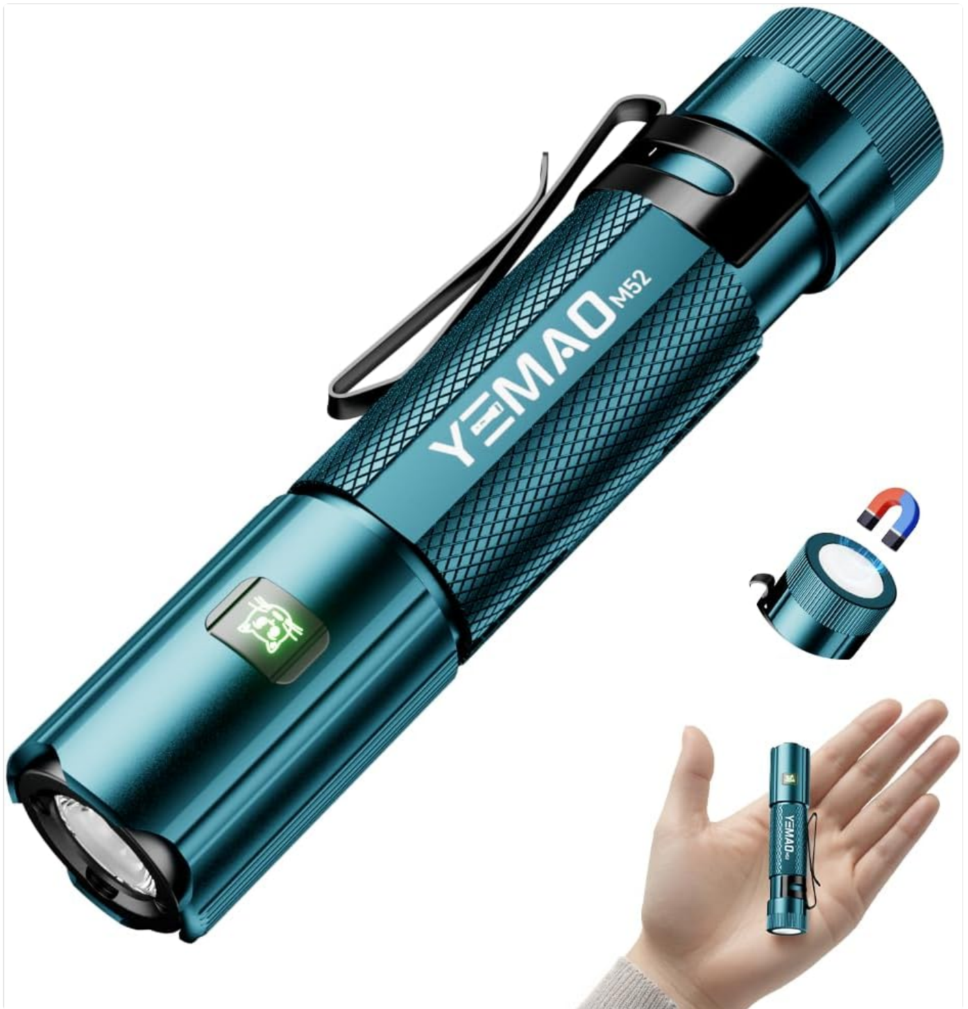
Image: The Yemao M52 flashlight, illustrating its small and lightweight design with dimensions of 3.4 inches in length and 0.7 inches in diameter, weighing 1.02 oz without the battery.