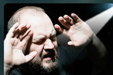
Long press: Strobe