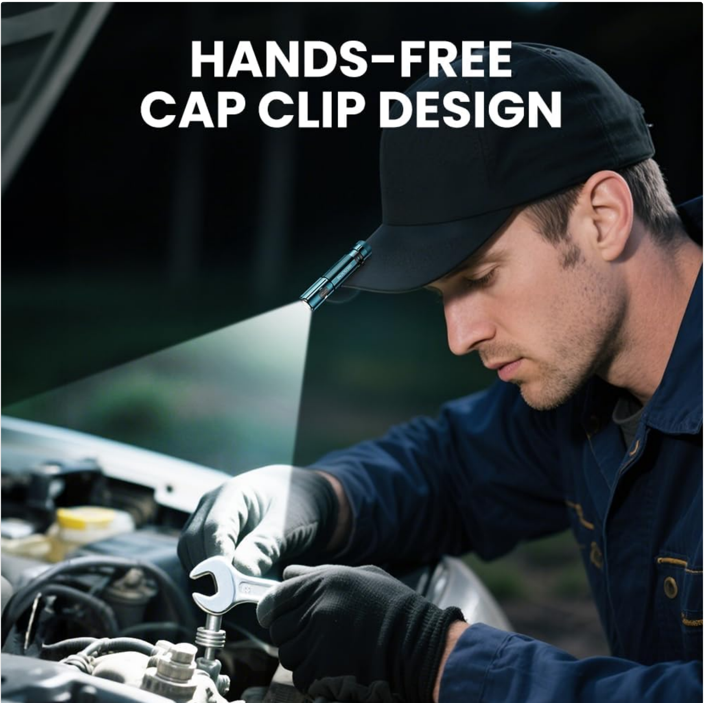
Image: The Yemao M52 flashlight's compact size is illustrated by showing it fitting into a pocket, a purse, and clipped onto a hat, emphasizing its portability for everyday carry.