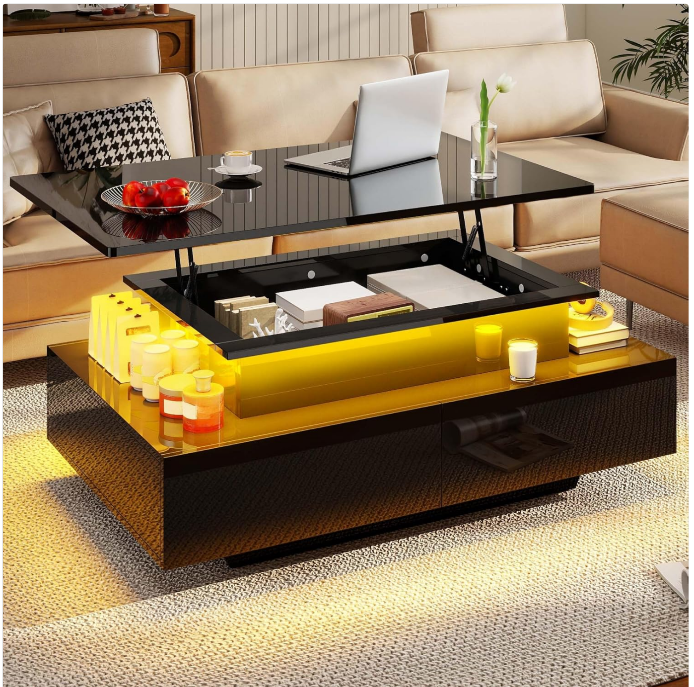
Figure 4.1: The coffee table with its lift top extended, providing a comfortable surface for working or dining while seated on a sofa.