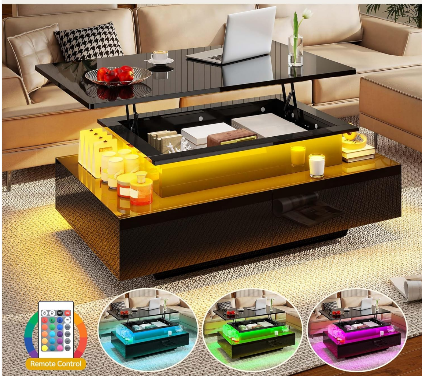
Figure 4.3: The coffee table illuminated by its RGB LED lights, showcasing different color options and the remote control used for adjustments.

3-Color or 7-Color Jump, Strobe and Gradual