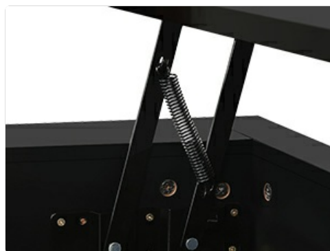
Figure 4.2: Detail of the robust spring-assisted lift mechanism, designed for smooth and stable operation.