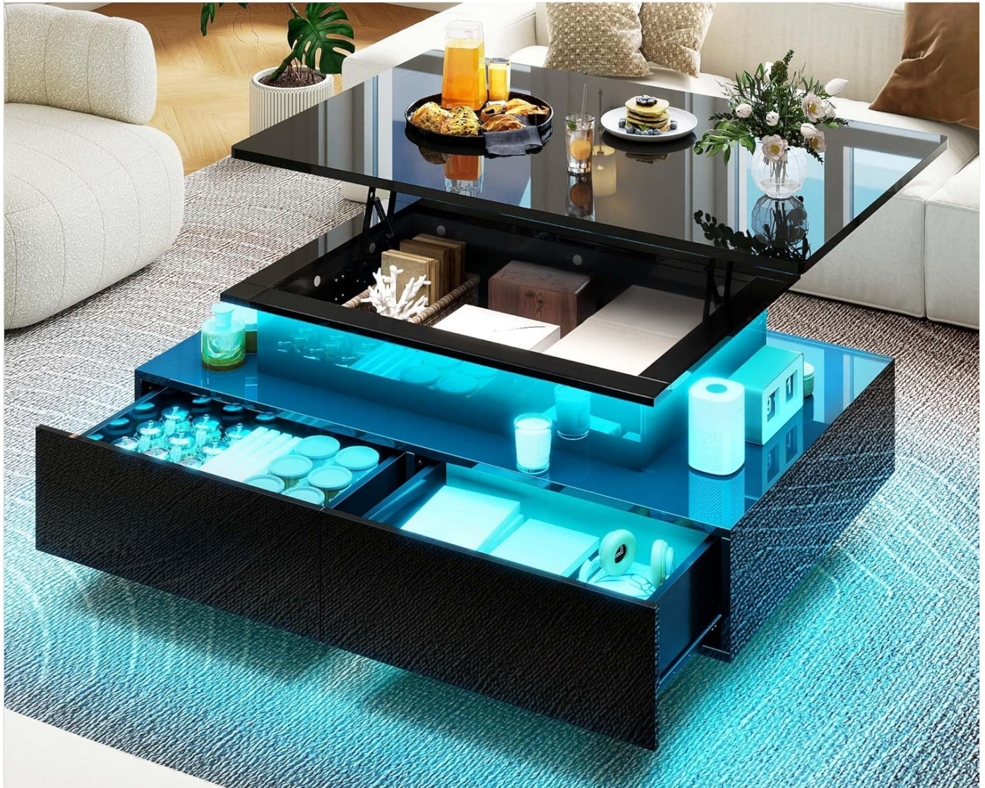
Figure 4.4: The coffee table with its four drawers and hidden compartment open, demonstrating the extensive storage capacity for various items.