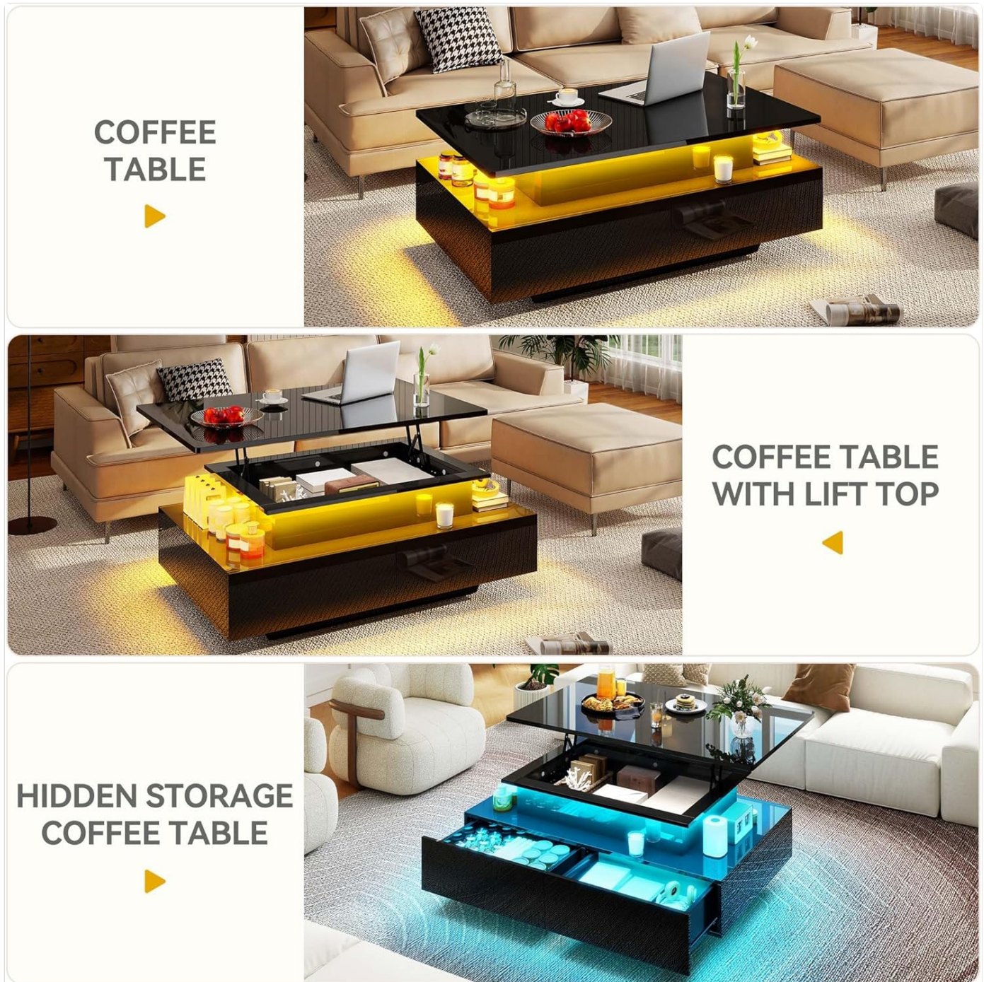
Figure 3.1: Visual representation of the coffee table in its standard position, with the lift top raised, and with the hidden storage compartment and drawers open, demonstrating its versatile functionality.