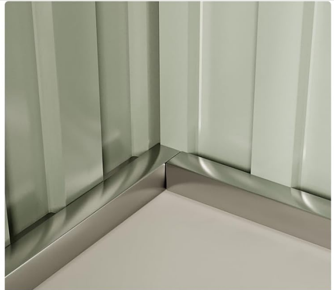
Strong and Durable Frame