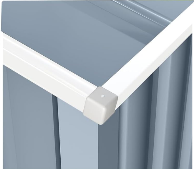
Corner protective cap

This image highlights key safety and durability features: a robust lockable door mechanism, the strong and durable galvanized steel frame construction, protective caps for screws, and rounded corner protectors to prevent injury.