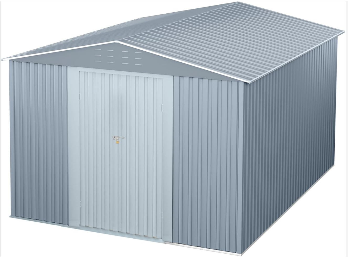
A full front view of the CuisinSmart storage shed, illustrating its clean lines and secure double doors, ready to protect stored items.