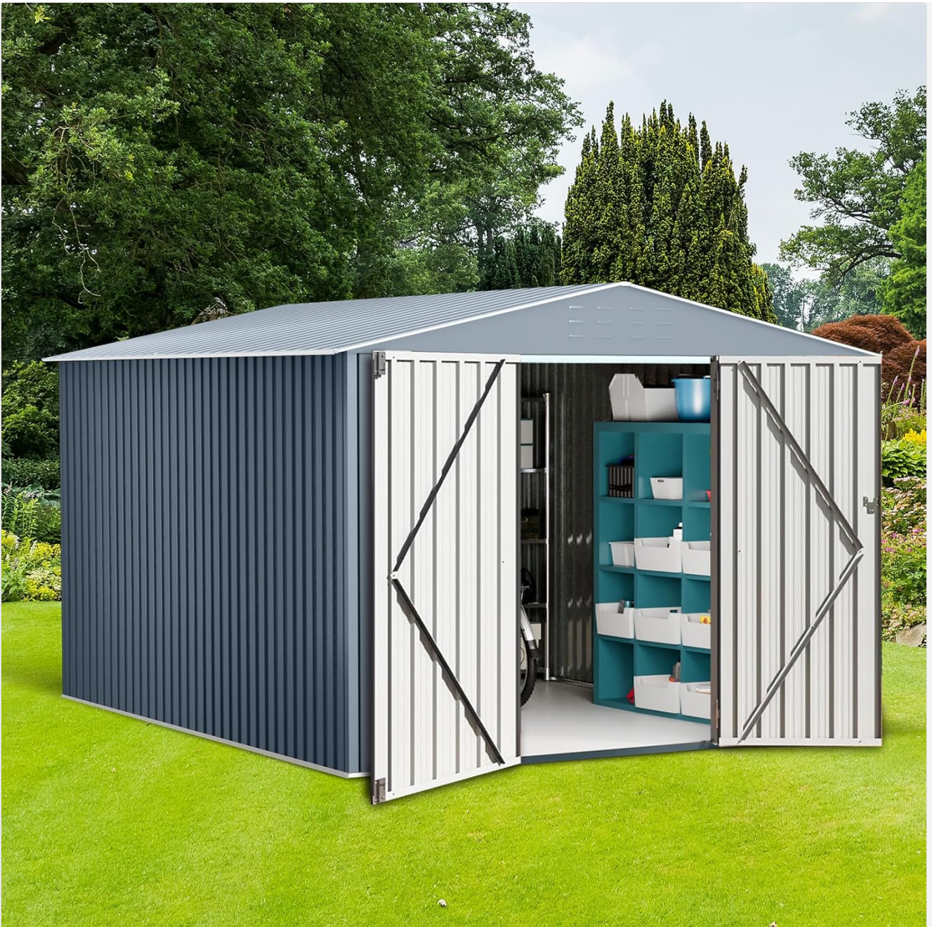
An overview of the CuisinSmart 10x12 Ft Galvanized Steel Outdoor Storage Shed, featuring its spacious interior with organized shelving, situated in a well-maintained garden.