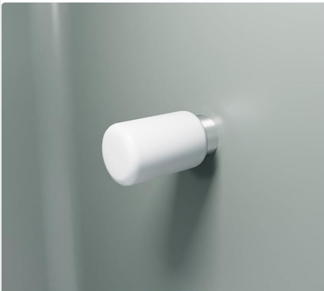
Screw protective cap