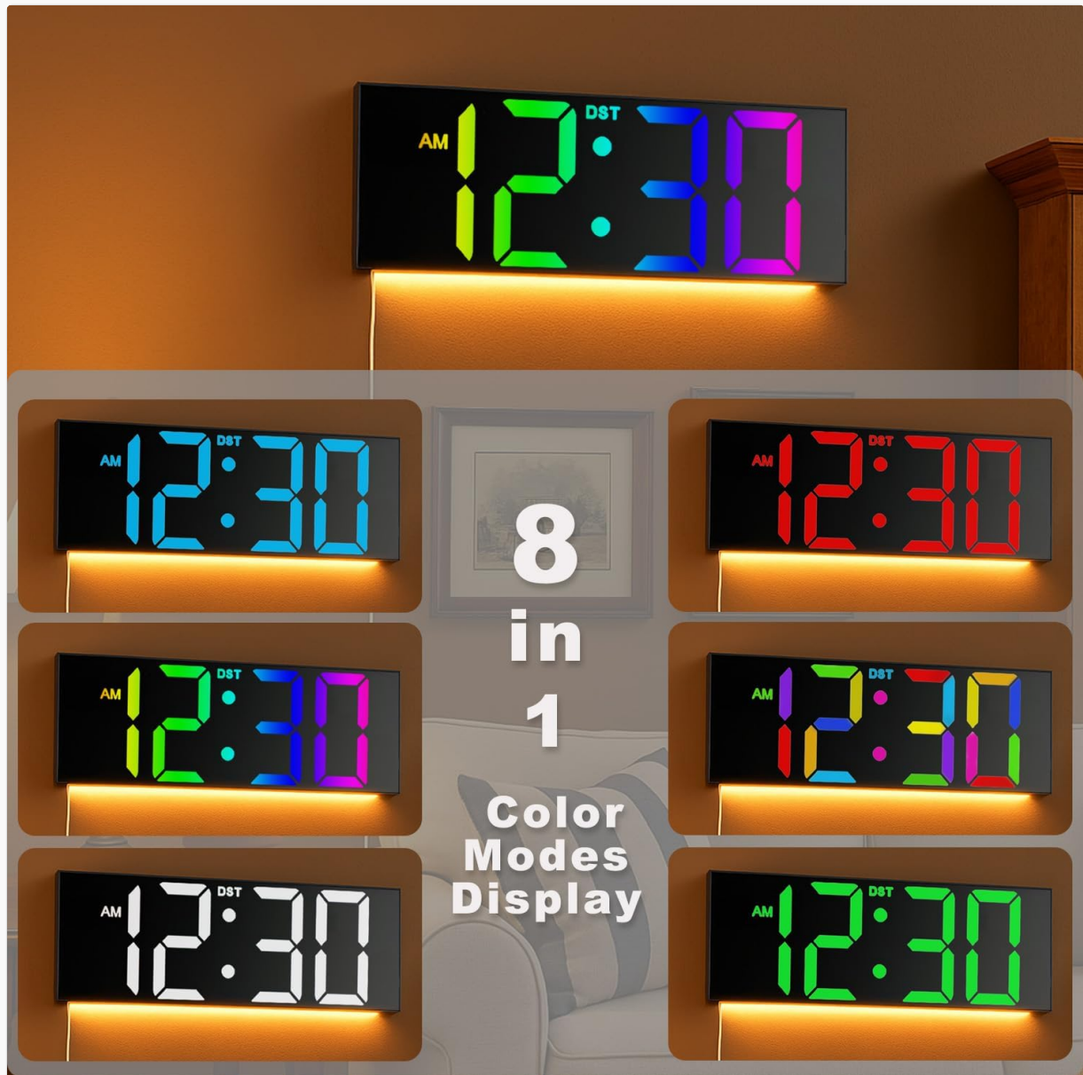
Image: The digital clock showcasing its 8-in-1 color modes, with the time displayed in different solid and gradient RGB colors.

The clock offers 8 color modes for the time display. Press the Display Colors button on the remote control to cycle through the available color options, including solid colors and dynamic RGB shades.