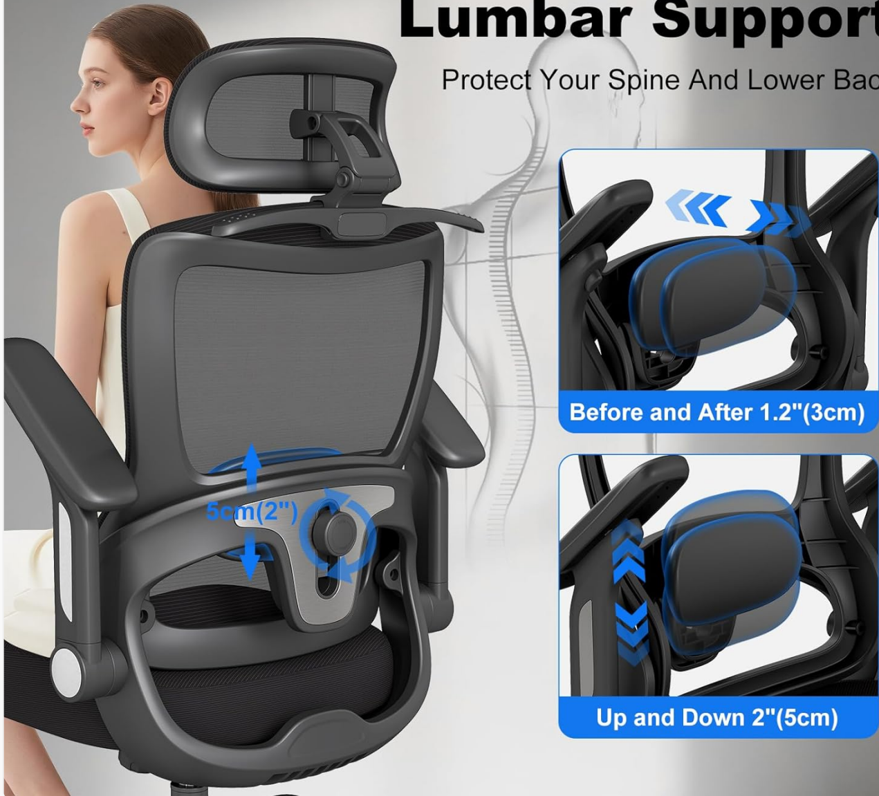
Image 4.4: 2D Adjustable Lumbar Support. This diagram illustrates how the lumbar support can be adjusted both vertically (up/down) and horizontally (forward/back) to fit individual needs.