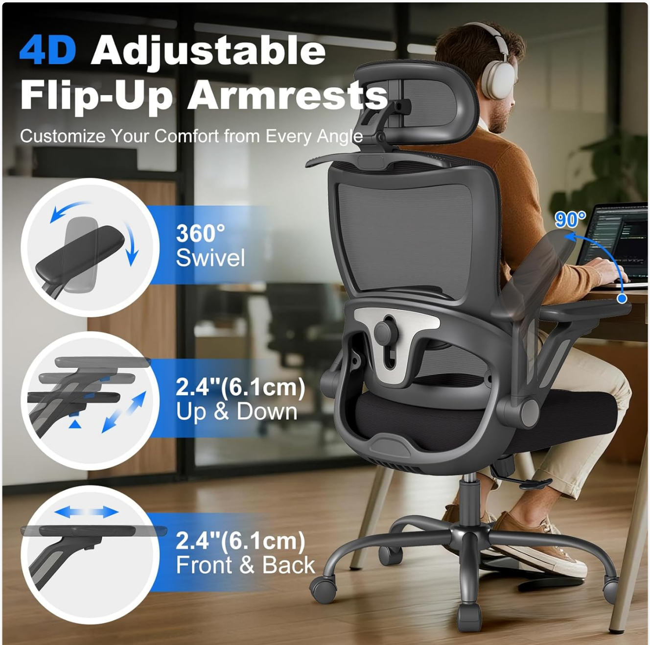
Image 4.2: 4D Adjustable Flip-Up Armrests. This diagram illustrates the various adjustments available for the armrests, including 360° swivel, up/down movement, and front/back slide.