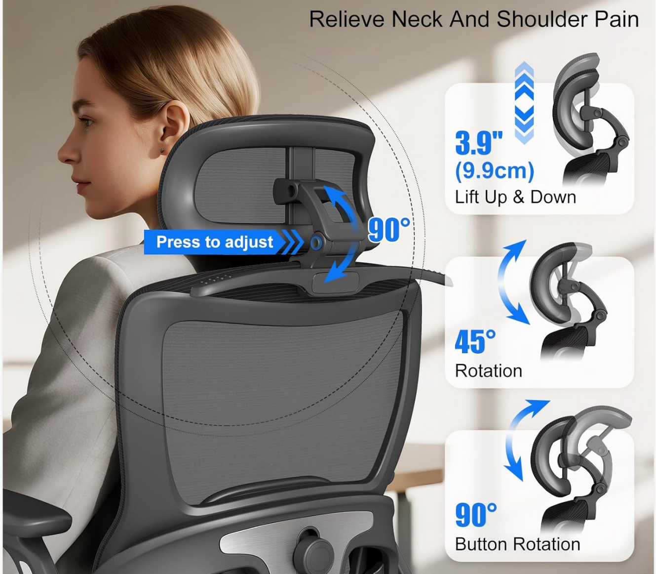
Image 4.3: 3D Adjustable Headrest. This image shows the headrest's height adjustment (up/down) and tilt capabilities (90° and 45° rotation).