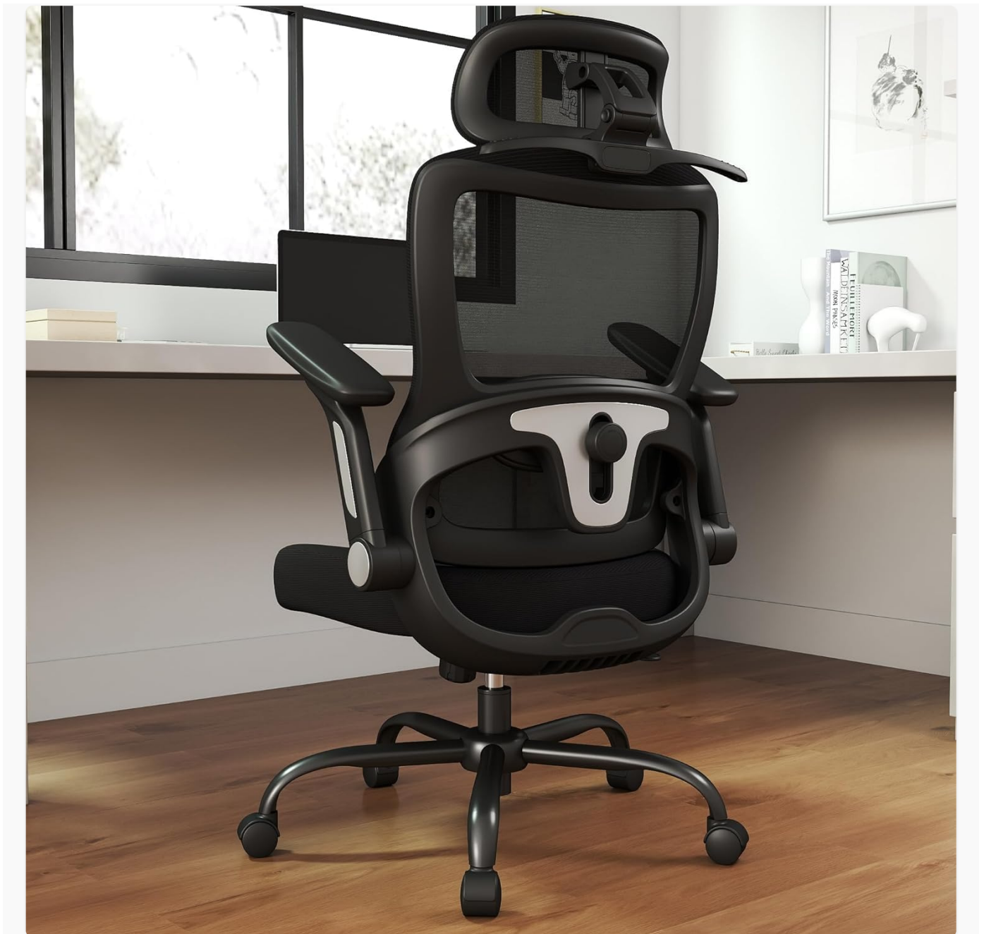
Image 2.1: ZZH Ergonomic Office Chair. This image displays the full chair from a front-side angle within an office environment, highlighting its design and presence.