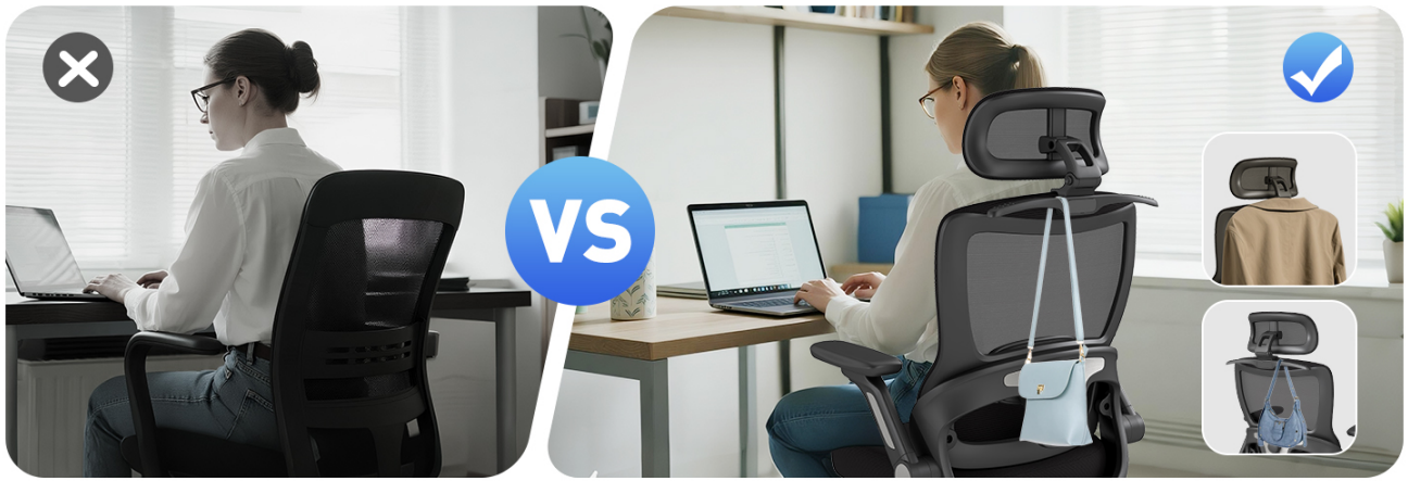
Image 4.5: Clothes Hanging Bracket. This image shows the utility of the rear clothes hook for hanging jackets or bags, contrasting with a chair without this feature.