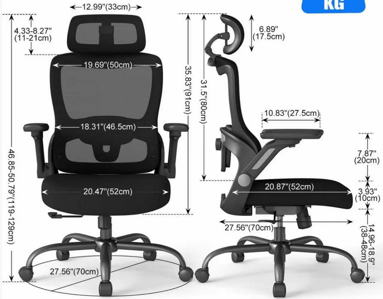
Image 2.2: Product Dimensions. This diagram illustrates the various measurements of the chair, including height, width, depth, and seat cushion dimensions, along with the 181 kg weight capacity.