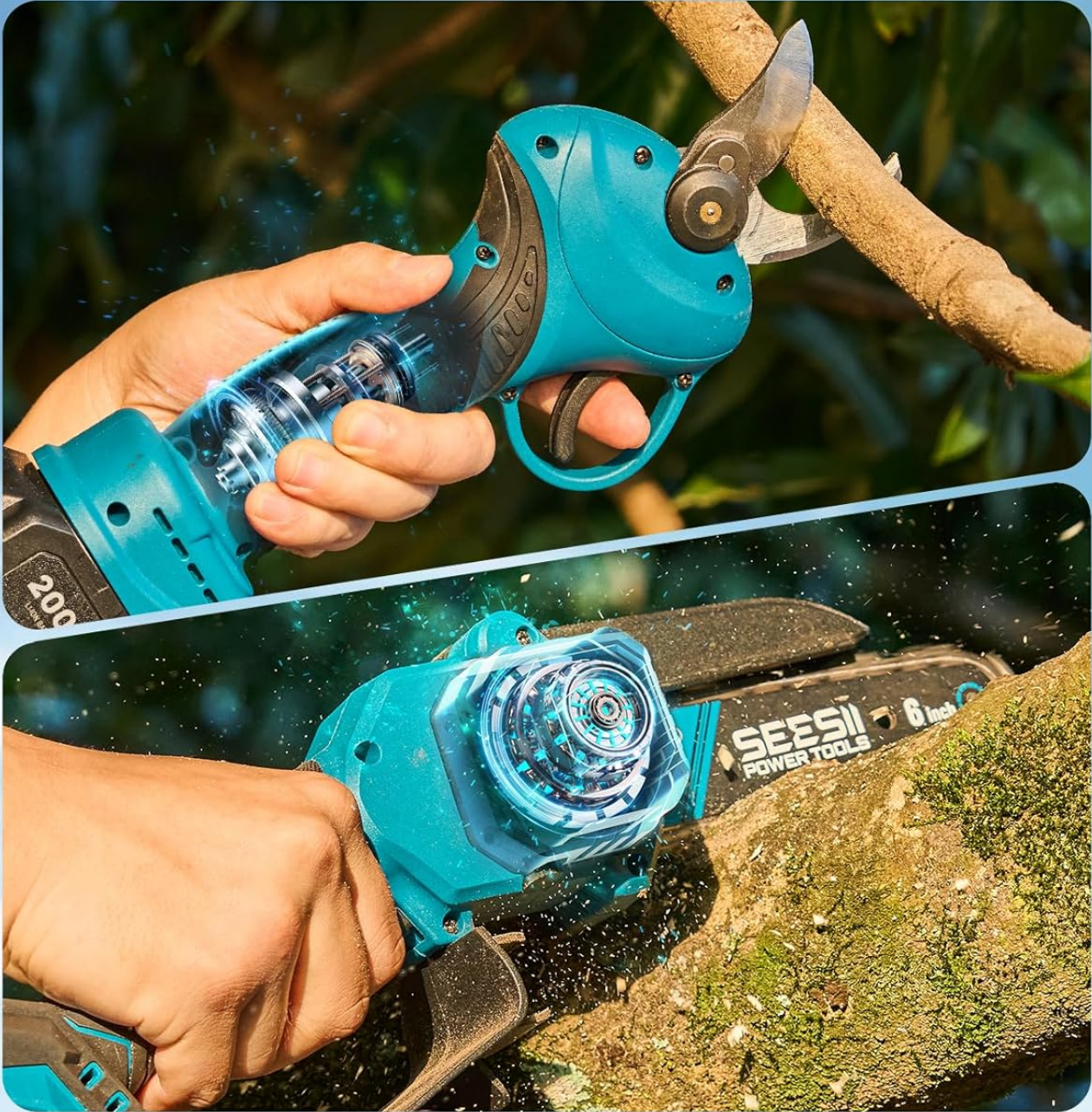
Image: A person using the SEESII electric pruning shears to trim a tree branch, showing the adjustable cutting diameter.

Video: SEESII 2-in-1 Electric Pruner & Chainsaw Combo. This video showcases both tools in action, demonstrating their cutting capabilities.