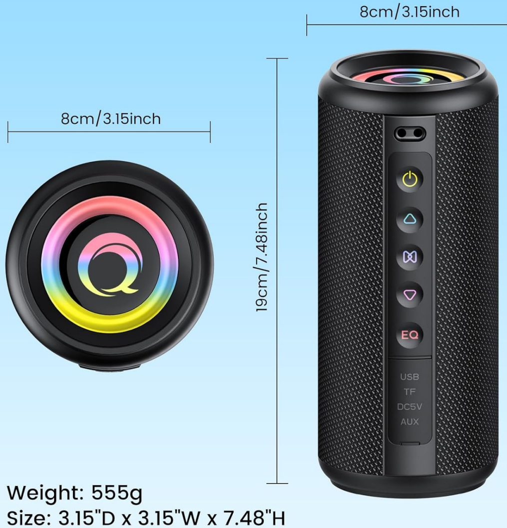
Image: A diagram illustrating the physical dimensions and weight of the dotn M17B Portable Bluetooth Speaker.