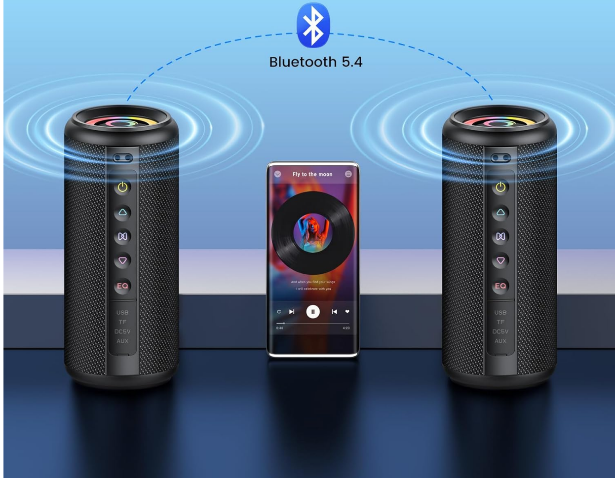
Image: Side view of the dotn M17B speaker, highlighting the control panel and various input ports.

Connect two speakers together to get stereo sound and enjoy fully immersive audio