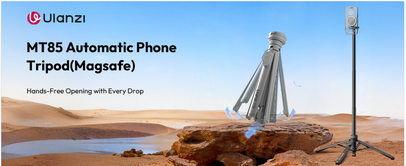
Figure 1: Included items in the ULANZI MT85 package.