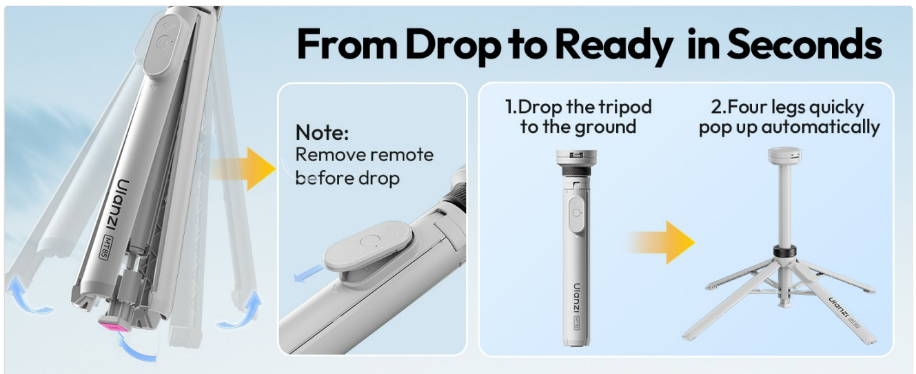
Figure 2: Automatic leg deployment.