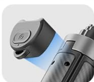
Snaps onto handle for operation