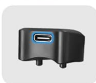
Type-C charging port