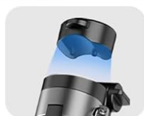
Integrated remote dock