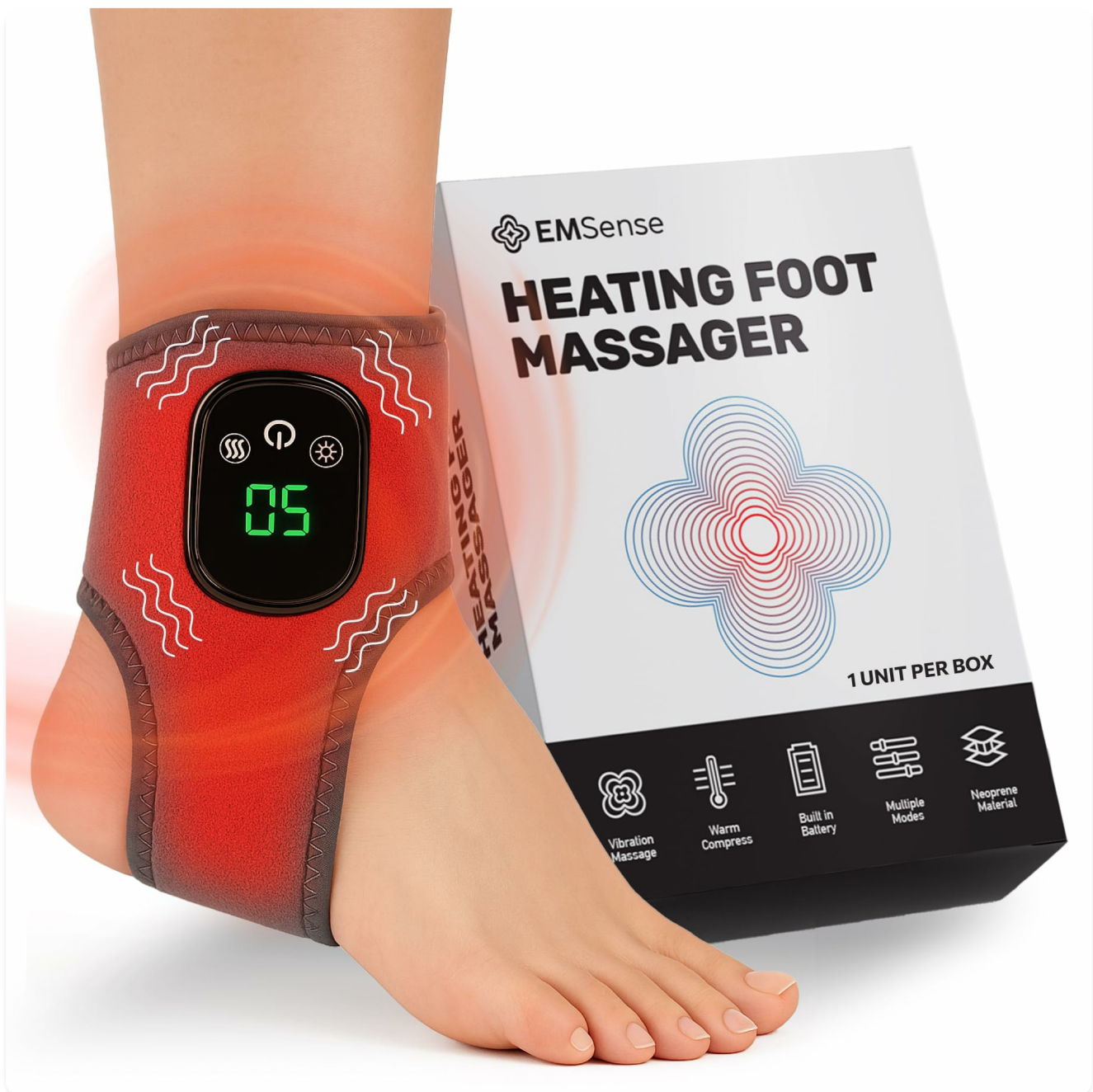
Image: The EMSense Triple Therapy Foot Massager, a compact grey device with a control panel, designed to wrap around the foot.