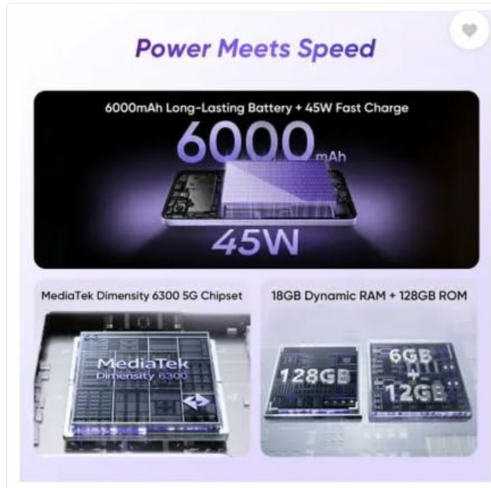
Image 4.4: Overview of the device's processor, RAM, and storage capabilities.

The realme P3 Lite 5G is equipped with a MediaTek Dimensity 6300 processor, 6GB of RAM (expandable up to 18GB dynamic RAM), and 128GB of internal storage (expandable up to 2TB). This configuration supports smooth multitasking and efficient application performance.