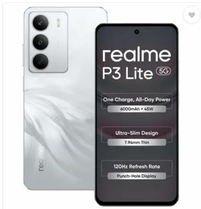
Image 1.1: Front and rear view of the realme P3 Lite 5G smartphone, showcasing its design and primary features.

The realme P3 Lite 5G (Model RMX3943) is a smartphone featuring a 6.67-inch display, a 6000 mAh battery with 45W fast charging, a Dimensity 6300 processor, and a 32MP rear camera. It operates on Android 15.