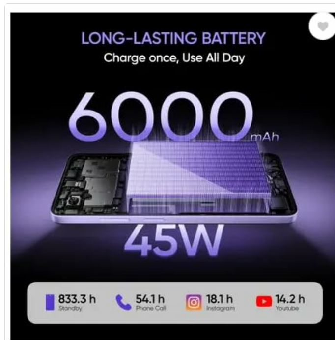
Image 4.3: Battery specifications and estimated usage duration for various activities. To charge, connect the provided Power Adapter and USB Cable to your device and a power outlet.

The device is powered by a 6000 mAh battery, designed for extended usage. It supports 45W fast charging, allowing for quick replenishment of battery life.