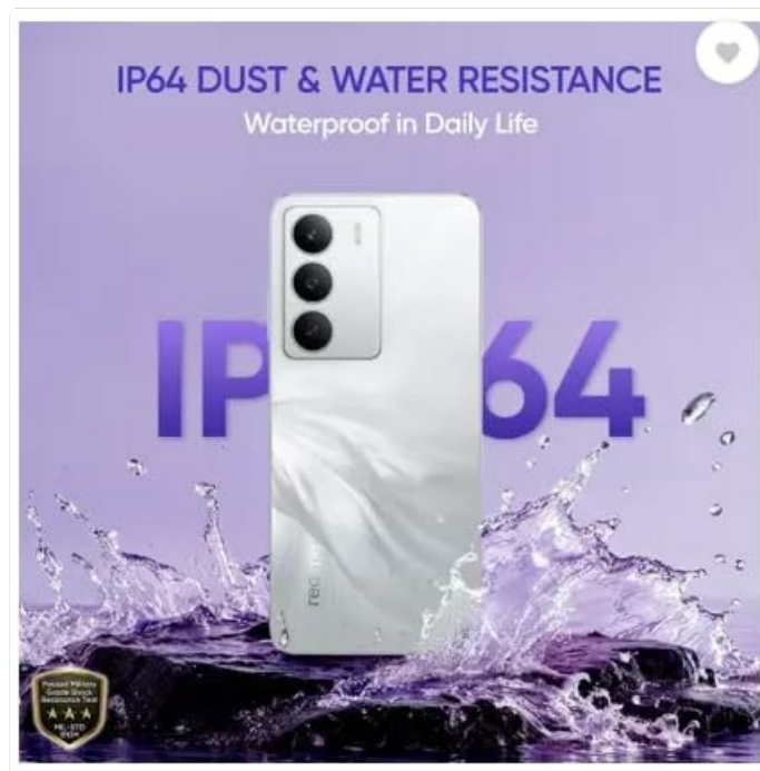
Image 5.2: Visual representation of the IP64 dust and water resistance.