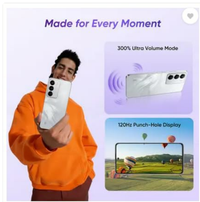
Image 4.1: The device display highlighting the 120Hz refresh rate and punch-hole camera. The device also supports a 300% Ultra Volume Mode for enhanced audio output.

Your realme P3 Lite 5G features a 6.67-inch display with a 120Hz refresh rate for smooth visuals and responsiveness. The punch-hole design maximizes screen space.