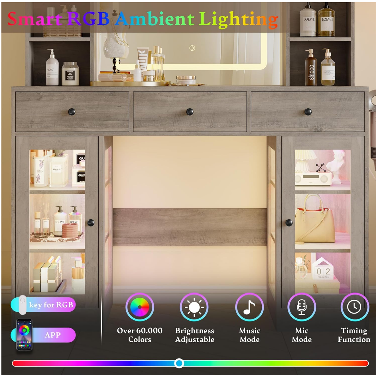
Image 5.2: The vanity desk featuring smart RGB ambient lighting, highlighting its ability to display over 60,000 colors, adjustable brightness, music mode, mic mode, and a timing function, all controllable via an app.