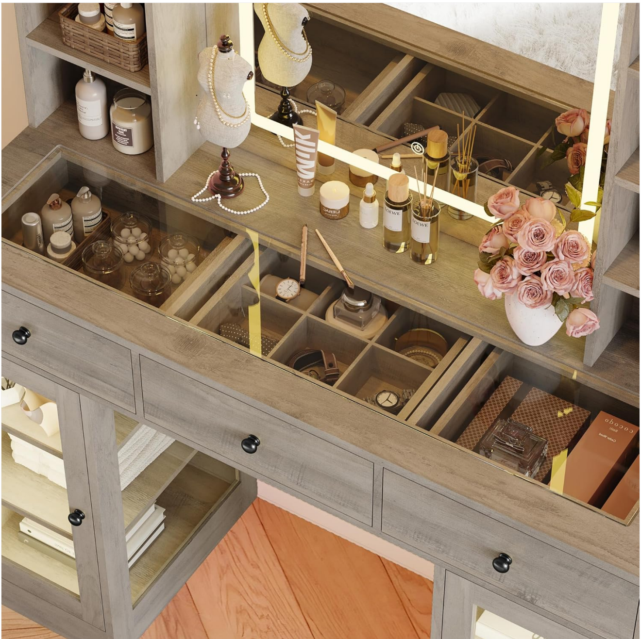
Image 5.5: A detailed view of the vanity desk's glass top, showcasing the organized compartments beneath for jewelry and small accessory storage.