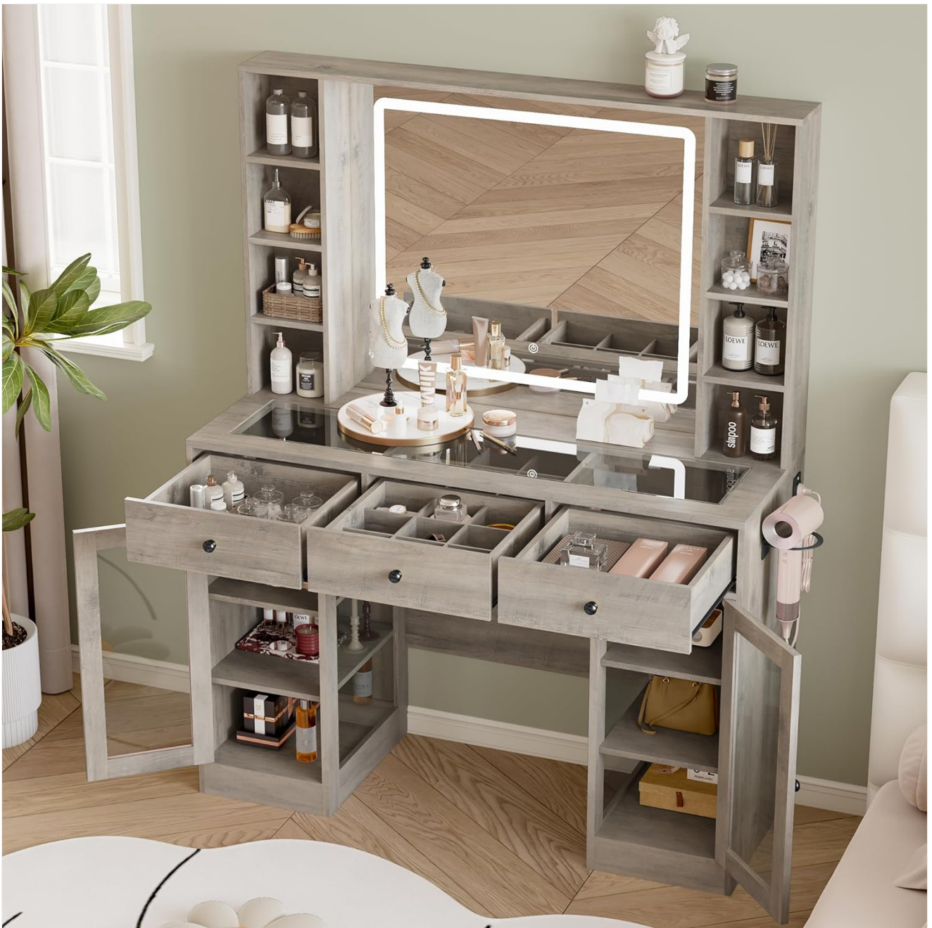
Image 5.4: The vanity desk with its drawers and glass cabinets open, demonstrating the extensive storage capacity available for organizing cosmetics, skincare products, and other personal items.