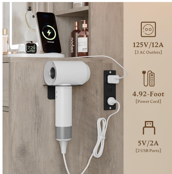
Image 5.3: A close-up view of the integrated power outlet on the vanity desk, illustrating its two AC outlets and two USB ports, designed for convenient charging and powering of beauty tools and electronic devices.