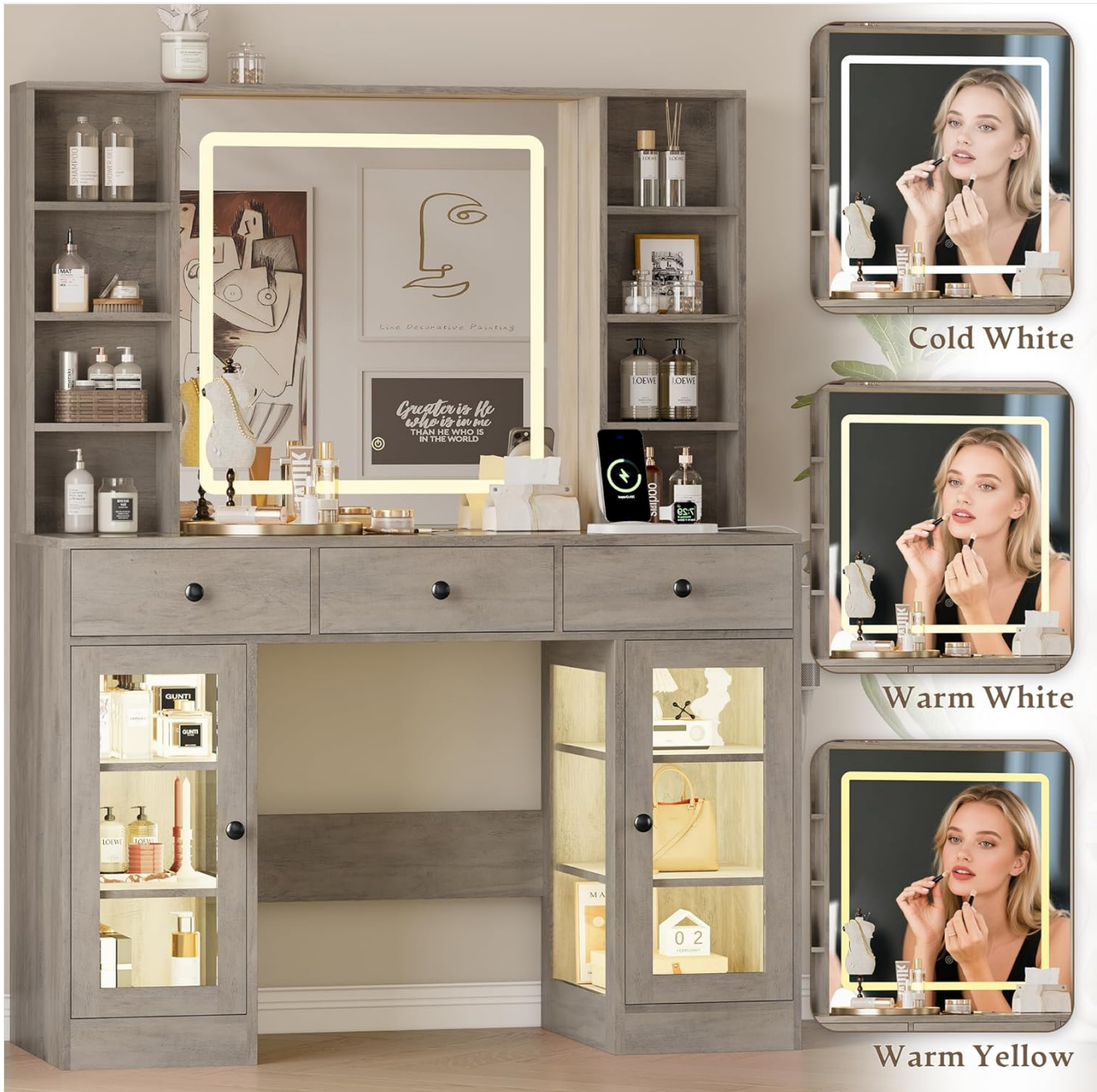
Image 5.1: The vanity mirror demonstrating its adjustable LED lighting, offering options for cold white, warm white, and warm yellow illumination to suit various makeup and grooming needs.