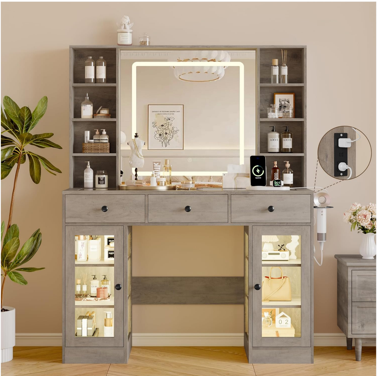
Image 1.1: The Wodeer 43-inch Grey Makeup Vanity Desk, showcasing its overall design with the illuminated mirror and various storage compartments.