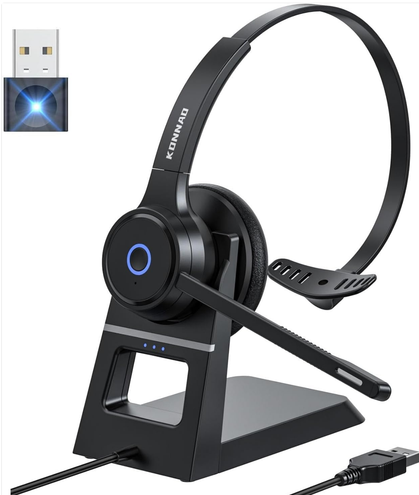
Image: The KONNAO BH369A Bluetooth Headset, showcasing its design and included accessories like the charging base and USB dongle.