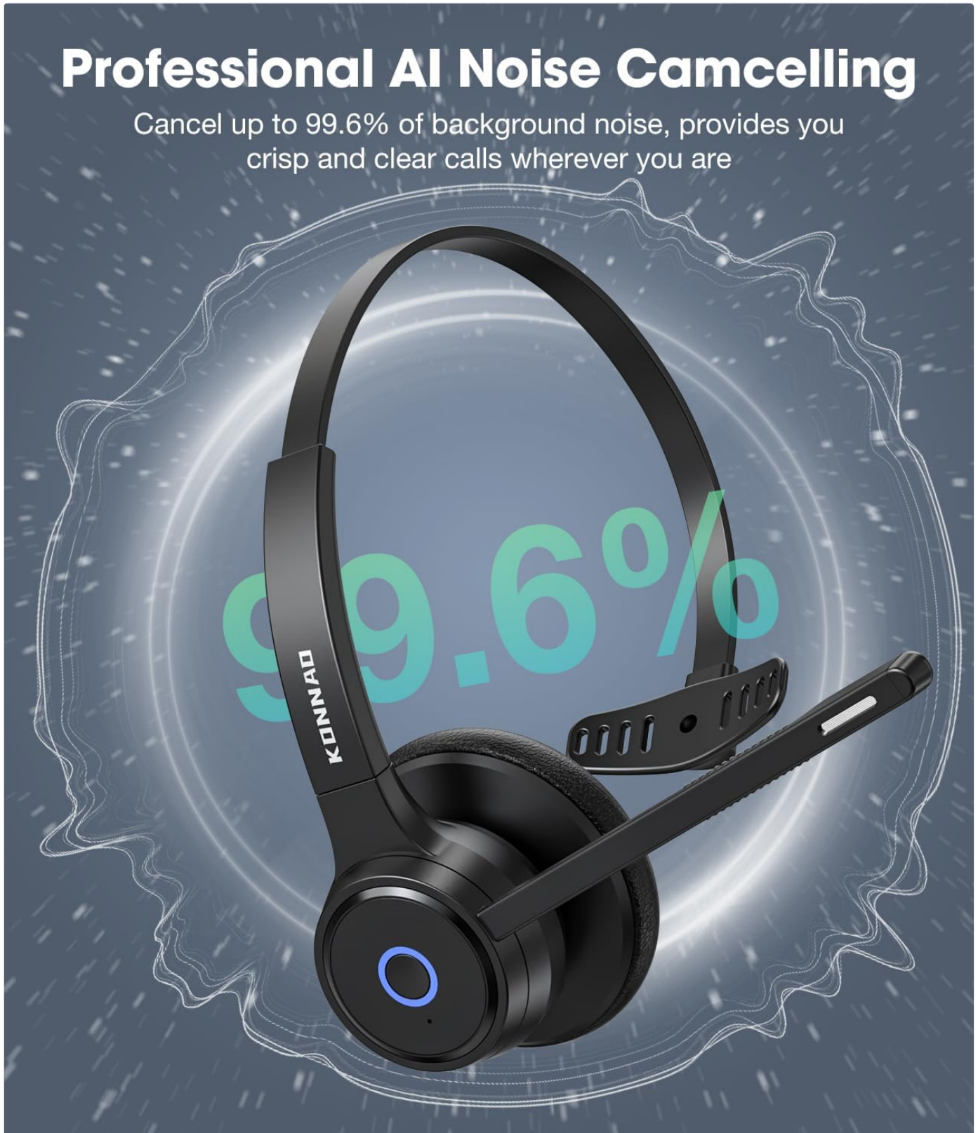
Image: Visual representation of the headset's AI noise cancellation capabilities, ensuring clear communication.

The KONNAO BH369A features advanced AI noise-cancelling technology that effectively eliminates up to 99.6% of ambient background noise. This ensures your voice is transmitted with clarity, making it ideal for busy office environments, call centers, or remote work.