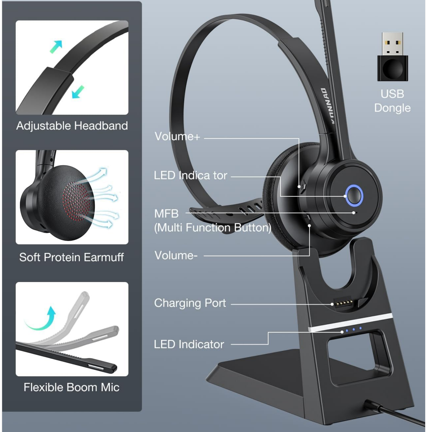
Image: Detailed view of the headset's controls and features for easy identification and use.