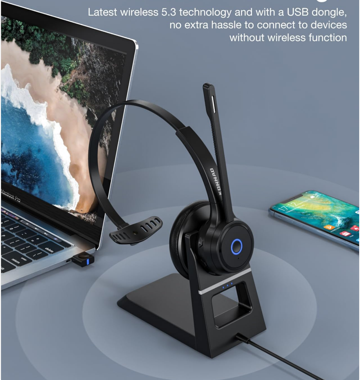
Image: The headset offers flexible connectivity via Bluetooth 5.3 or the included USB dongle, compatible with various devices.

Latest wireless 5.3 technology and with a USB dongle, no extra hassle to connect to devices without wireless function