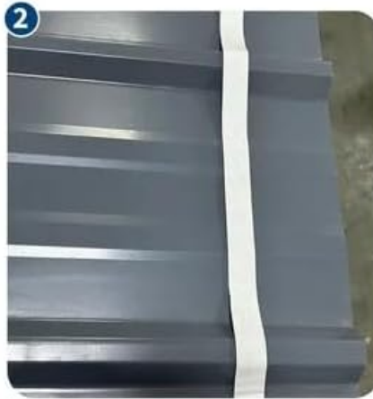
Foam Tape Application