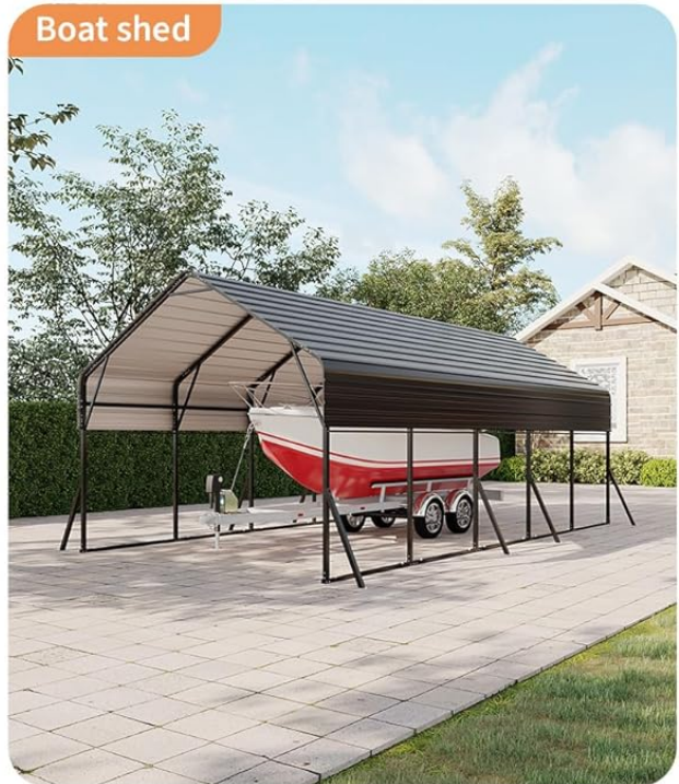
Image Description: A collage of four images showcasing the carport in various scenarios: protecting a vehicle on a rainy day, covered in snow on a snowy day, serving as an outdoor workshop, and functioning as a boat shed.