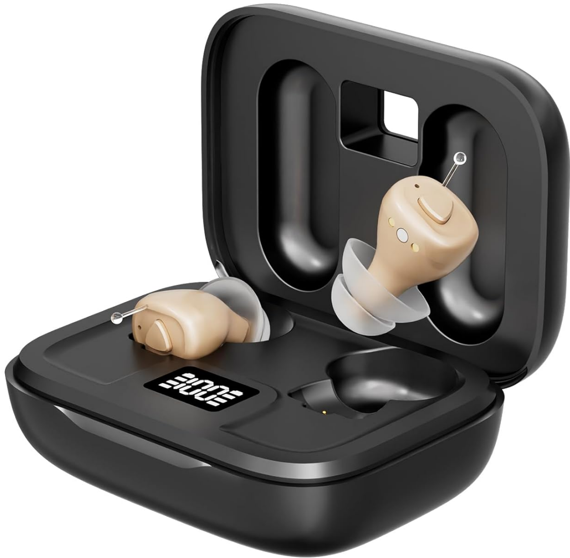
Figure 1: LAMYOO Digital Rechargeable Invisible Hearing Aids and Charging Case.