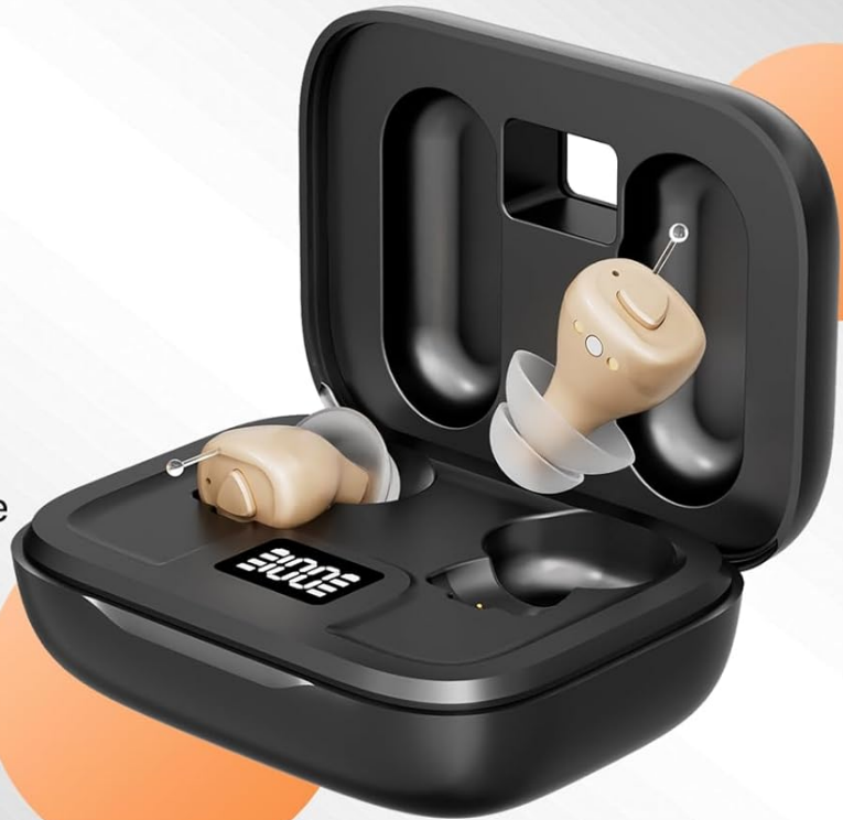
Figure 2: Hearing aids in charging case, illustrating battery life and charging times.