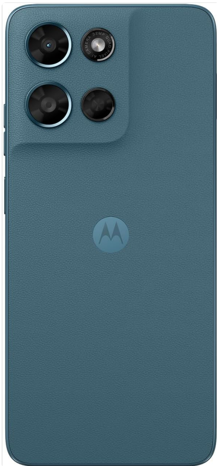
Back View: Displays the 32MP AI-powered quad pixel camera system and the Motorola logo.