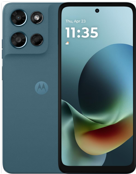
Front View: Features the 6.7-inch display and front-facing camera.