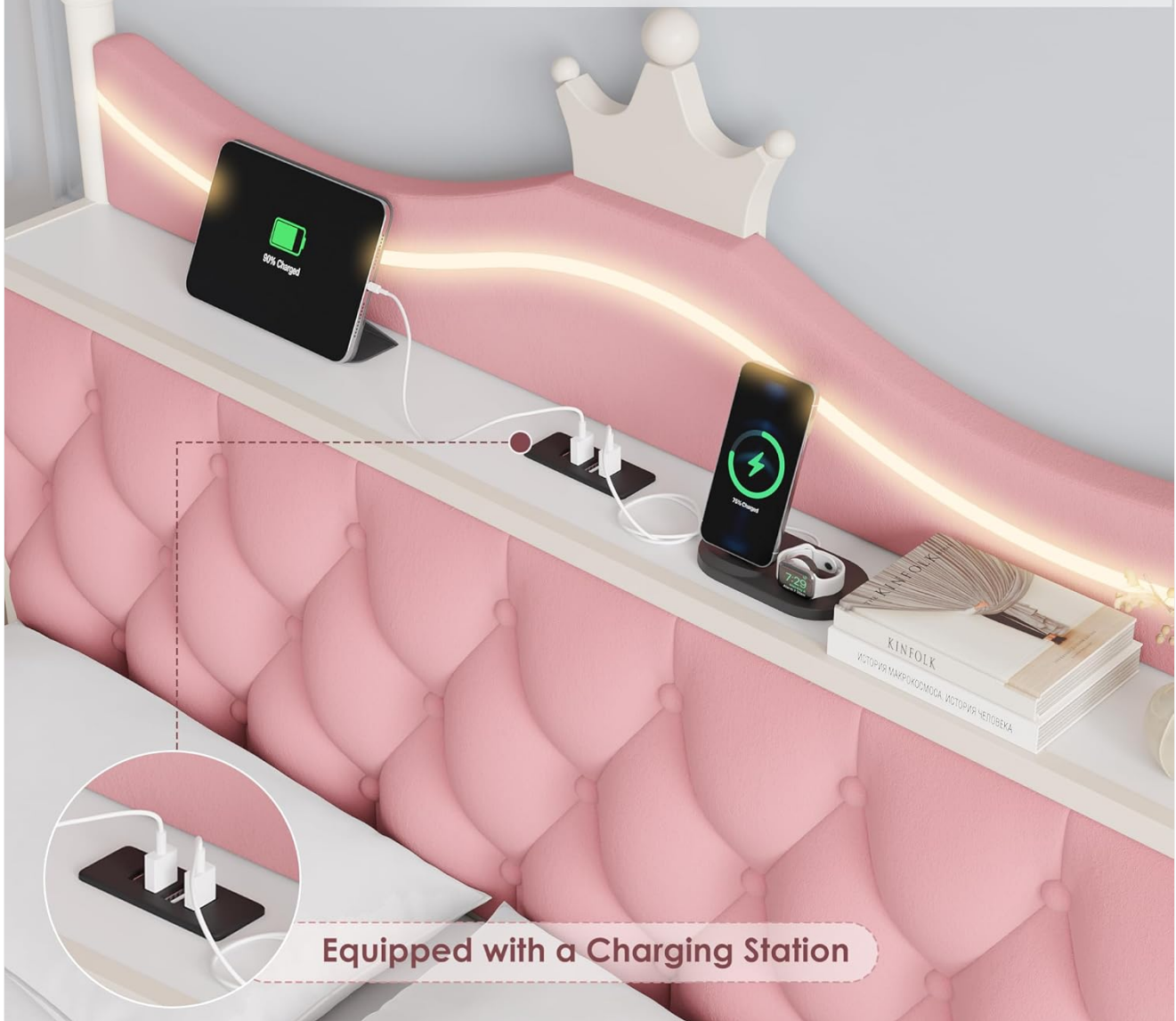
Figure 4: Detail of the charging station and storage shelf.

A storage tabletop for organizing bedside items orderly.