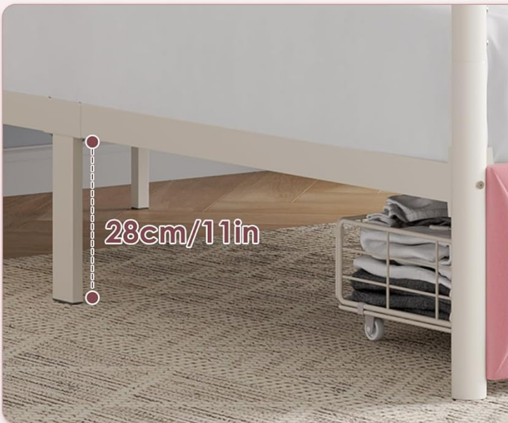
Figure 6: Under-bed storage space and clearance.

Video 1: Overview of the Keyluv Upholstered Canopy LED Bed Frame, demonstrating features like removable posts, LED lights, charging station, and storage drawers.