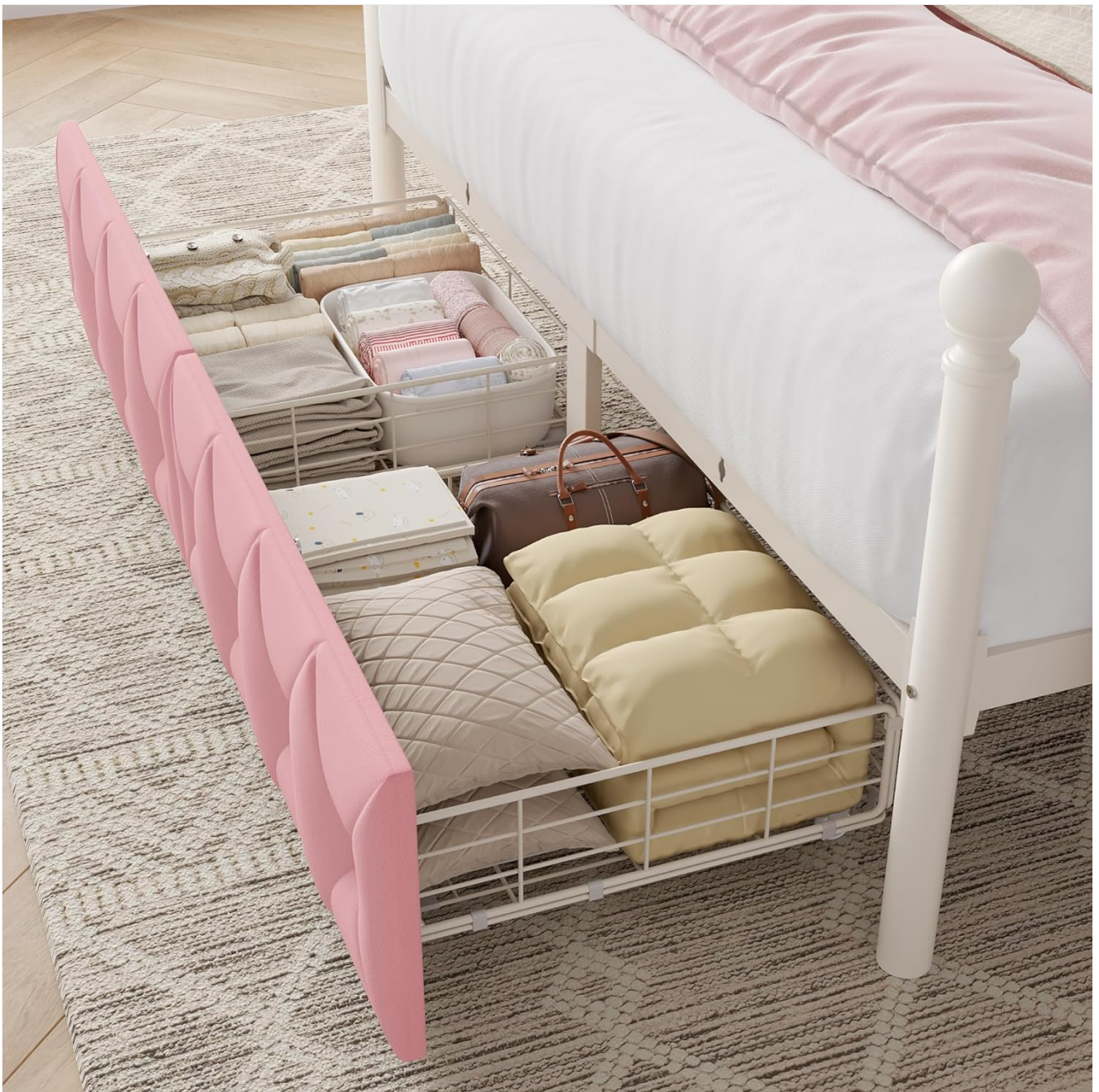
Figure 5: Under-bed storage drawer in use.