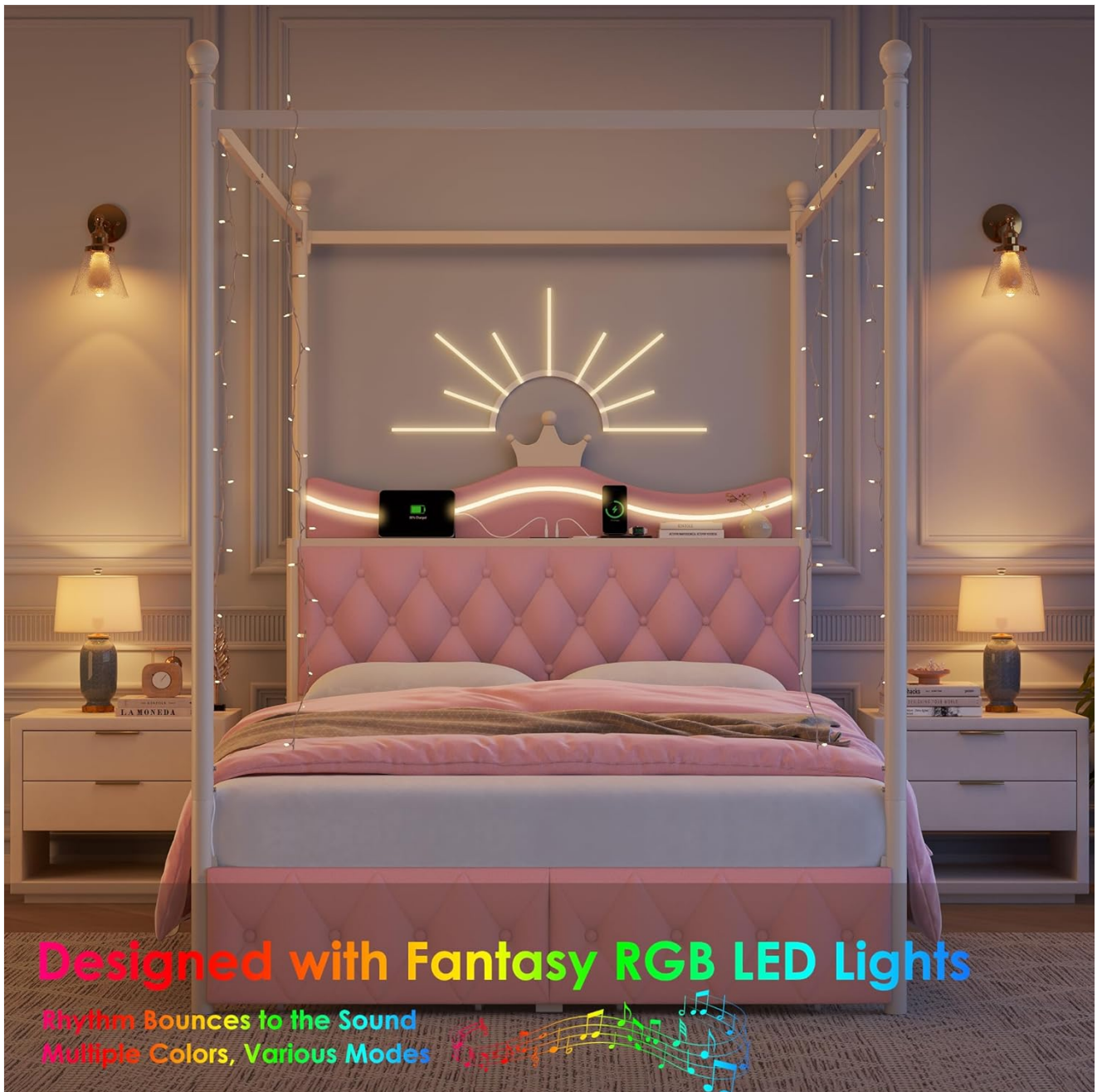
Figure 3: Headboard with LED lights and charging station in use.