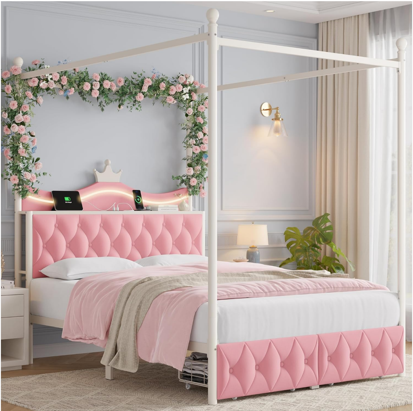
Figure 2: Assembled bed frame with canopy posts.