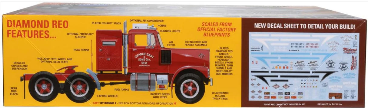
Image: A side profile view of the assembled Diamond REO Truck Tractor model, showcasing key features and components such as the tilting hood, exhaust stacks, and battery boxes.