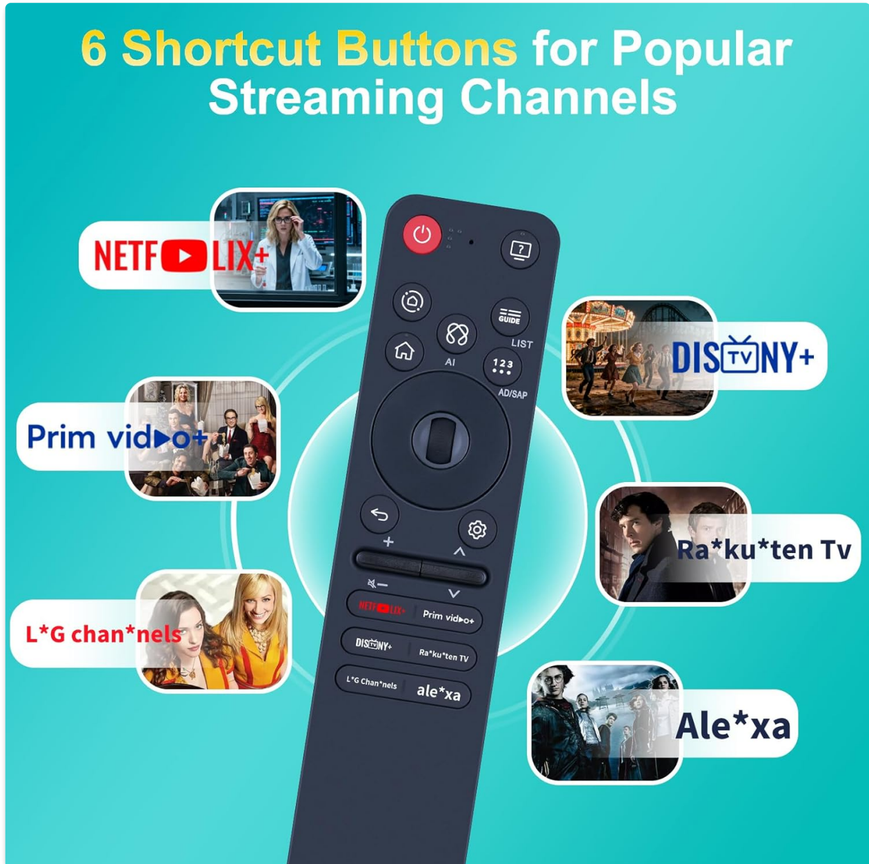
Image: The remote control with six shortcut buttons prominently highlighted, each corresponding to a popular streaming service or voice assistant.