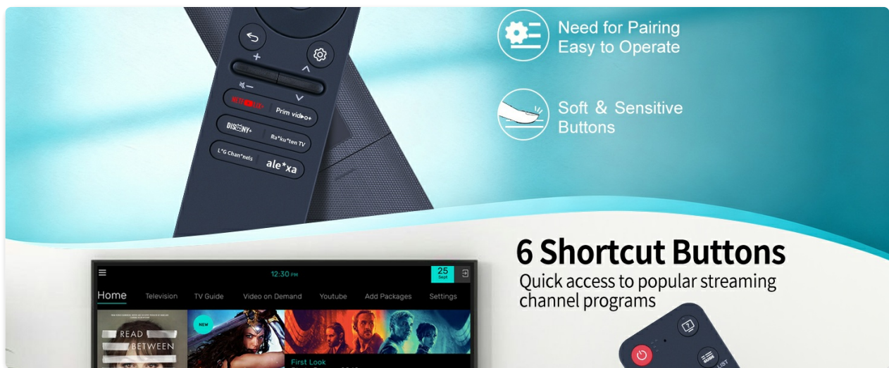
Image: A visual representation of the remote control alongside various LG TV models (C5, B5, G5/M5 series) indicating compatibility.

For specific compatible TV models, please refer to the detailed list below: