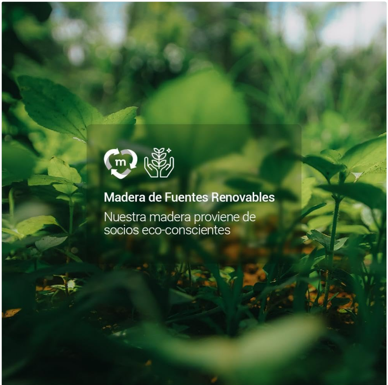
Image: Background image with text indicating that the wood used in the product comes from renewable and eco-conscious sources.