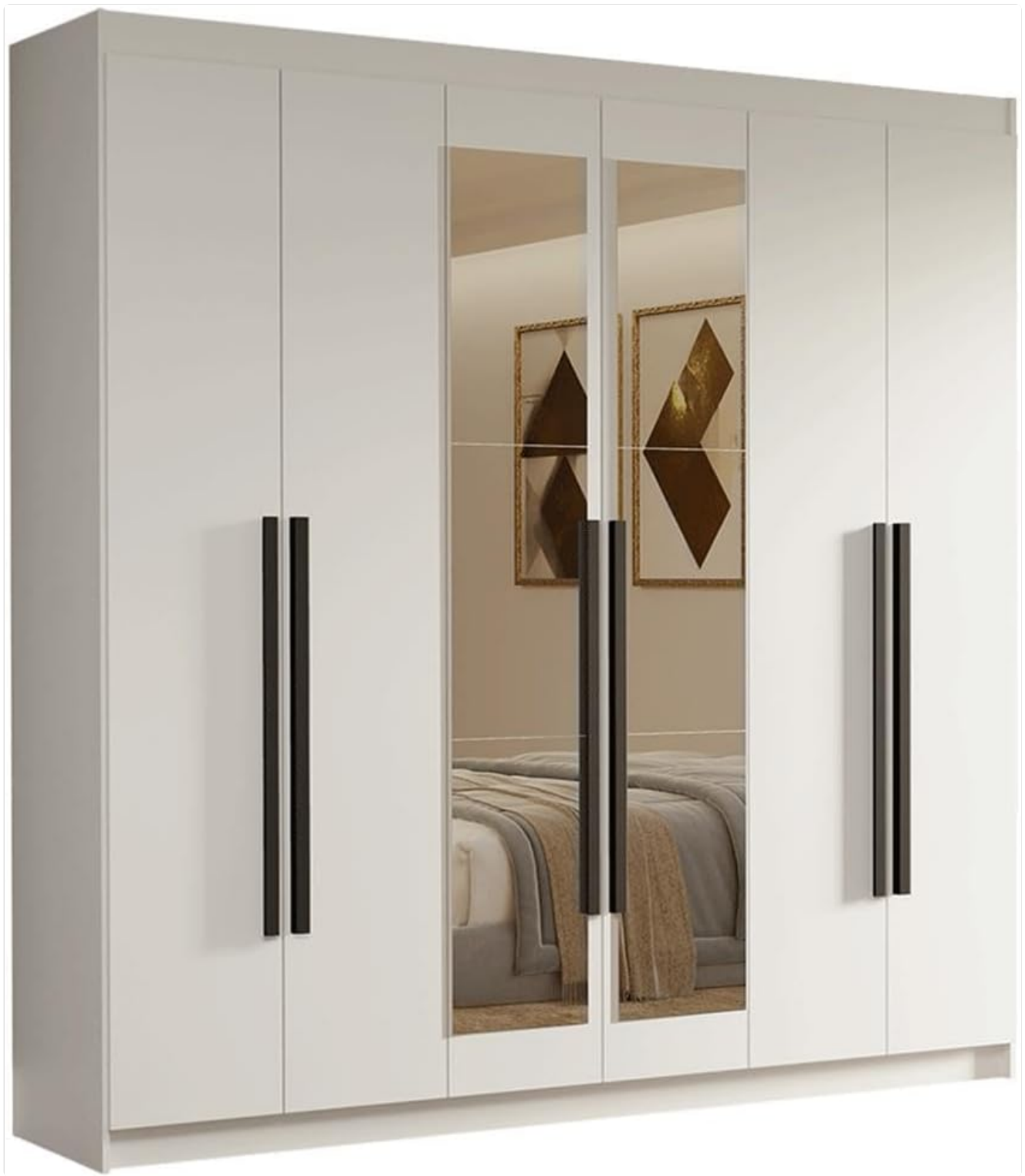
Image: Front view of the Madesa Venus 6-Door Couple Wardrobe, showcasing its design with two mirrored doors in the center.