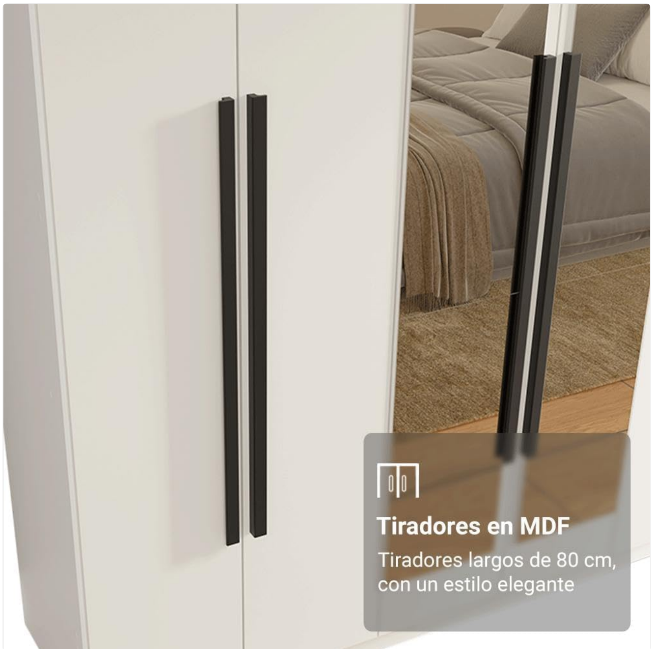
Image: Detail of the long 80 cm MDF handles, showcasing their elegant and modern design on the wardrobe doors.