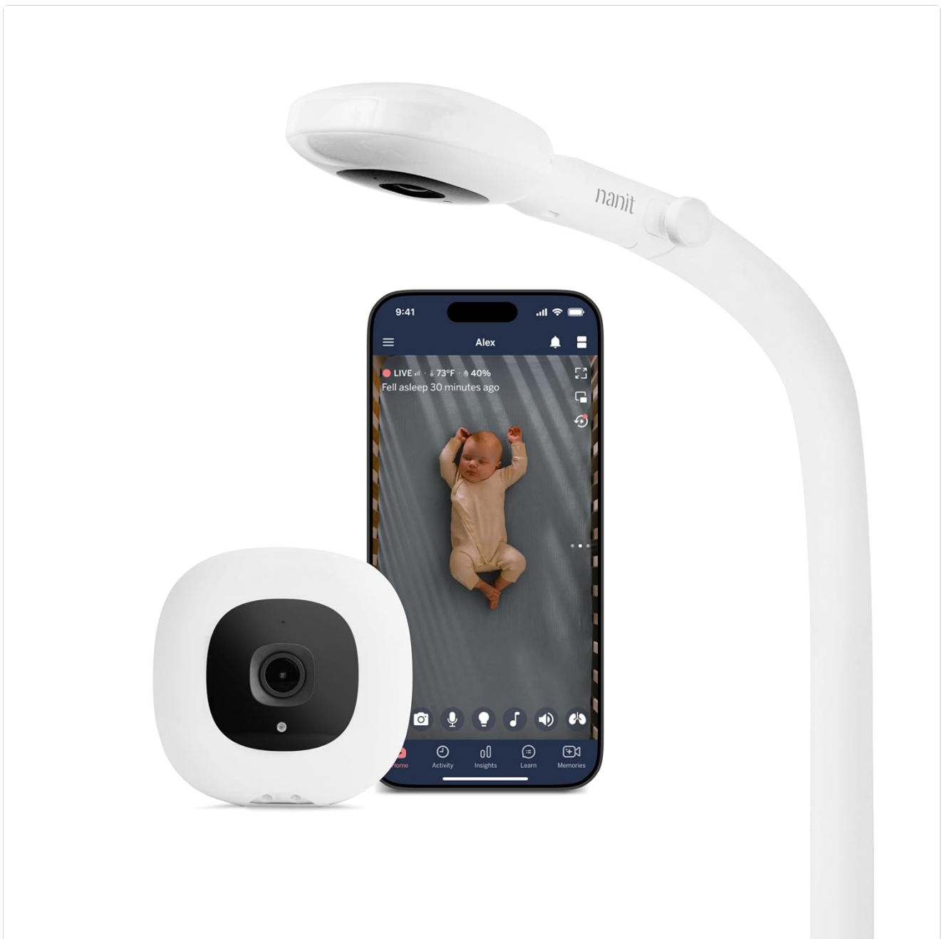
Image: Nanit Pro Smart Baby Monitor with Floor Stand and companion app interface.