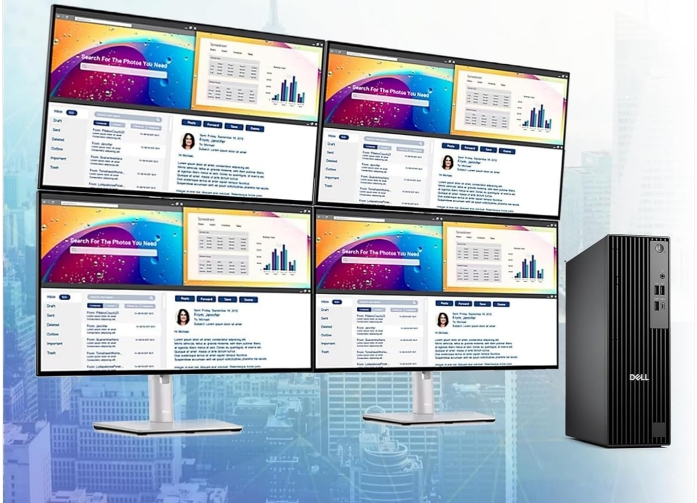
Figure 5: The desktop is capable of supporting up to four displays for enhanced productivity.