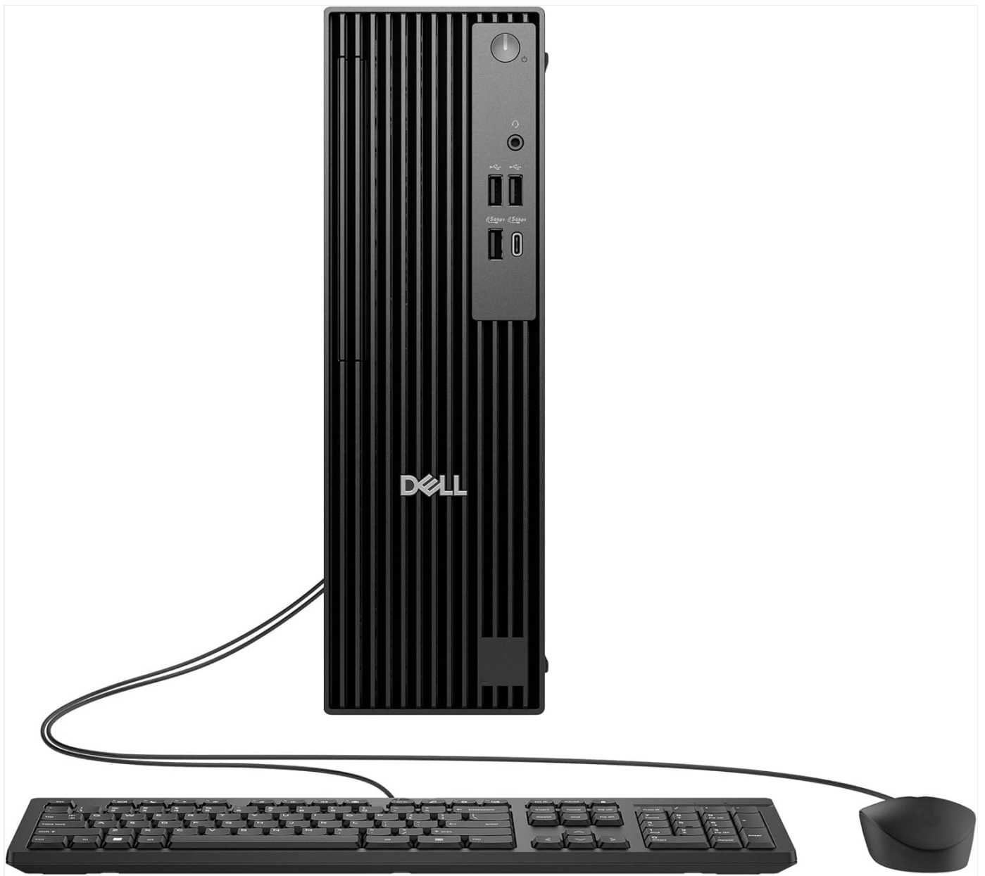
Figure 1: Front view of the Dell Pro Slim QCS1250 SFF Desktop with included keyboard and mouse.