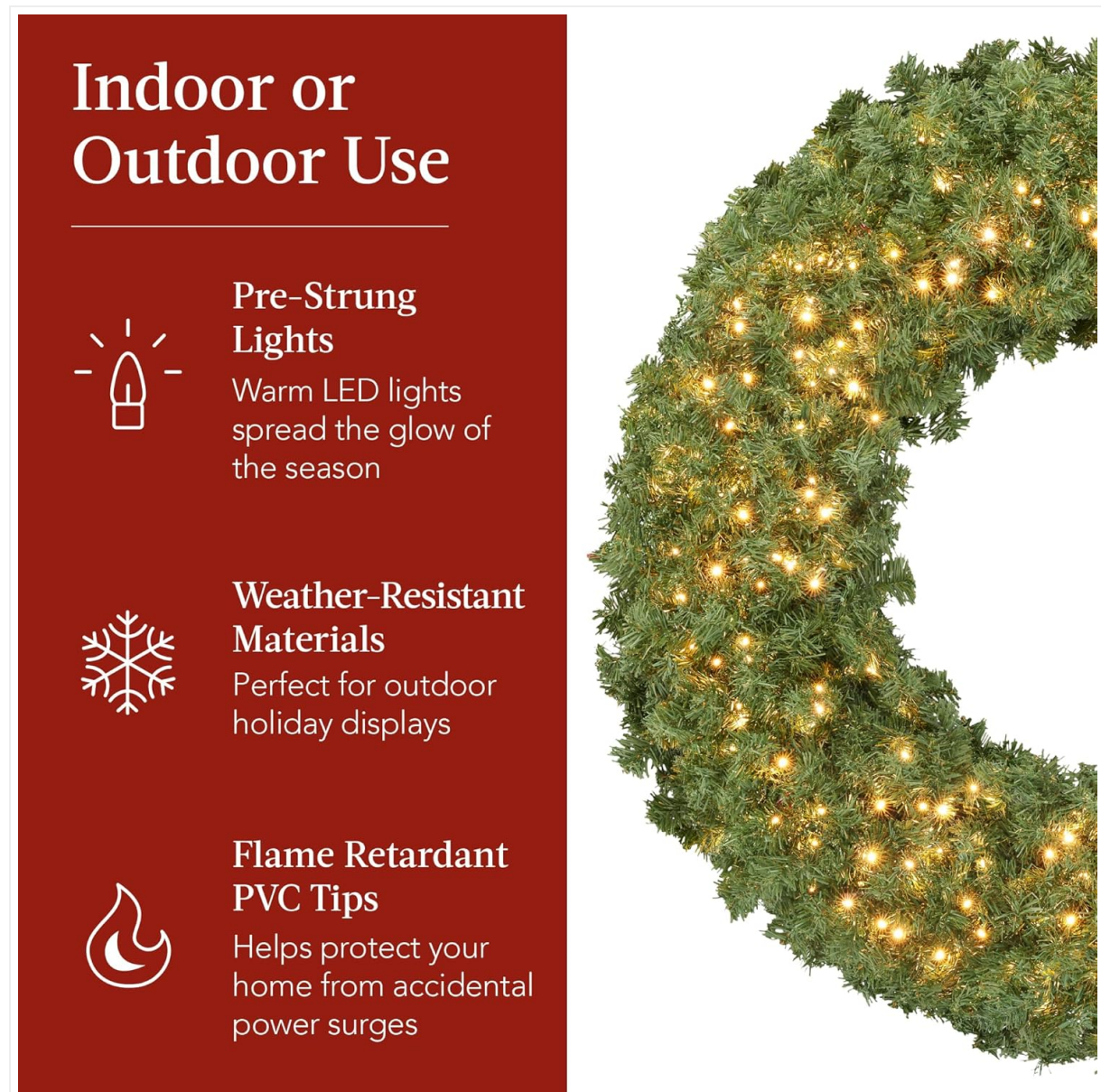
Figure 3: Key features of the wreath, including pre-strung lights, weather-resistant materials, and flame-retardant PVC tips. This image highlights the durability and safety aspects of the product for both indoor and outdoor environments.

When not in use, store the wreath in its original packaging or a suitable storage container to protect it from dust and damage. Store in a cool, dry place away from direct sunlight and extreme temperatures. If the wreath was assembled from multiple sections, it can be disassembled for more compact storage.