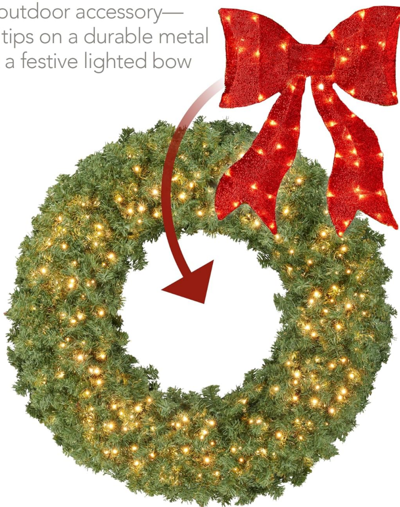
Figure 2: A 36-inch wreath with a lighted bow, illustrating the connection points for the power supply. This image highlights the integration of the bow's lighting with the main wreath's power system.