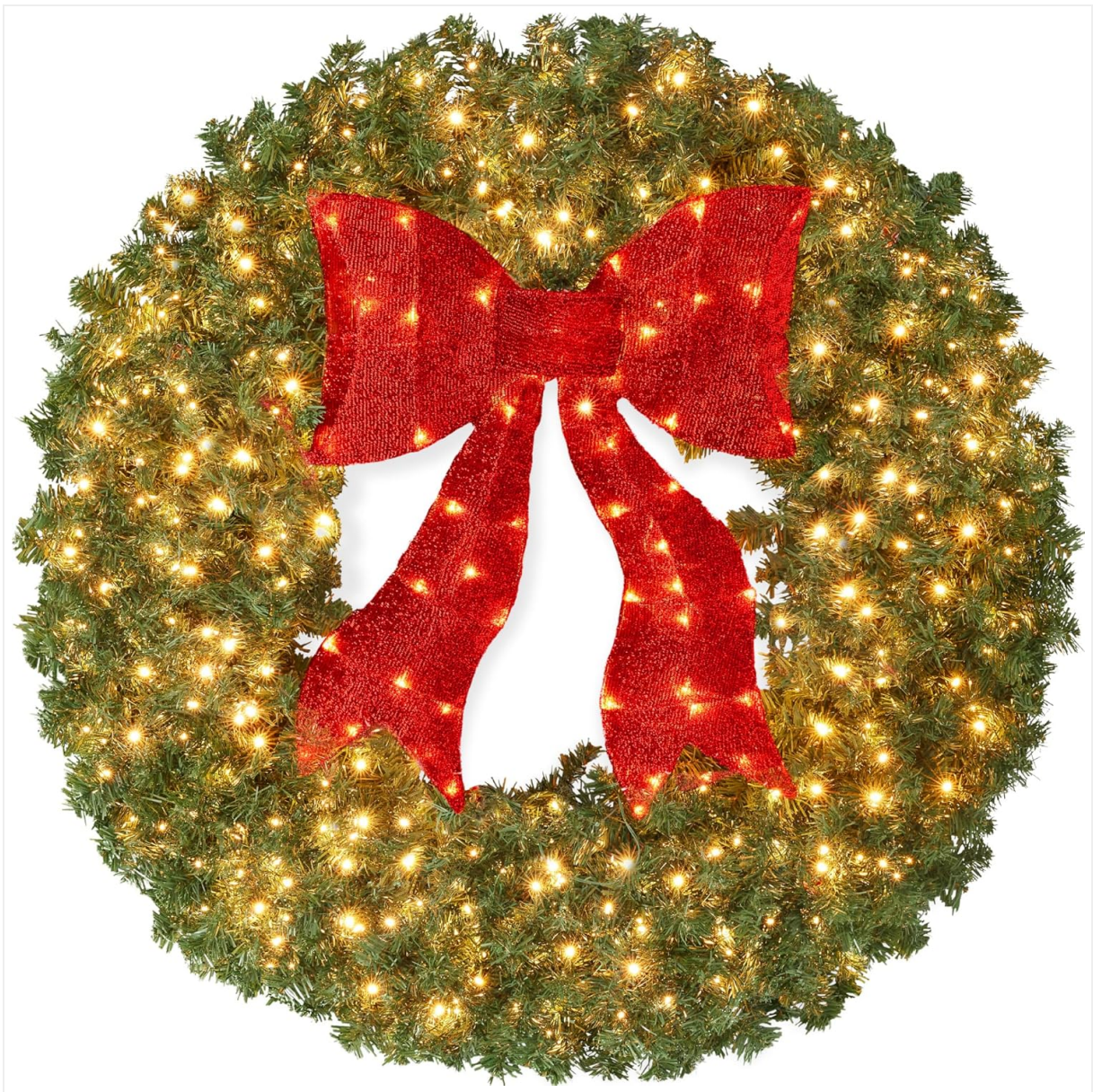
Figure 1: The Best Choice Products 36-inch Pre-Lit Artificial Fir Christmas Wreath with its optional red lighted bow. This image displays the fully assembled and fluffed wreath, showcasing its warm white LED lights and lush green foliage.