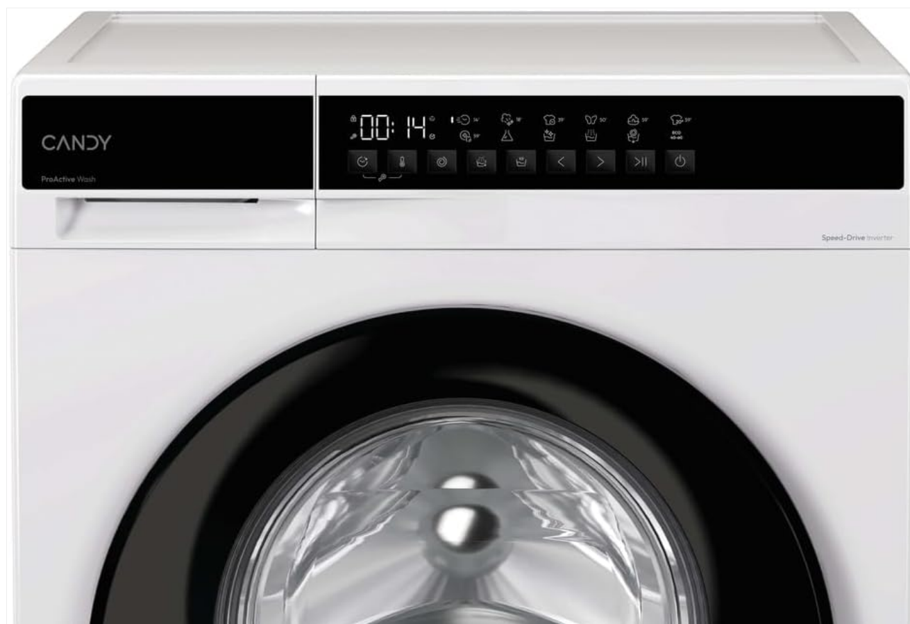
Figure 2: Close-up view of the control panel, showing the program selector, display, and function buttons.

The Candy EY 27SB7-S offers 12 programs to cater to various fabric types and soil levels. Turn the program selector dial to choose the desired wash program. Common programs include Cotton, Synthetics, Delicates, Wool, Quick Wash, and Eco.