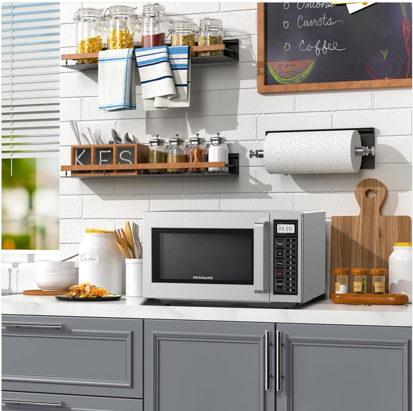
The Frigidaire Commercial Microwave Oven EMW965 placed on a kitchen counter, demonstrating typical installation.