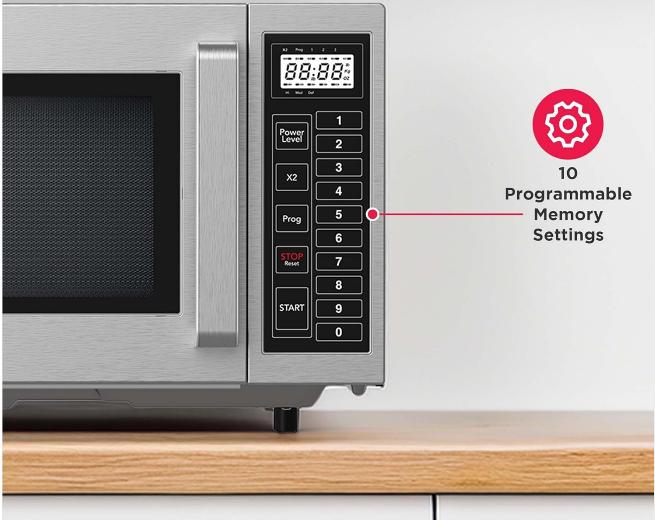
Close-up of the control panel, showing the LED display, number pad, and function buttons including Power Level, X2, Prog, Stop/Reset, and Start.

Save your favorite multi-stage cooking settings to one-touch memory buttons for fast, consistent results every time.