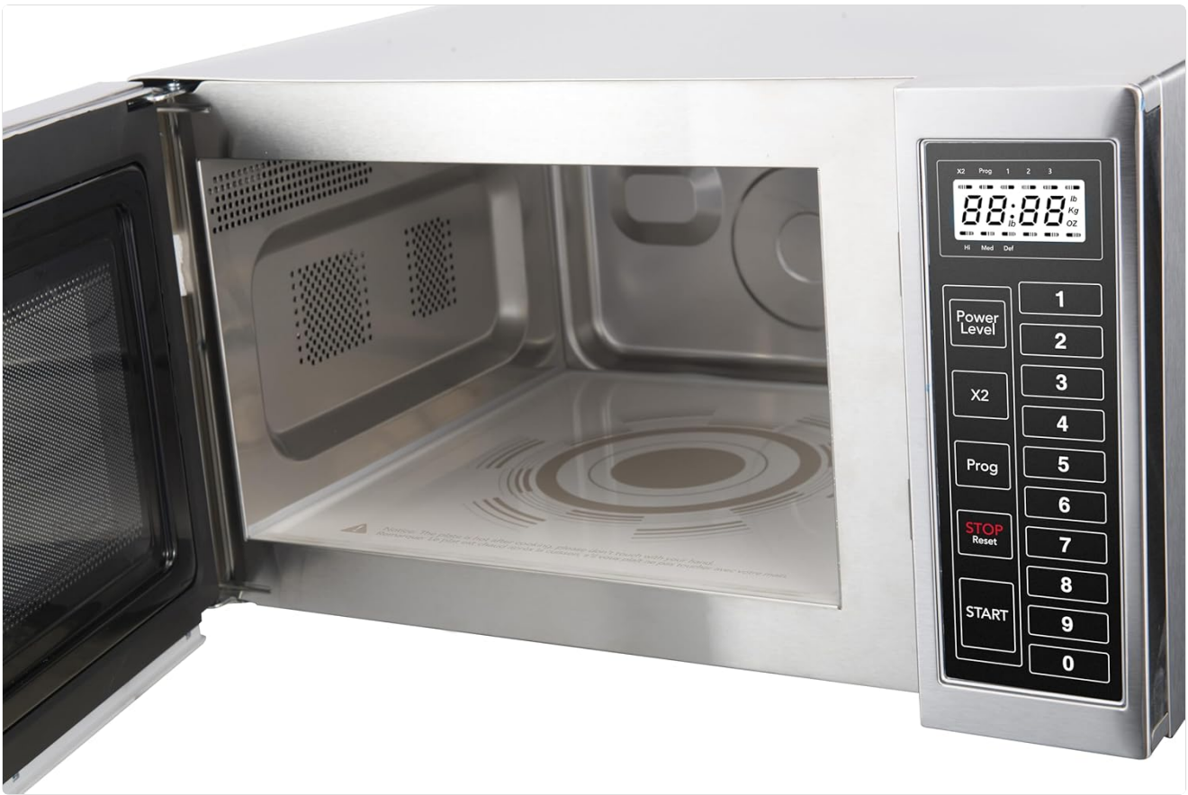
Detailed view of the microwave's interior, showing the stainless steel walls and ceramic flatbed bottom.