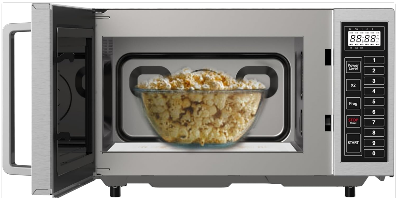
Interior view of the microwave showing a bowl of popcorn, highlighting the flatbed design.

Press the X2 button to double the current cooking time or to repeat the previous cooking cycle.