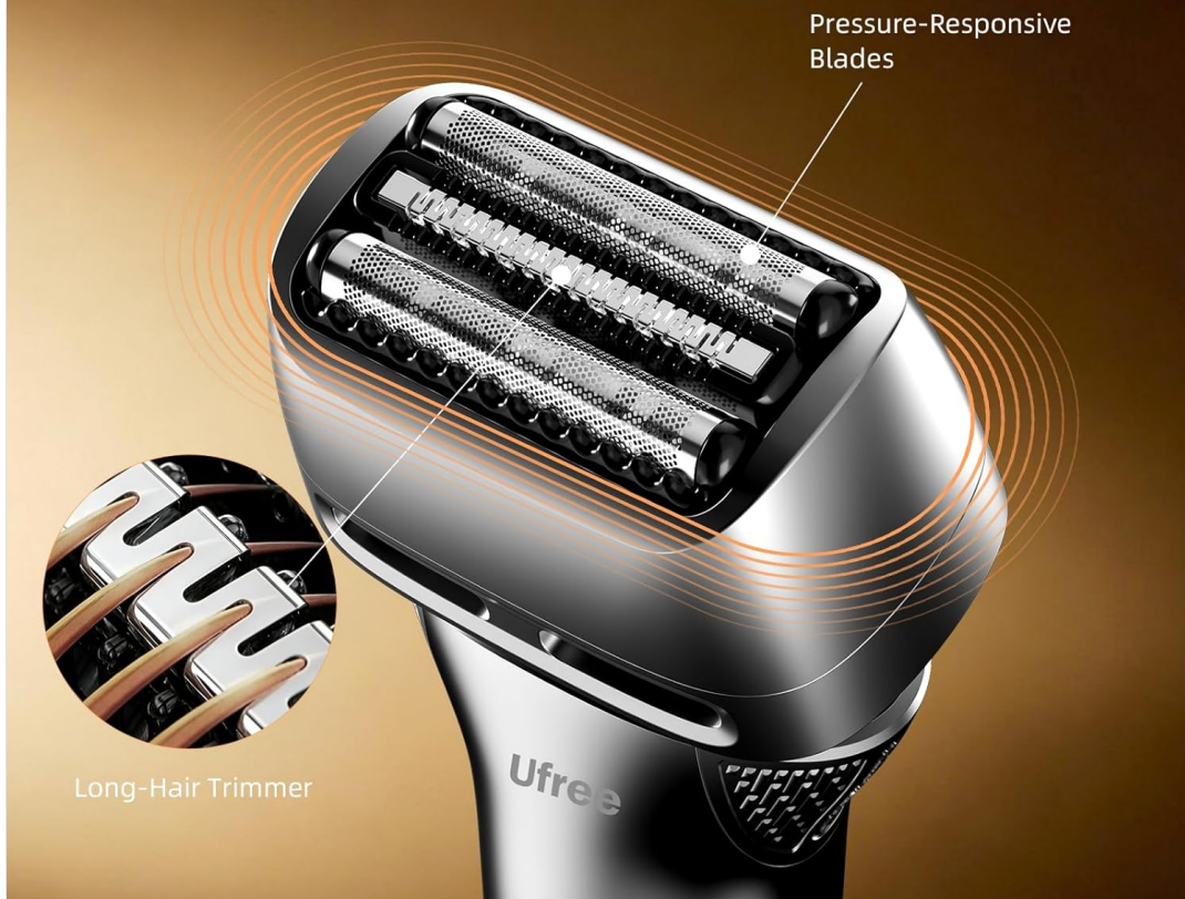
Image 2: Close-up of the shaver head, illustrating the pressure-responsive blades and the long-hair trimmer for a skin-friendly shave.

Smooth, continuous cutting at 8,500 RPM for a gentler, skin-friendly shave