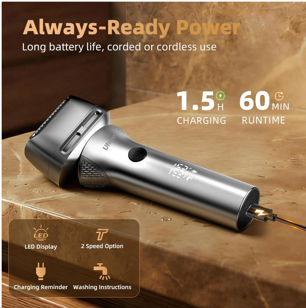
Image 4: The Ufree Foil Shaver connected to its charging cable, with the LED display showing battery status and charging reminder.