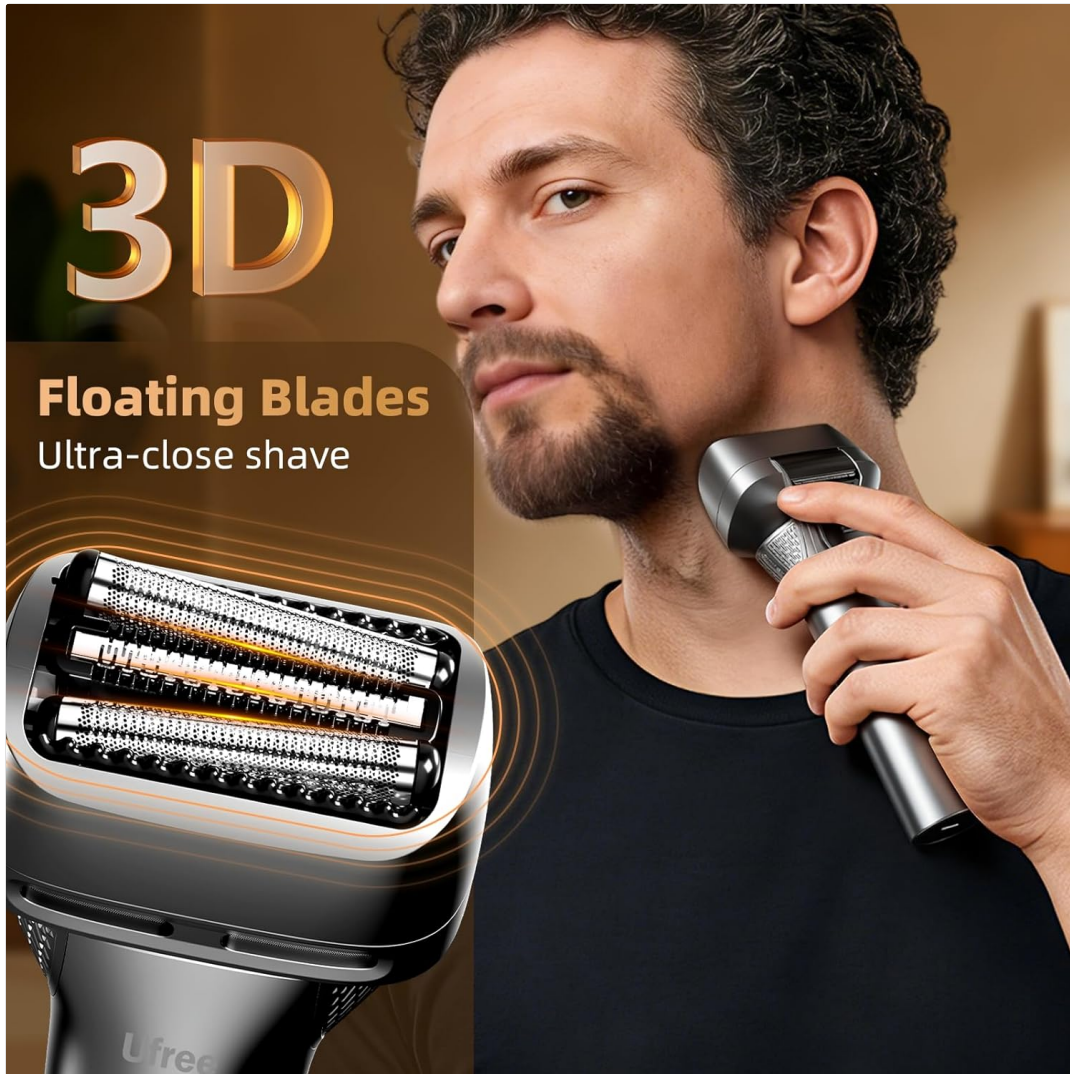
Image 1: The Ufree Foil Shaver highlighting its 3D floating blade system for an ultra-close shave.