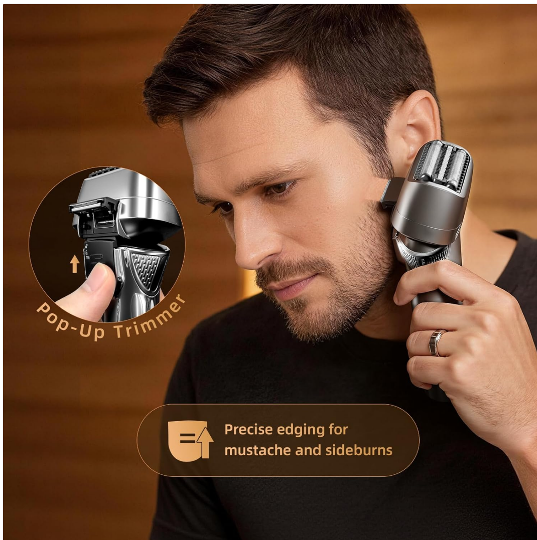
Image 3: A user demonstrating the integrated pop-up trimmer for precise edging of mustaches and sideburns.