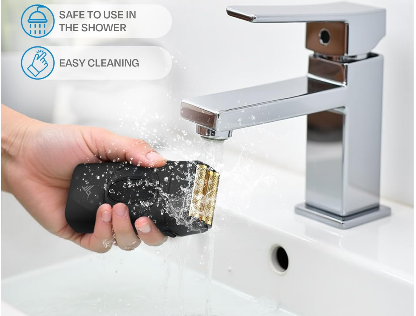
Image: The shaver is IPX7 waterproof for easy cleaning.