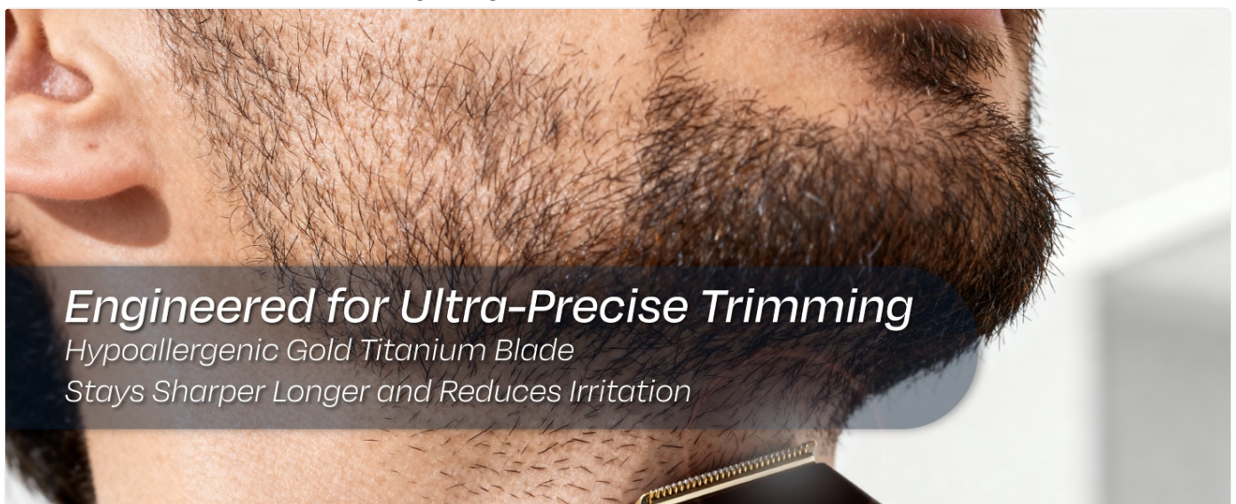
Image: Using the trimmer head for precise beard trimming.