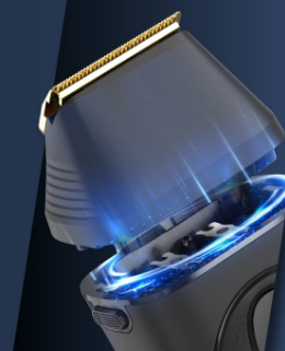
Image: QuickSwap Modular Blade System for easy head changes.

QuickSwap Interchangeable Foil & Trimmer Heads