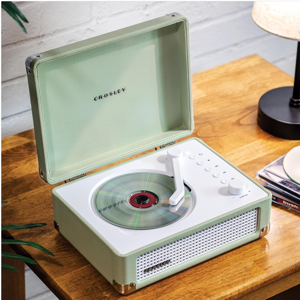
Image: The Crosley CR3505A-MT CD player with a CD inserted, ready for playback, showcasing its open design.