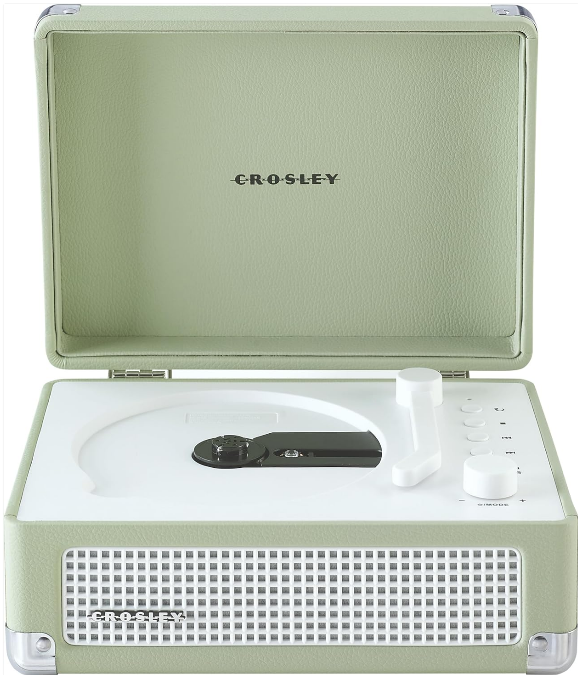
Image: Top view of the Crosley CR3505A-MT CD player with lid open, highlighting the CD compartment, tonearm-inspired switch, and control buttons.

buttons for playback and mode selection.