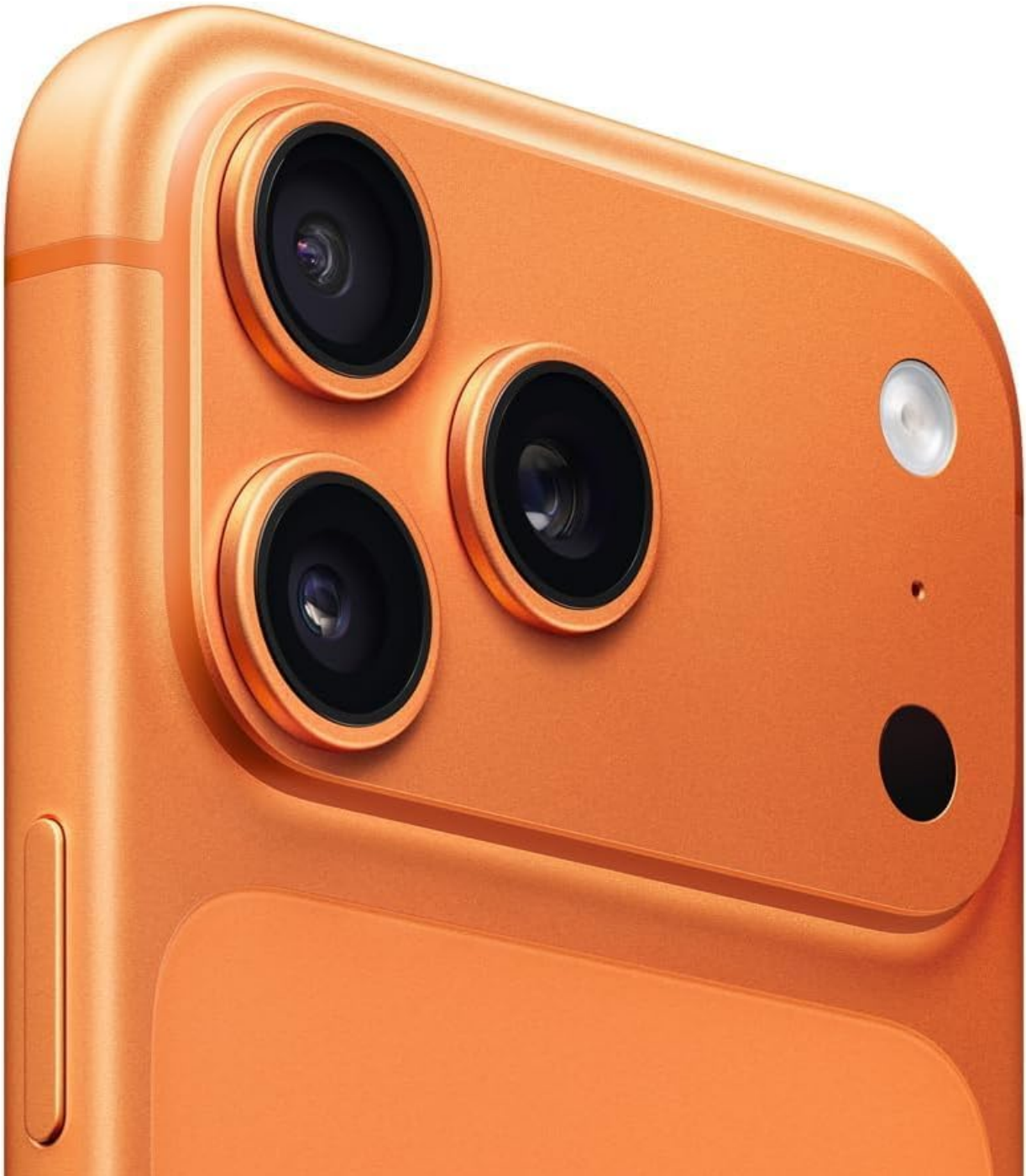
Image: Detailed view of the iPhone 17 Pro Max's triple-lens camera system and flash.

videos. The rear camera module includes multiple lenses for various photographic needs, such as wide-angle, ultra-wide, and telephoto shots. The front camera supports high-resolution selfies and video calls.