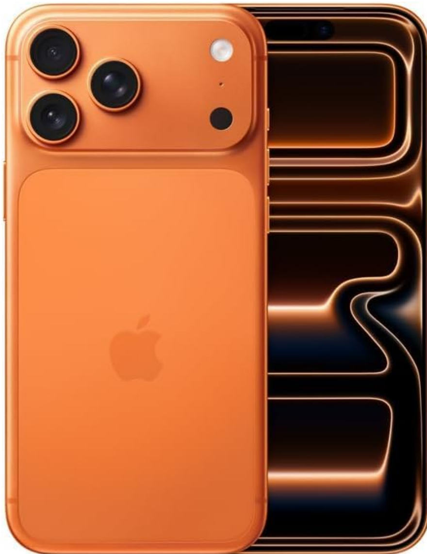
Image: Front and back view of the Apple iPhone 17 Pro Max, highlighting its camera system and overall form factor.