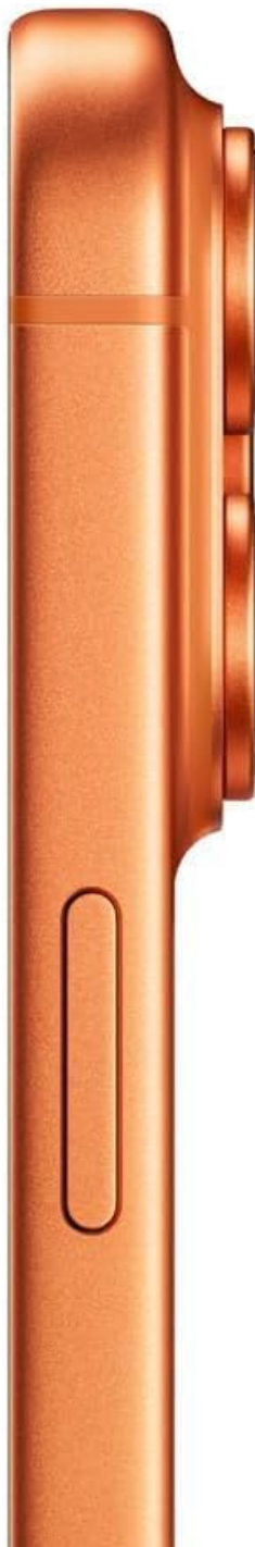
Image: Side view of the iPhone 17 Pro Max, illustrating the placement of the volume and action buttons.