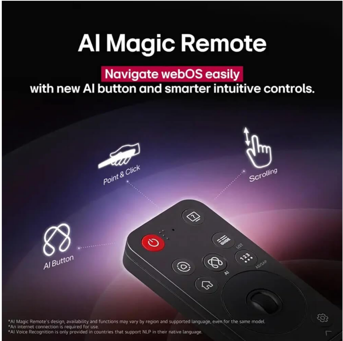
Figure 3: LG AI Magic Remote Control.

The AI Magic Remote allows for intuitive control of your TV with point-and-click, scrolling, and voice commands.