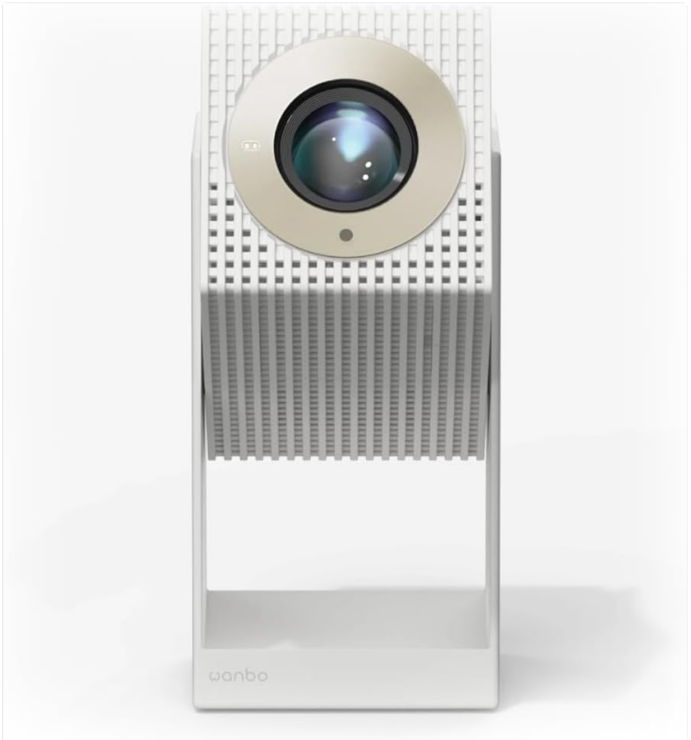
Figure 3: Projector angled for flexible projection.