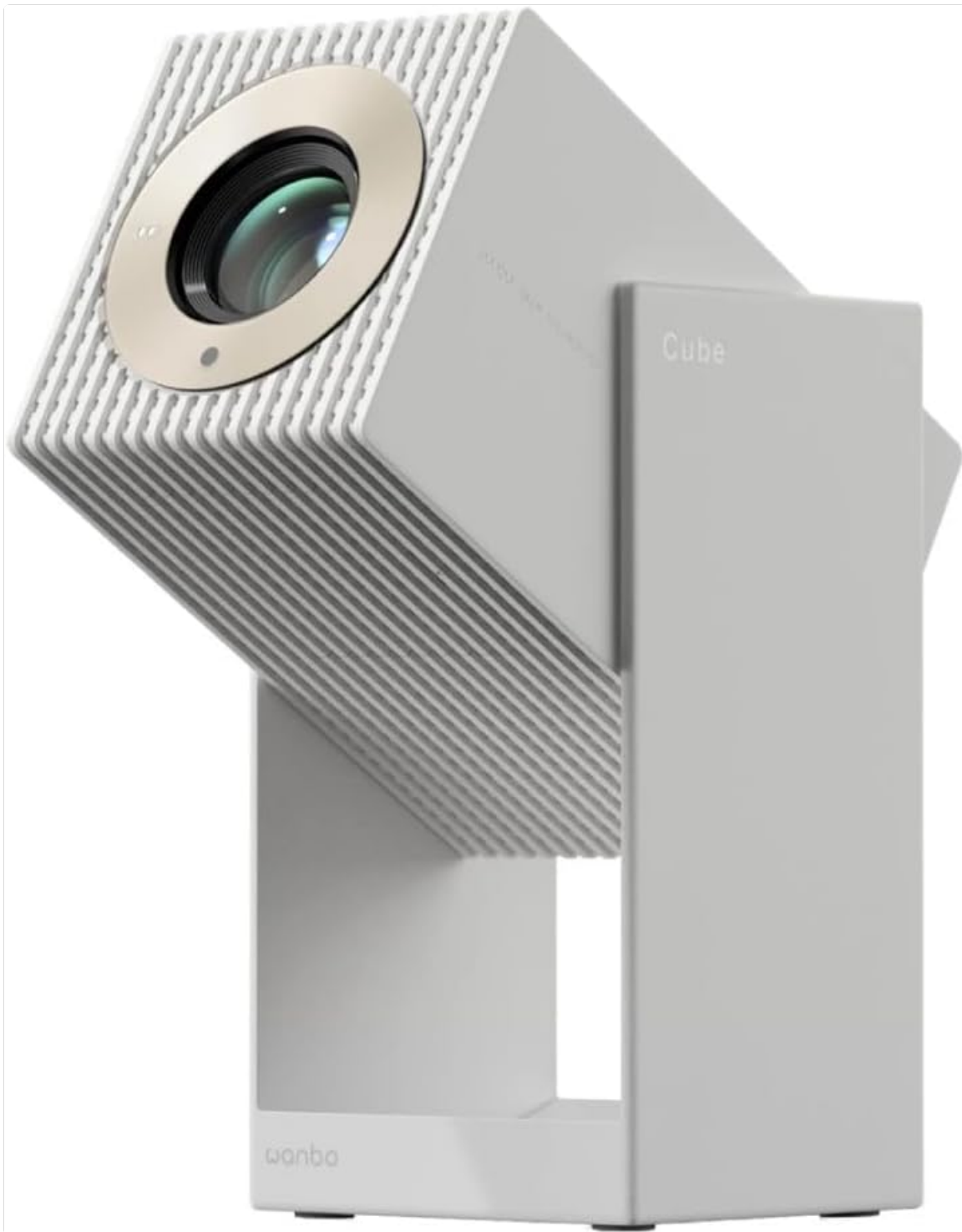
Figure 1: Front view of the Wanbo Cube 2 Pro Smart Projector.