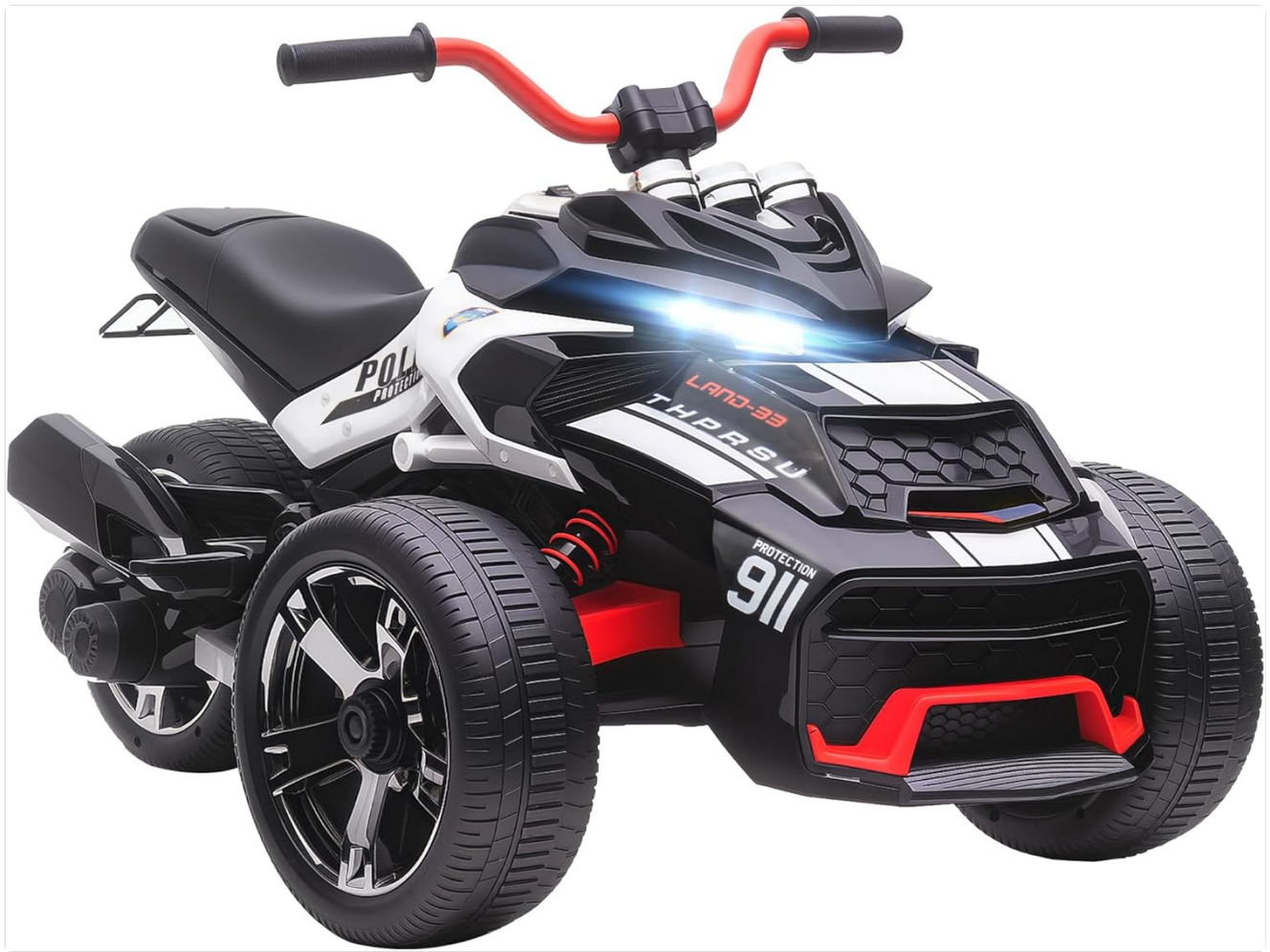
Image: The AIYAPLAY 12V Electric Quad, showcasing its black and white design with red accents. This image represents the complete product after assembly.