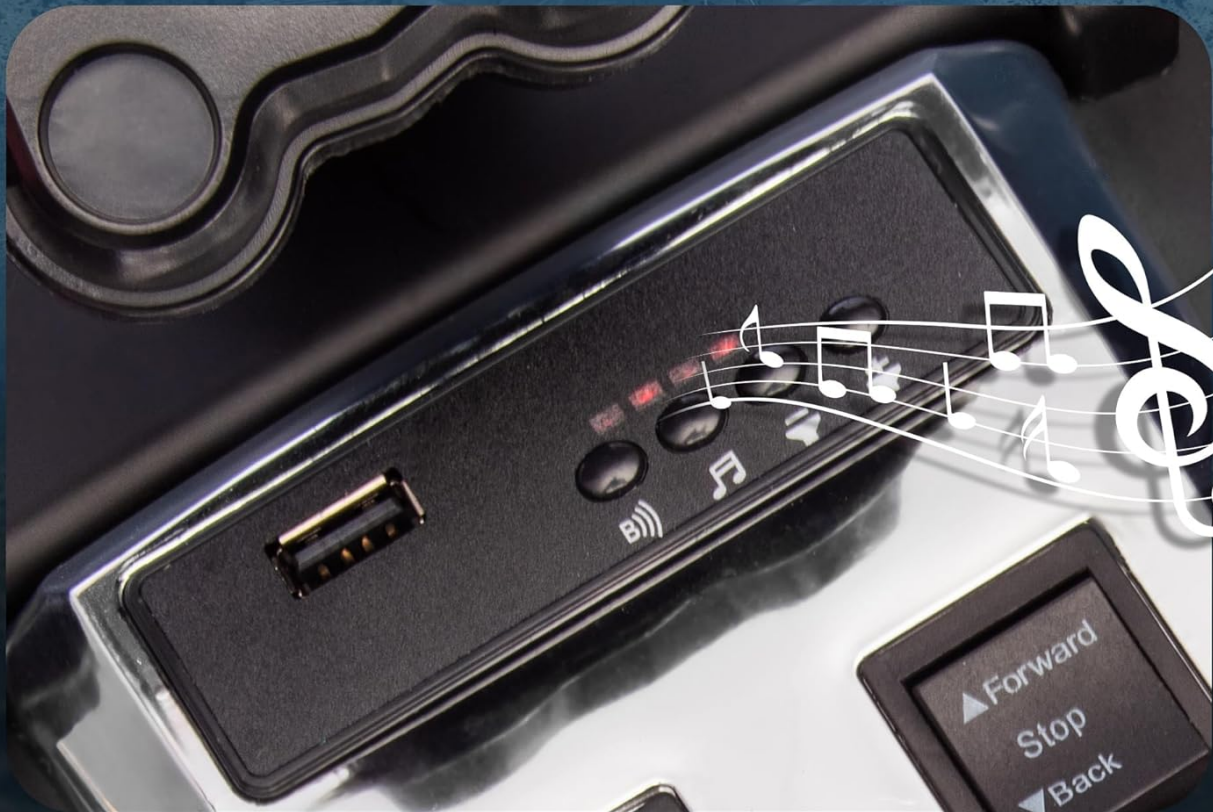
Image: A close-up of the USB port and music control buttons, indicating the functionality for playing audio files. This image helps users understand how to utilize the integrated music feature.