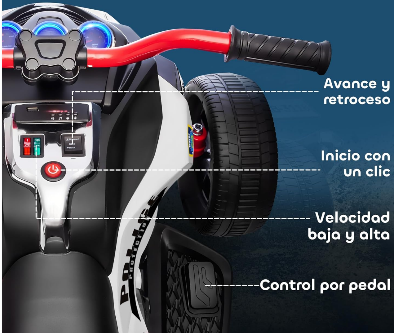
Image: A detailed view of the quad's control panel, highlighting the power button, forward/reverse switch, speed selector, and the USB port for music playback. This image assists users in locating and understanding the vehicle's operational controls.