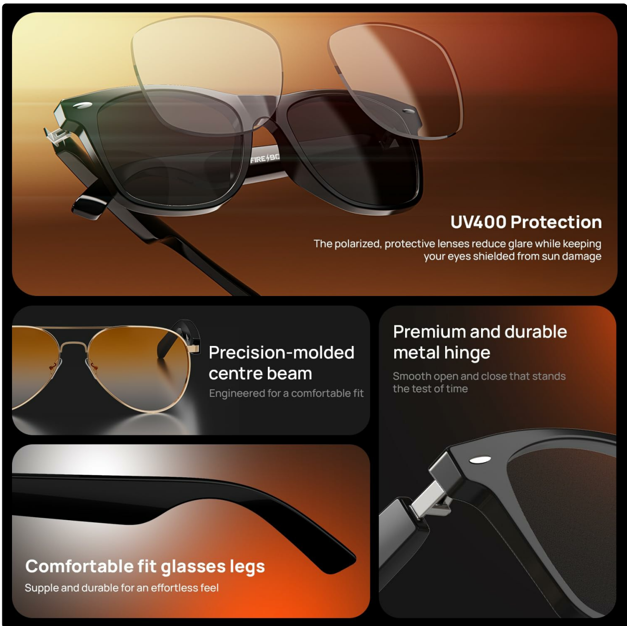
Image: Features contributing to the durability and protection of the smart glasses.