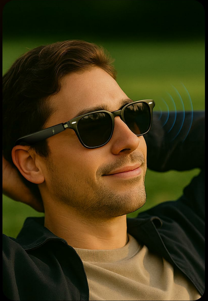
Image: Voice assistant integration and activation.