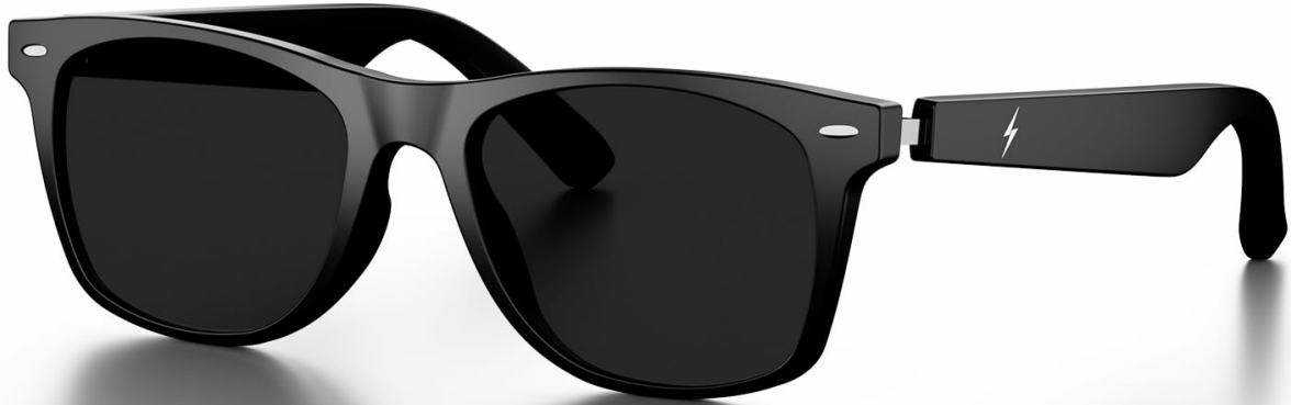
Image: Front view of the Fire-Boltt Fire-Lens Dune Smart Glasses.