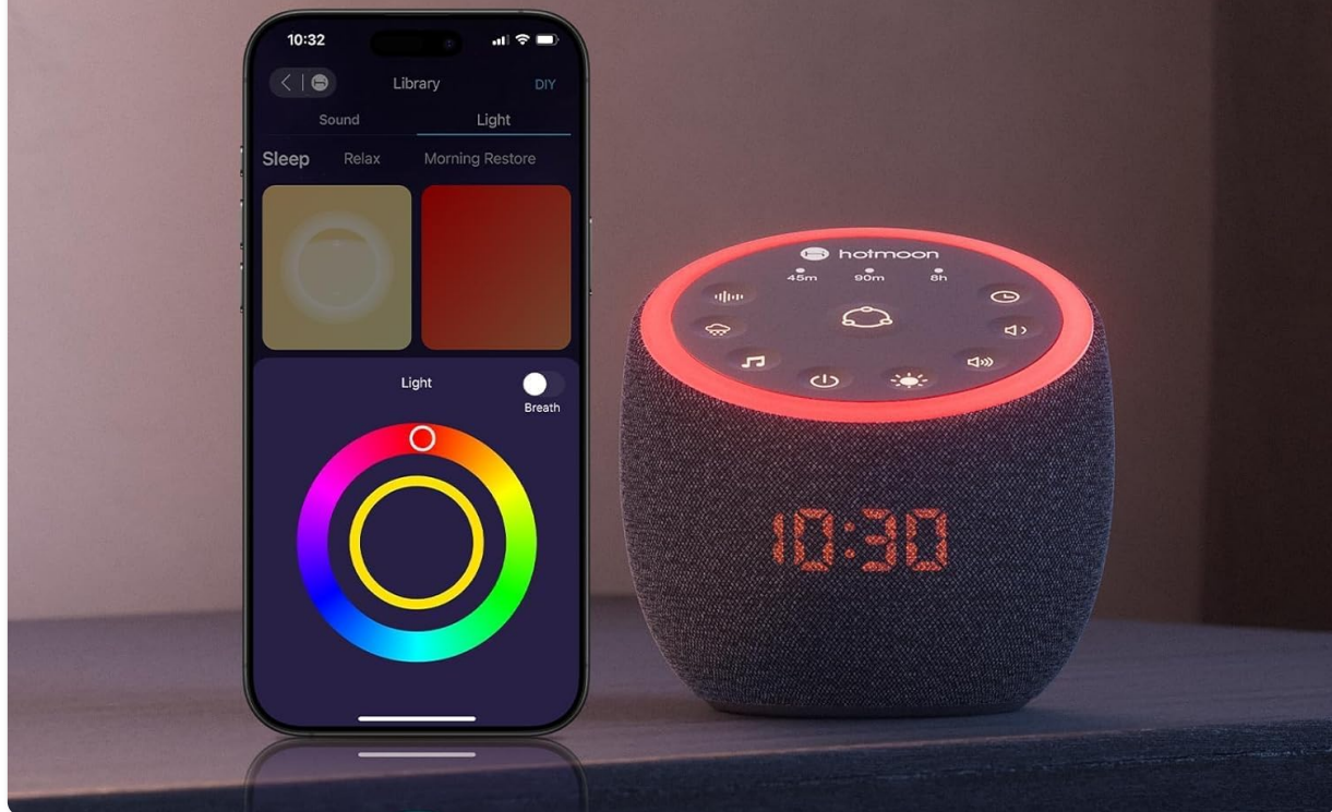
Image: The customizable night light feature of the Cocoon Pro 2.

The integrated night light provides a soft, ambient glow. Use the dedicated Light Button on the device to cycle through preset colors or turn it off. For advanced customization, including color selection, brightness adjustment, and static/breath modes, use the Hotmoon app.