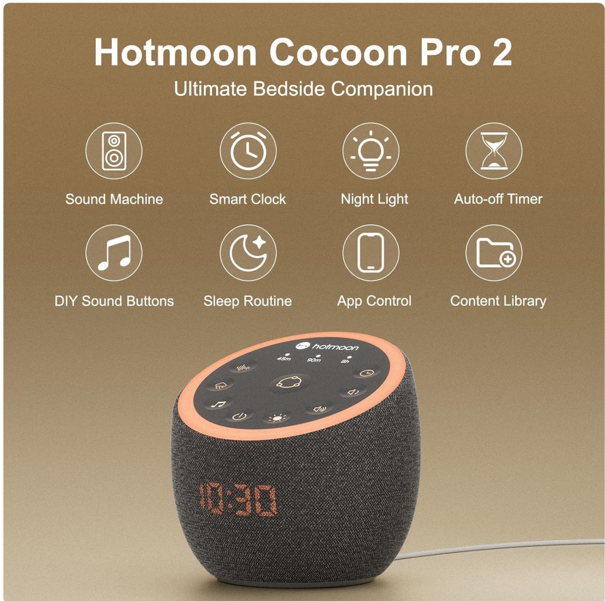
Image: Hotmoon Cocoon Pro 2 with its intuitive touch controls.

The Cocoon Pro 2 features touch-sensitive buttons on its top panel for direct control: