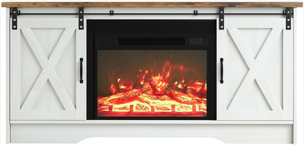
Image: Detailed view of the sliding barn doors, highlighting the metal rails, X-shaped design, and the solid base construction.