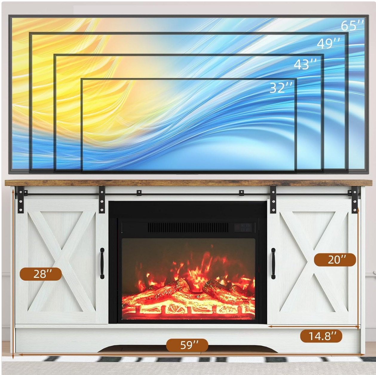
Image: The TV stand shown with different TV sizes to illustrate its capacity for screens up to 65 inches.