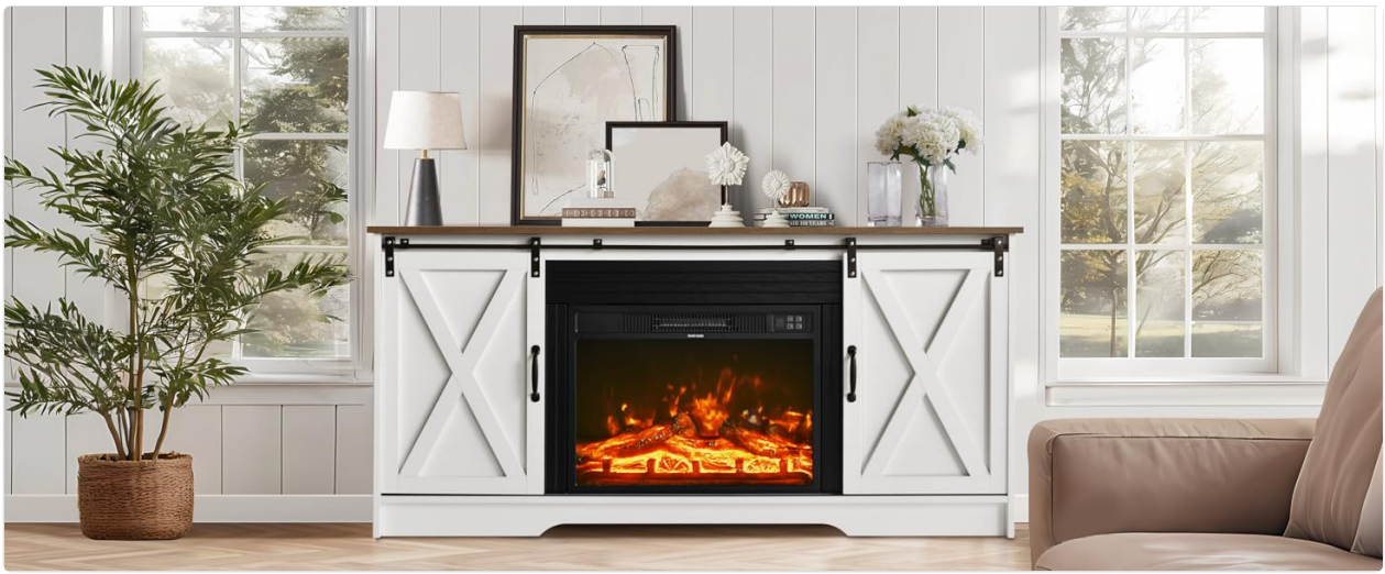
Image: Detailed view of the electric fireplace's realistic 3D flame effect, highlighting its adjustable brightness and the option to operate without heat.