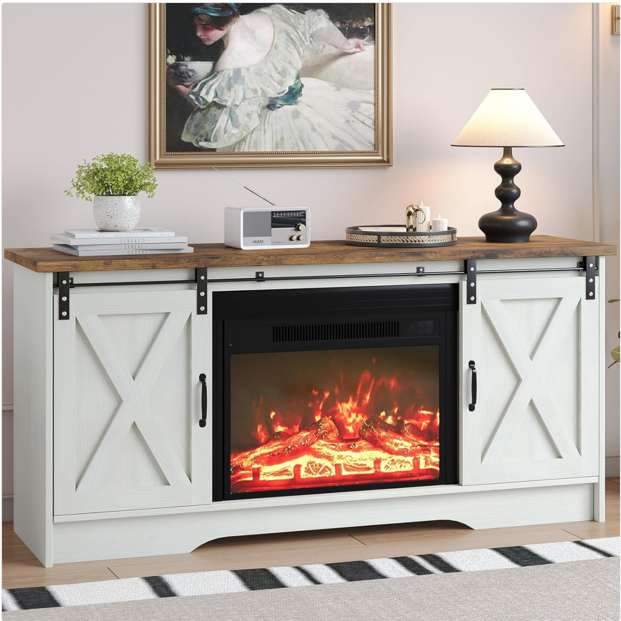
Image: The 4 EVER WINNER Fireplace TV Stand, showcasing its off-white finish, wooden top, central electric fireplace, and sliding barn doors.