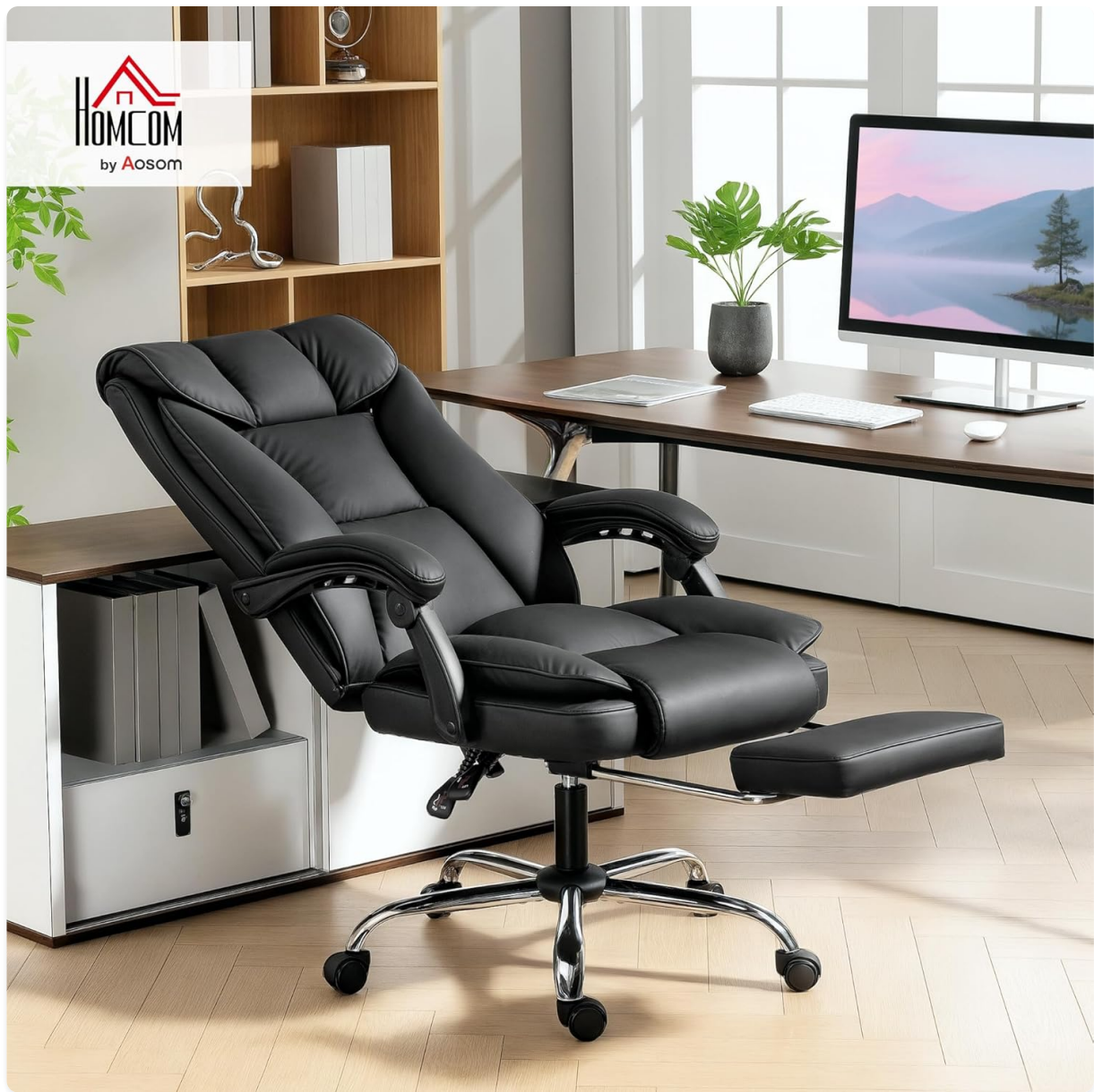
The HOMCOM Executive Office Chair with Footrest, designed for comfort and functionality in a home or office environment.